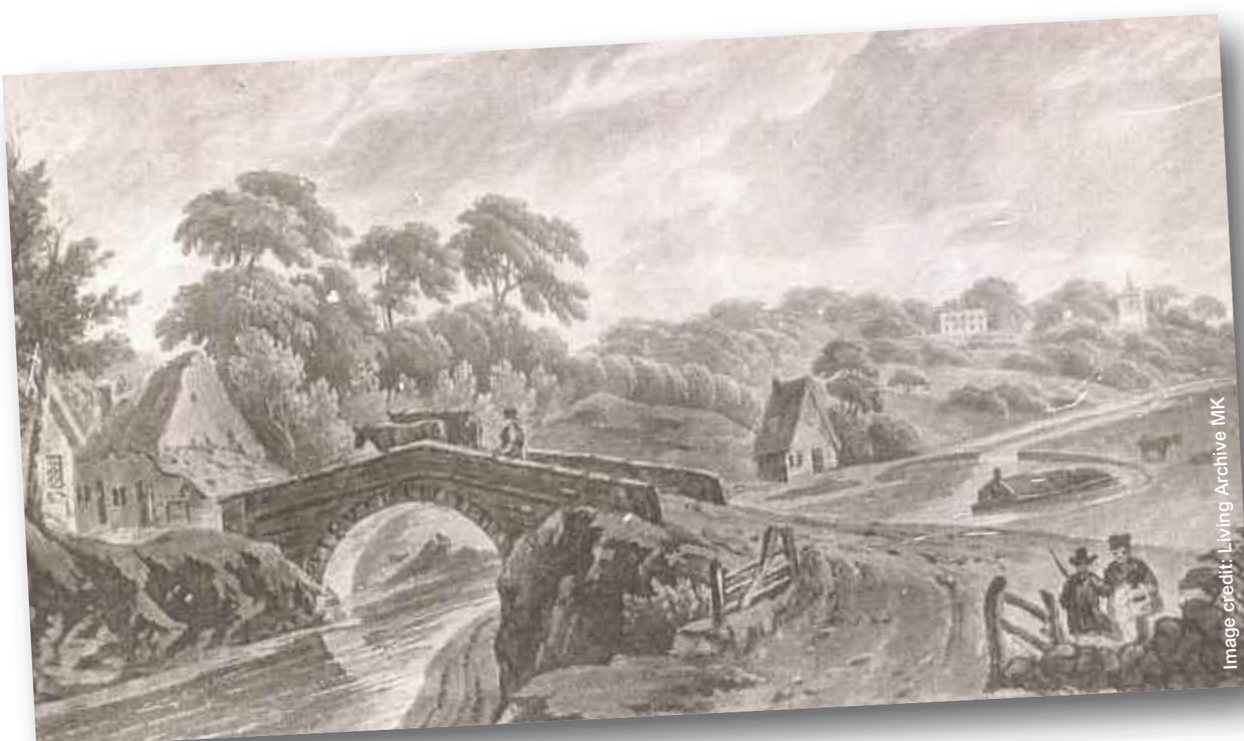
The Grand Junction Canal in Wolverton

The old open field system of farming where people's land was scattered in strips spread out across a large area was ending. Through the Enclosure Act a person's land was brought together into one place. This Act resulted in more hedges and ditches appearing in the landscape.