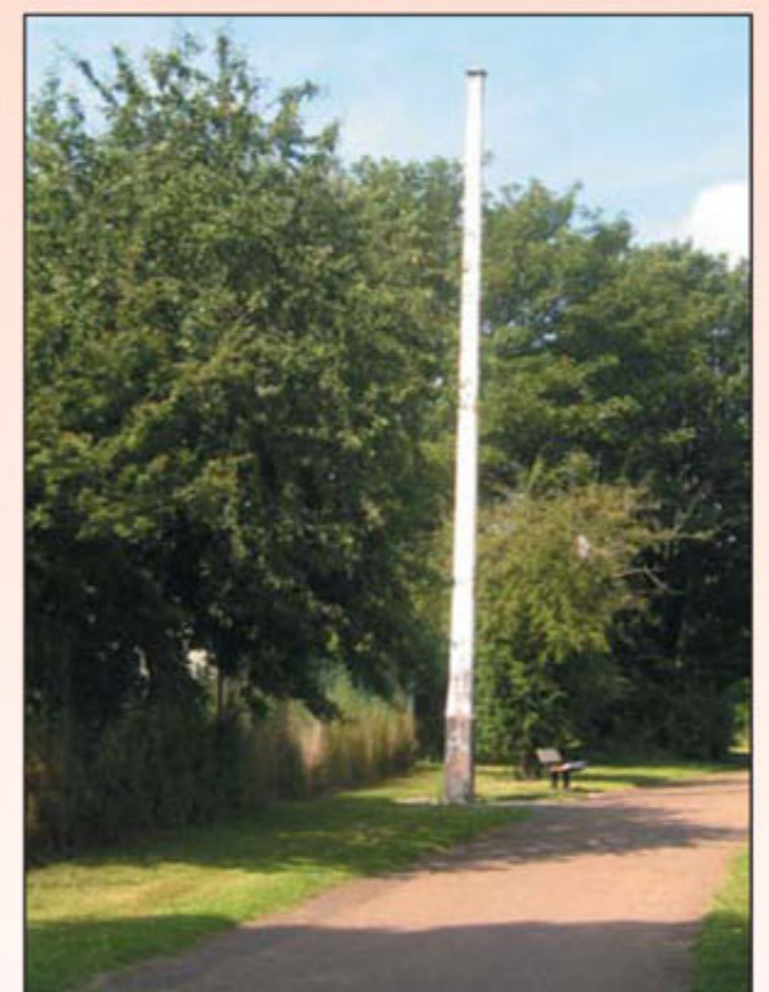
Railway Walk and the signal post June 2010

Today you can stand on Railway Walk, and the sidings of the railway are now allotments.