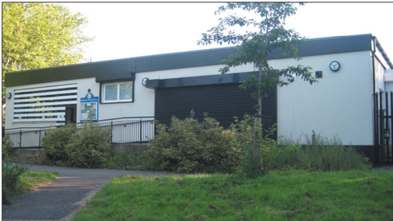
Moorlands Community Centre in Beanhill