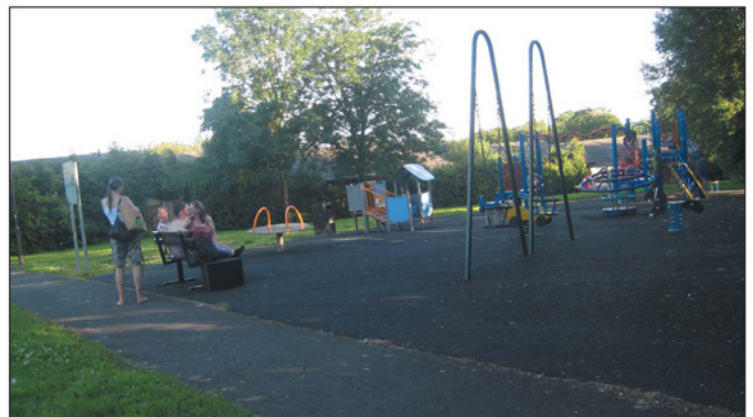
The park where the Tin Man is located

Beanhill is a wonderful estate because I live there. It has lots of parks and places to hang around. We have our own little shops to go buy accessories or sweets and drinks we also have a school and nursery. We also have lots of meeting places and areas for younger children to come and play.