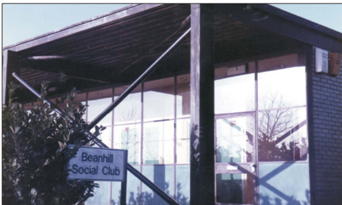
Outside view of Beanhill Social Club, 1980s