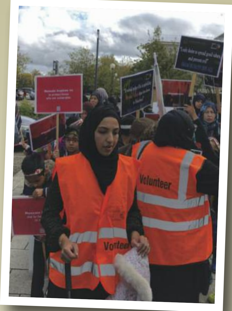
Volunteers 2019 Peace & Humanity Procession at CMK