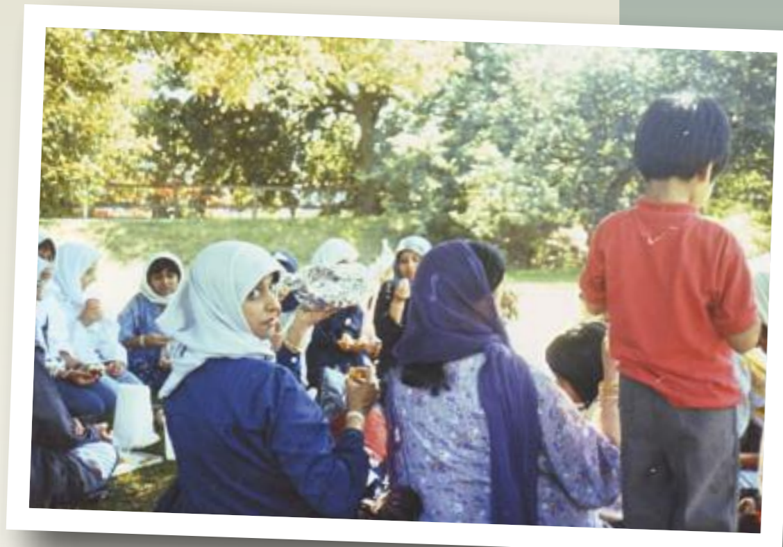
Zainabiya Madrasah staff and students visit Drayton Manor Park in 1987