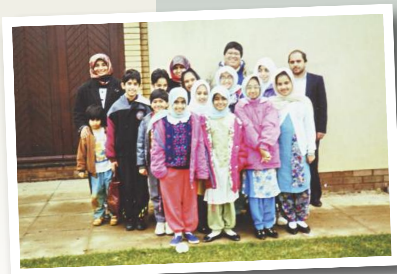
Group Madrasah Annual Trip Photo 1989