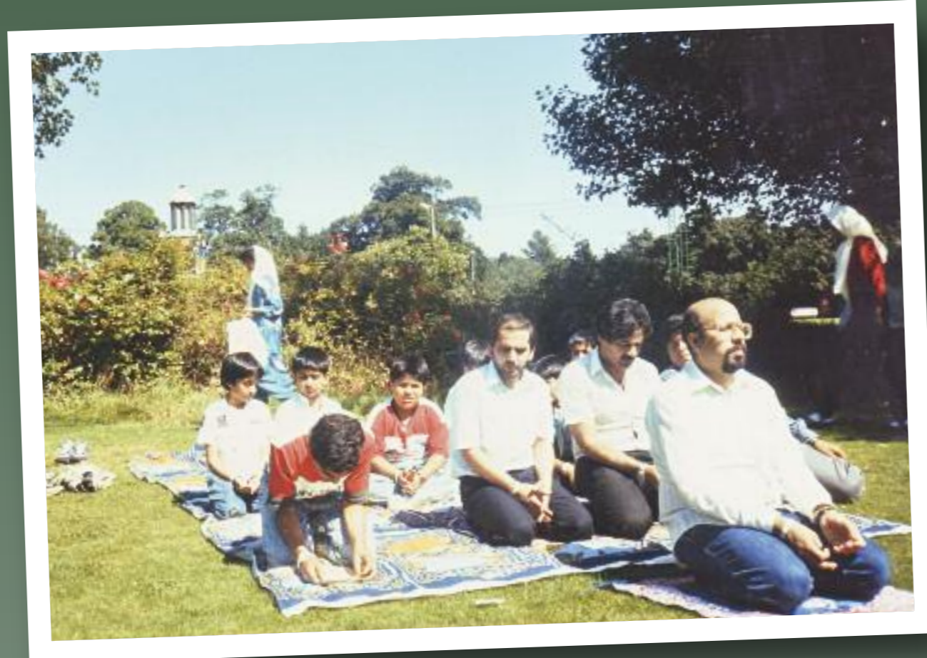
Salat at Drayton Manor Park - Madrasah trip