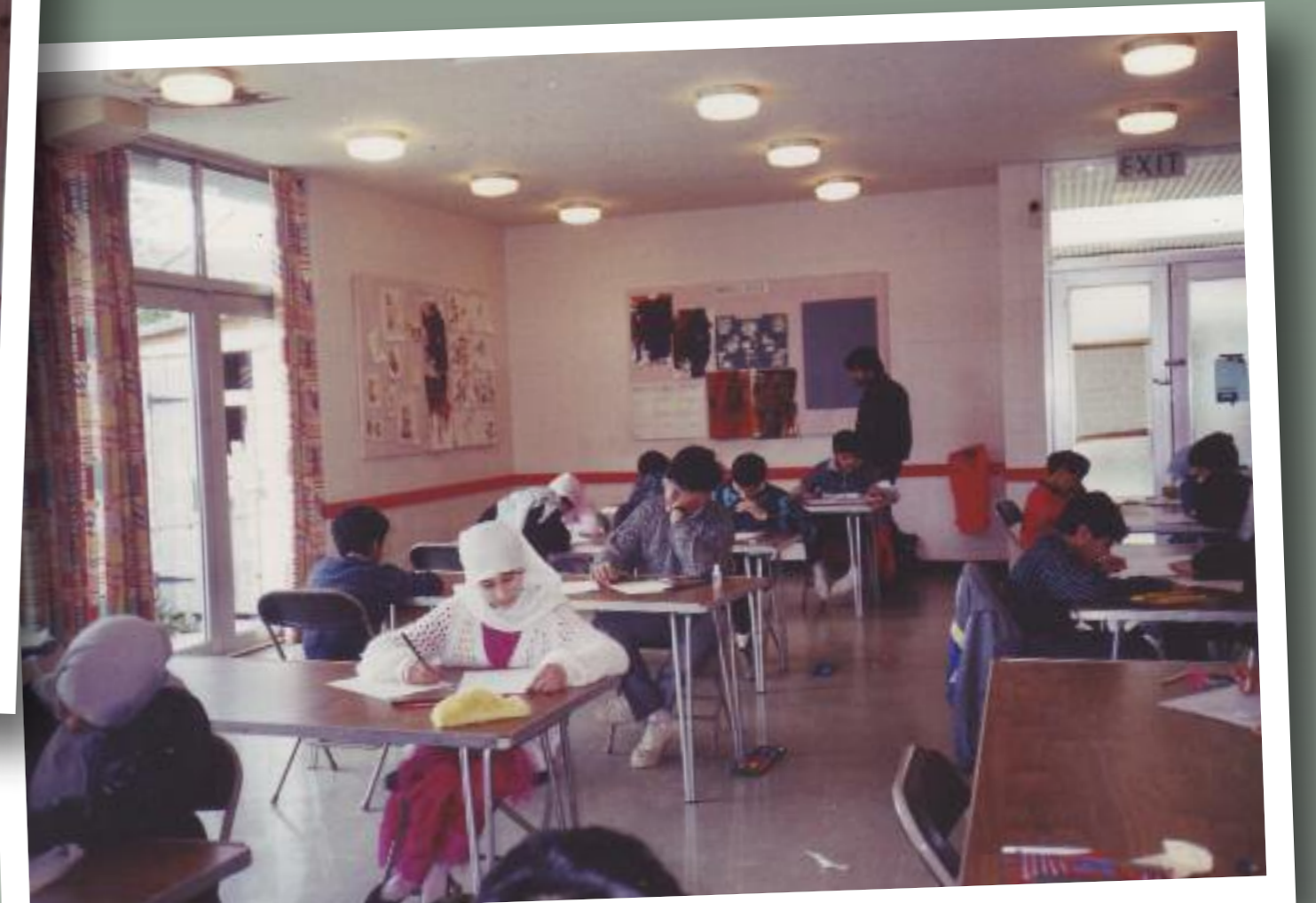
Annual Madrasah Exams at Tinkers Bridge Hall 1987