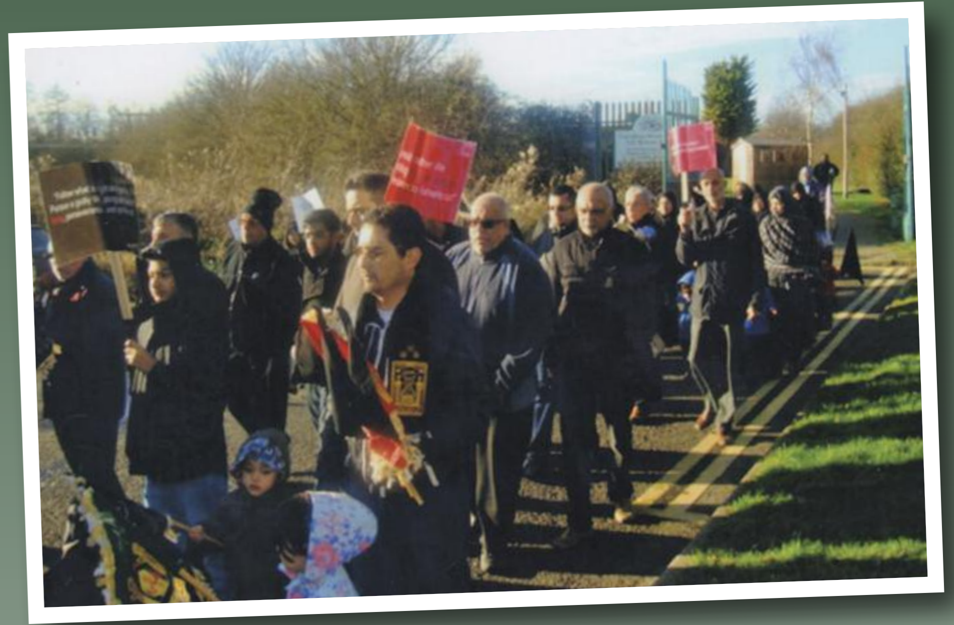
Peace & Humanity Procession December 2013