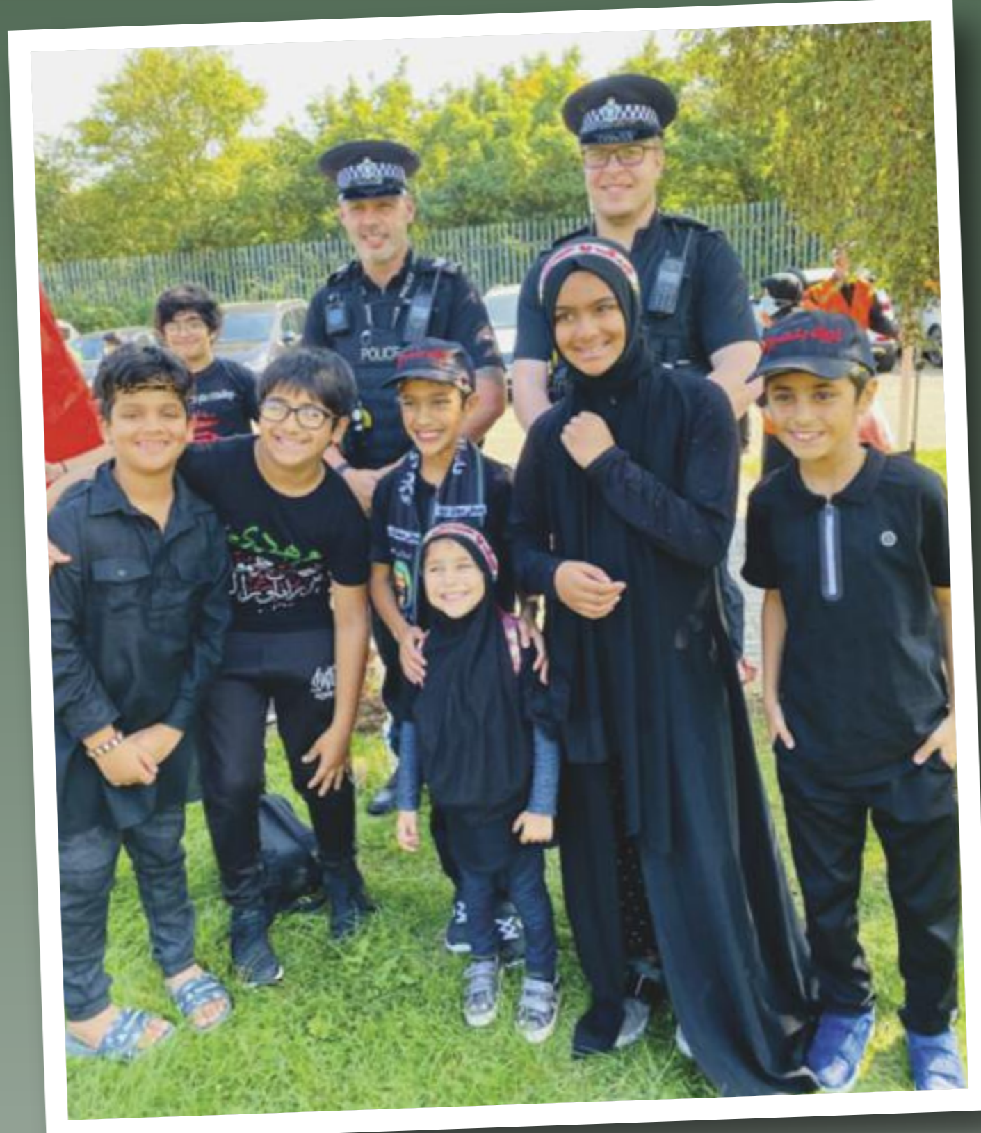
Thames Valley officers with children at 2021 Peace & Humanity Procession