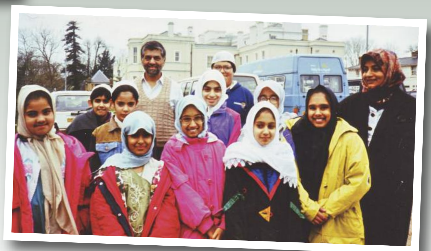
Annual Madrasah trip to Shia Ithnasheri Madrasah in Stanmore 1989