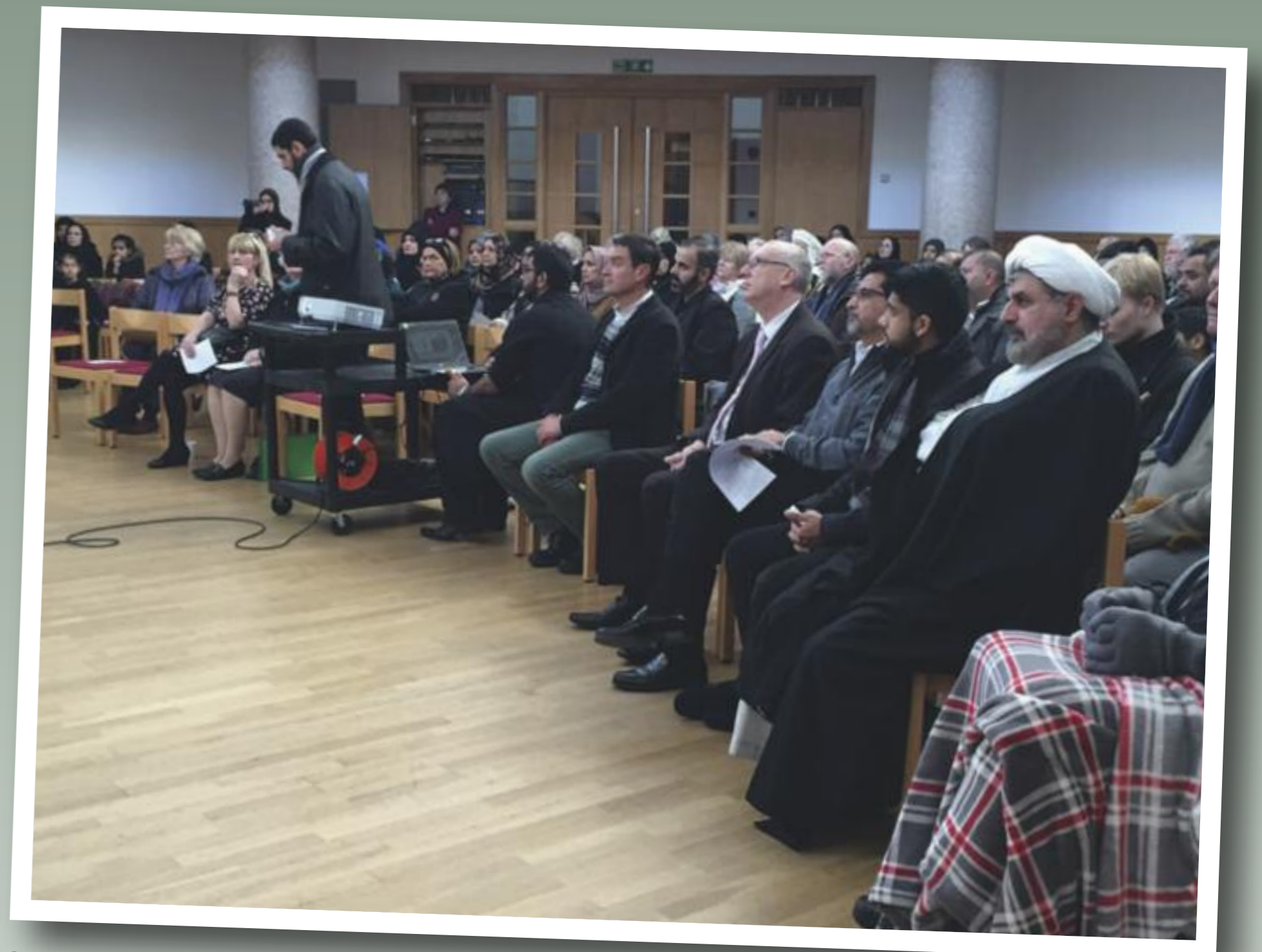
Interfaith Program at the Annual Peace and Humanity Procession 2015