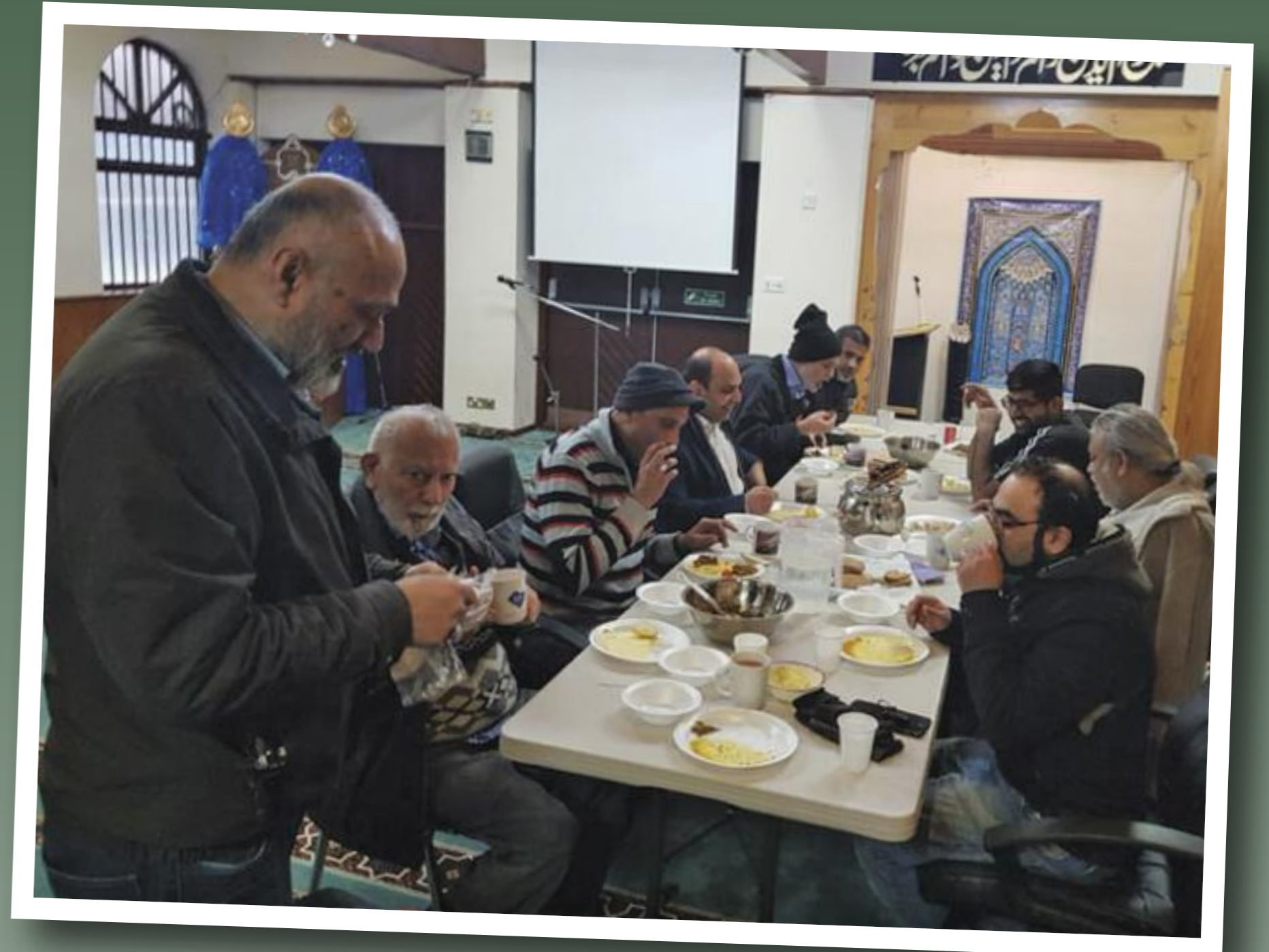
2017 - Sunday Fajr Programme: Members of Zainabiya Islamic Centre having breakfast after Fajr prayers