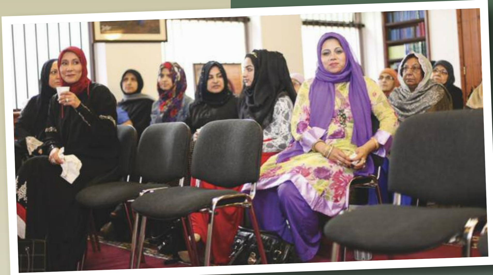
Zainabiya Islamic Centre 25 years Celebration event