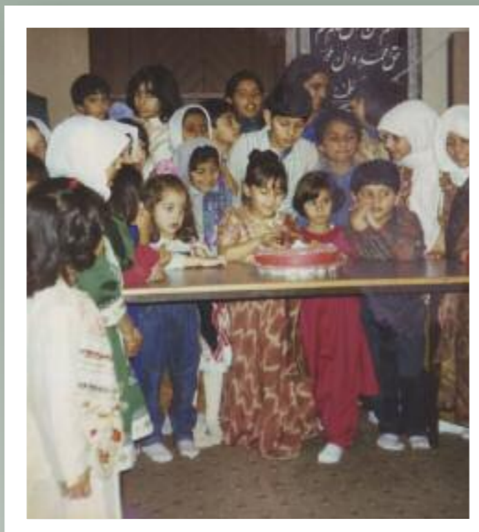
Imame Zamana Day Zainabiya Madrasah students’ celebration