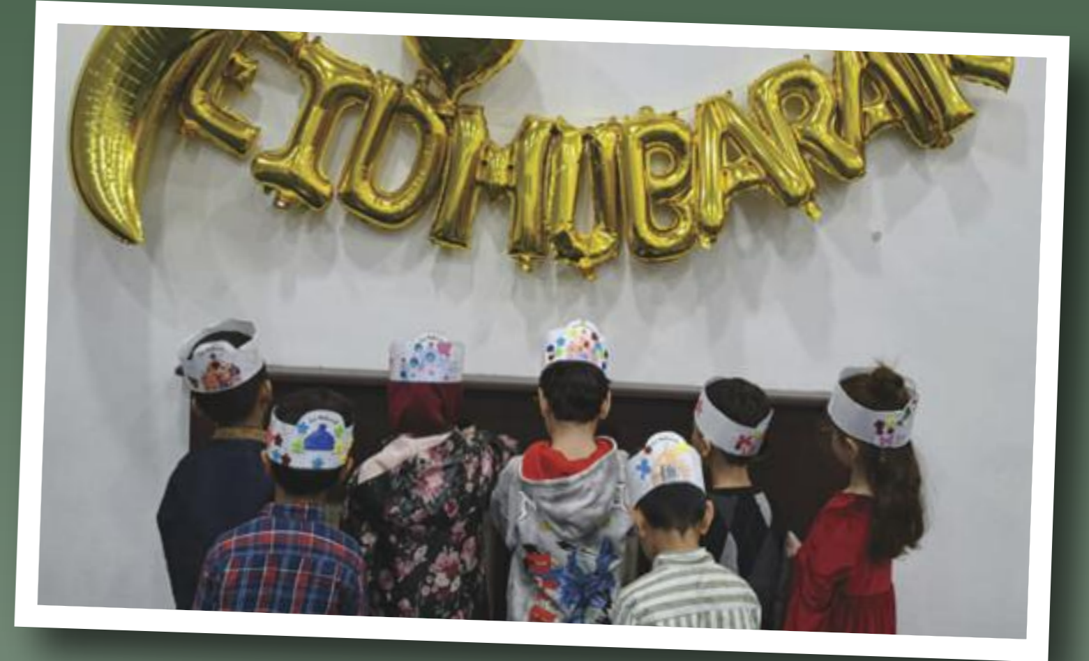
Eid celebration at Zainabiya Madrasah