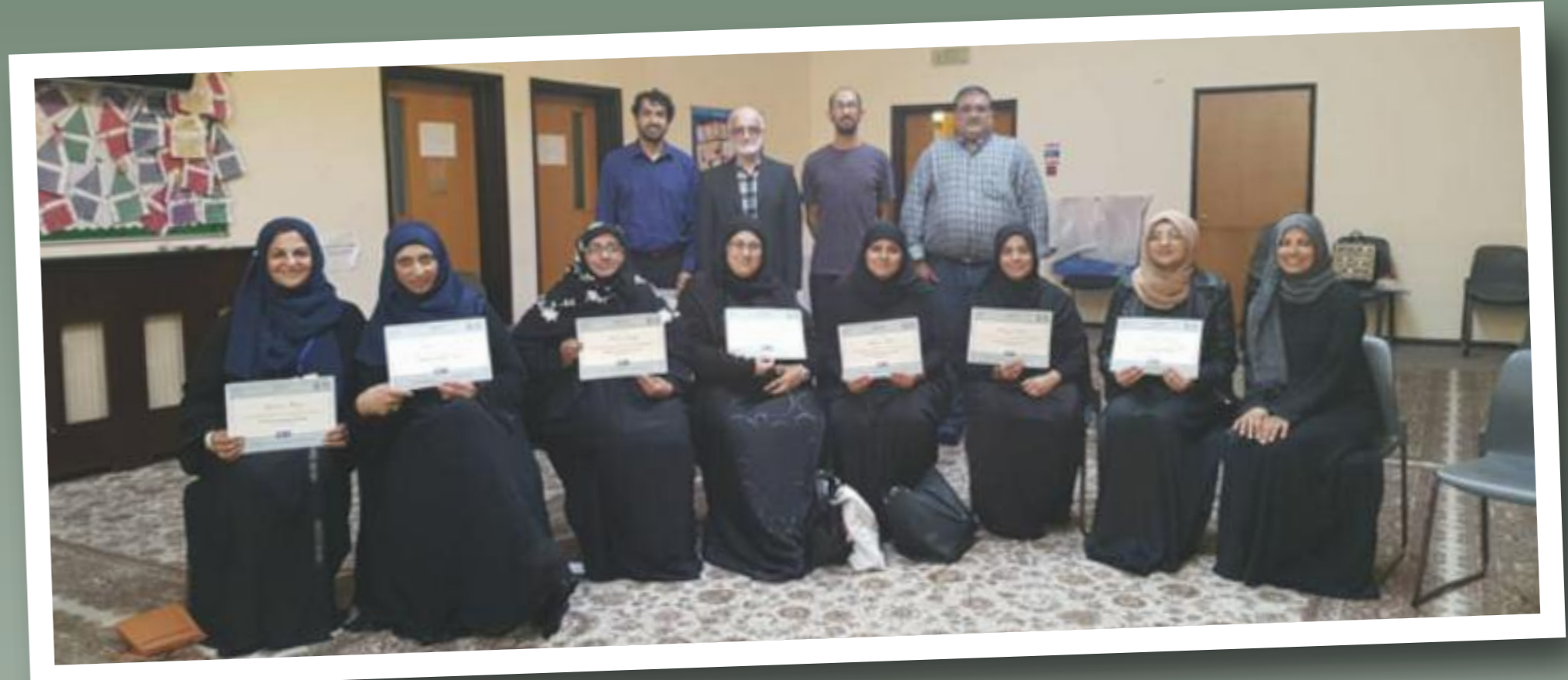
Zainabiya Madrasah Teacher Training Session