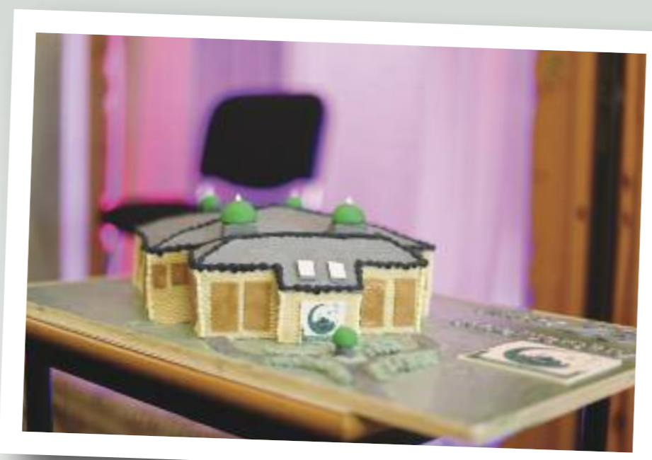
25 years of the Centre celebration cake