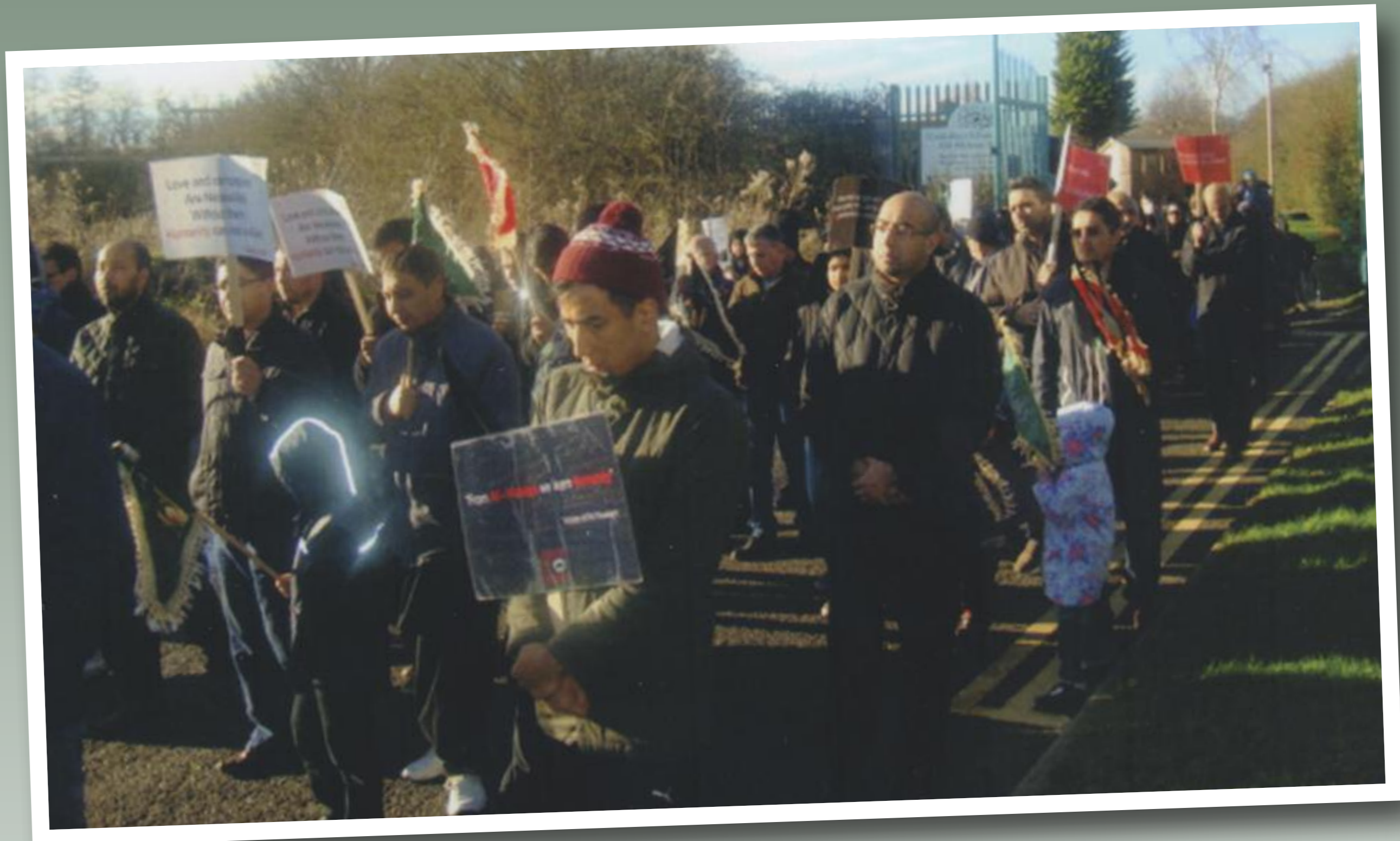
Peace & Humanity Procession December 2013