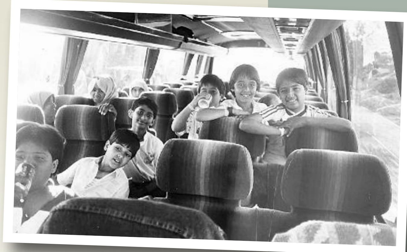
Zainabiya Madrasah trip to Drayton Manor Park 1986