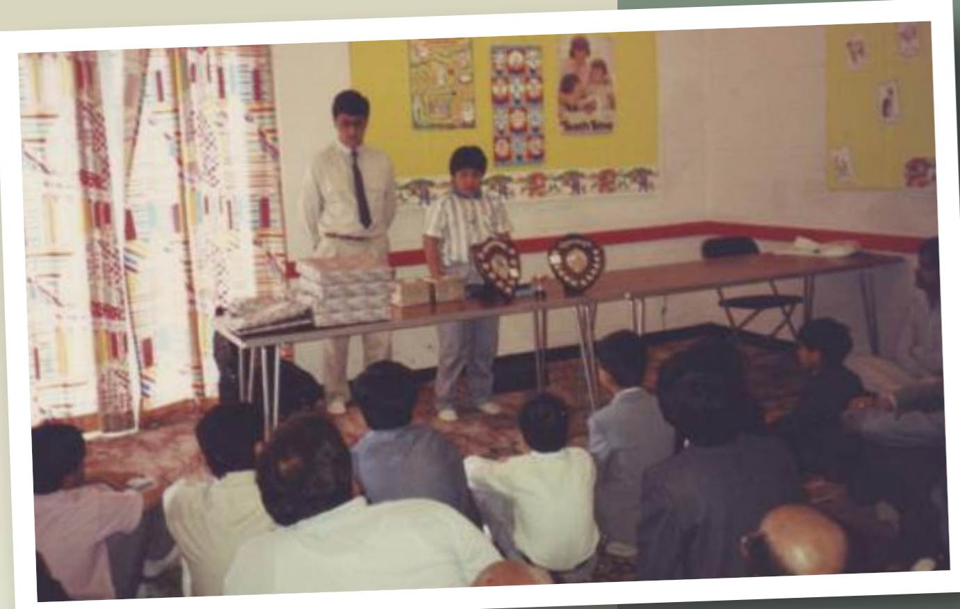
Zainabiya Madrasah “Eid function” 1986 at Tinkers bridge