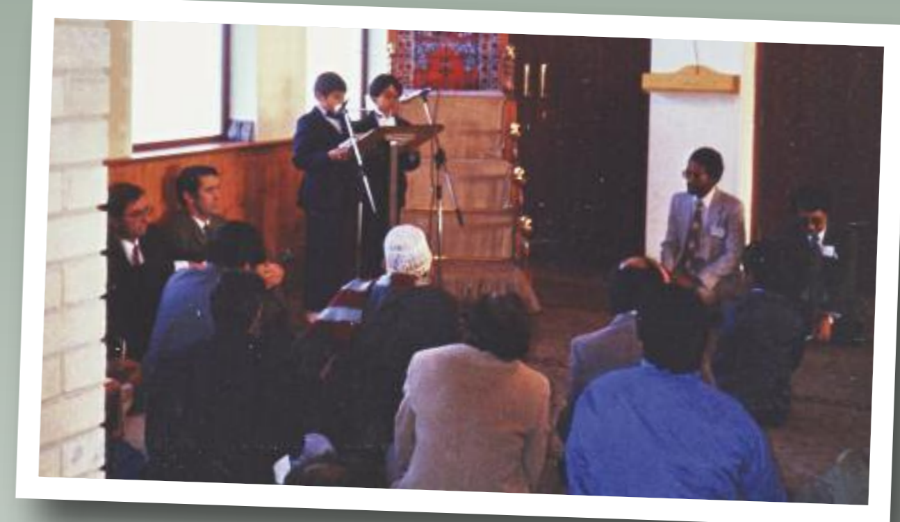
Zainabiya Islamic Centre opening, August 1988