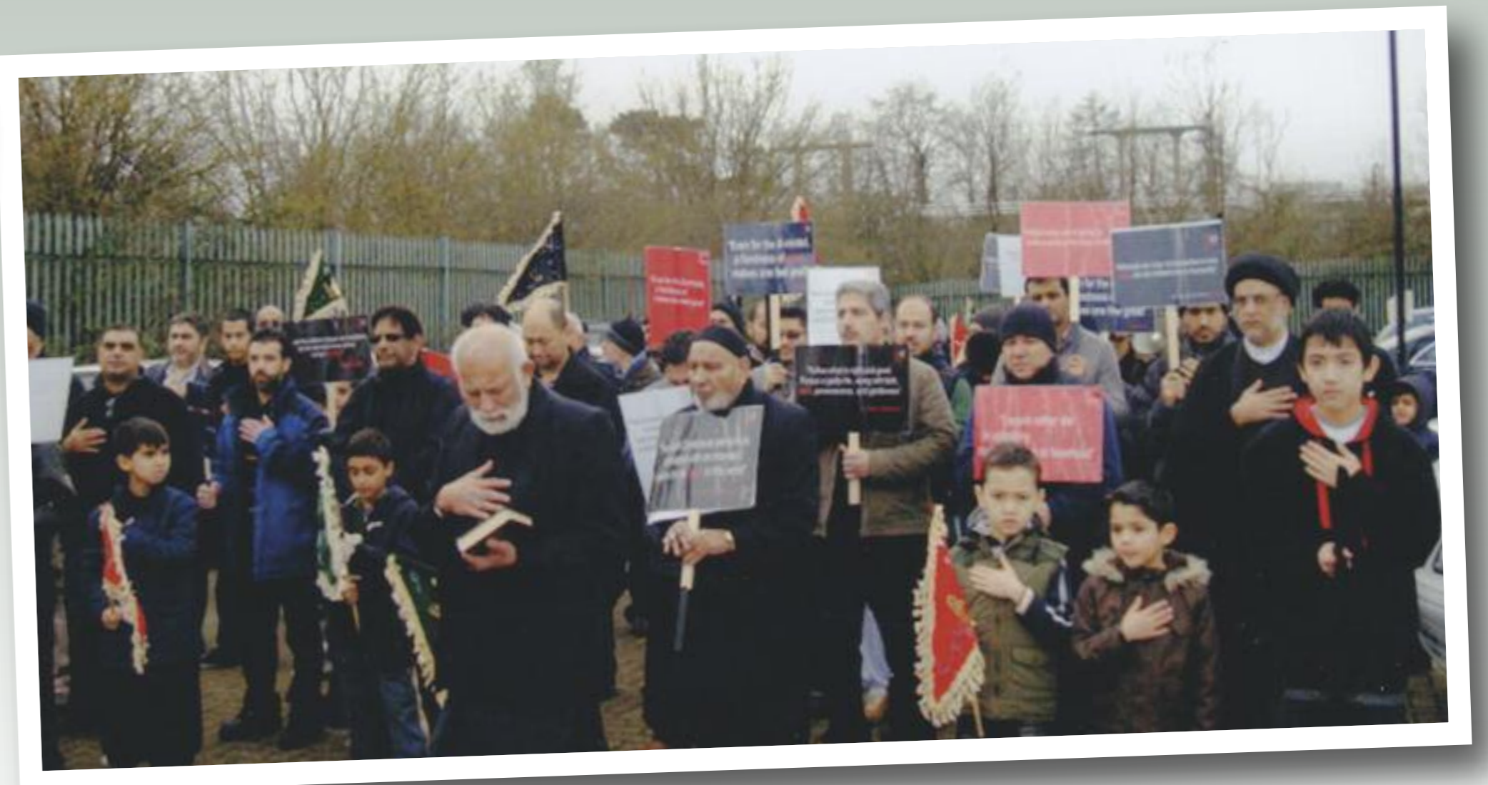
Peace & Humanity Procession December 2013