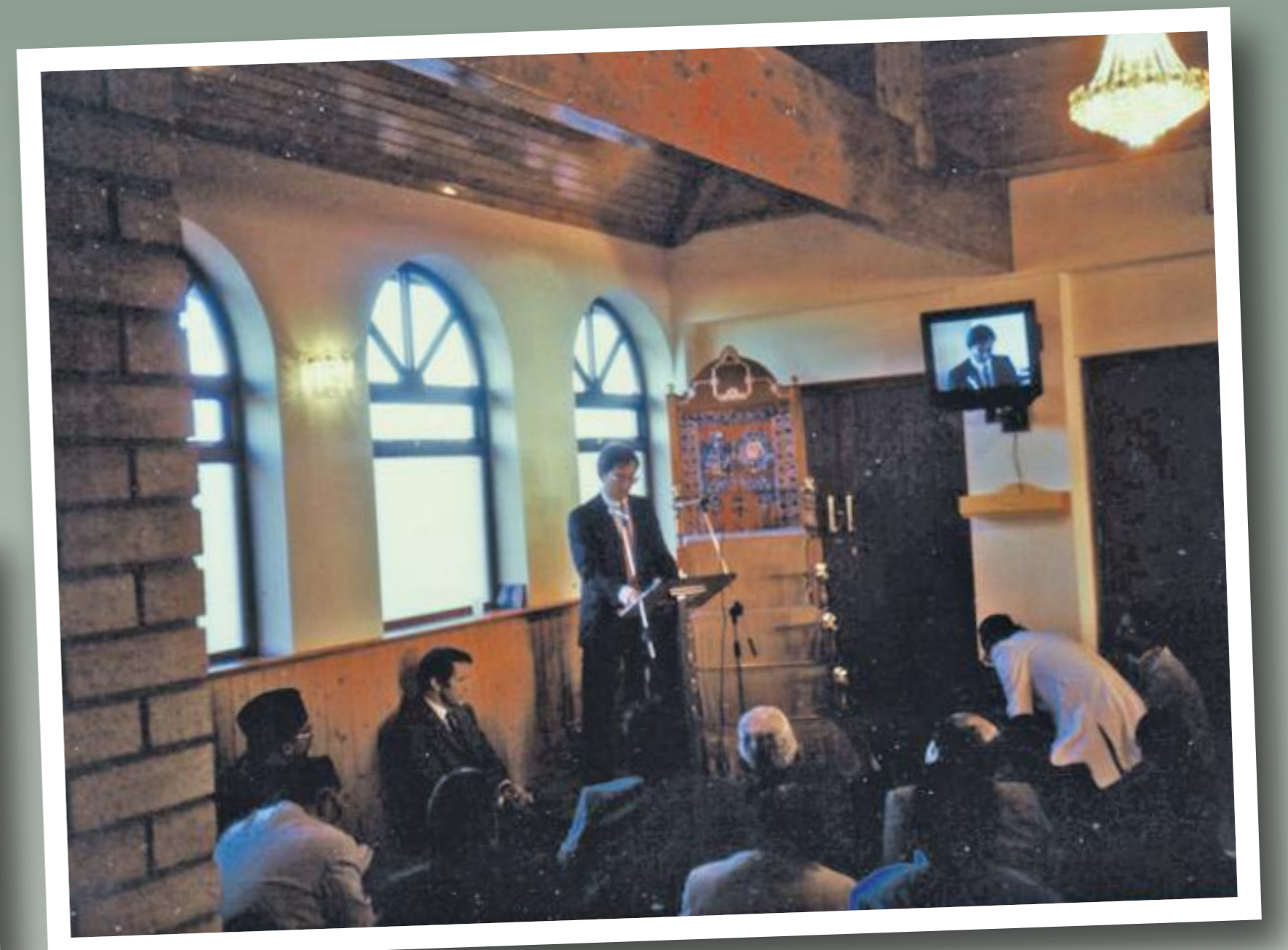
Opening Ceremony of Zainabiya Islamic Centre in 1988