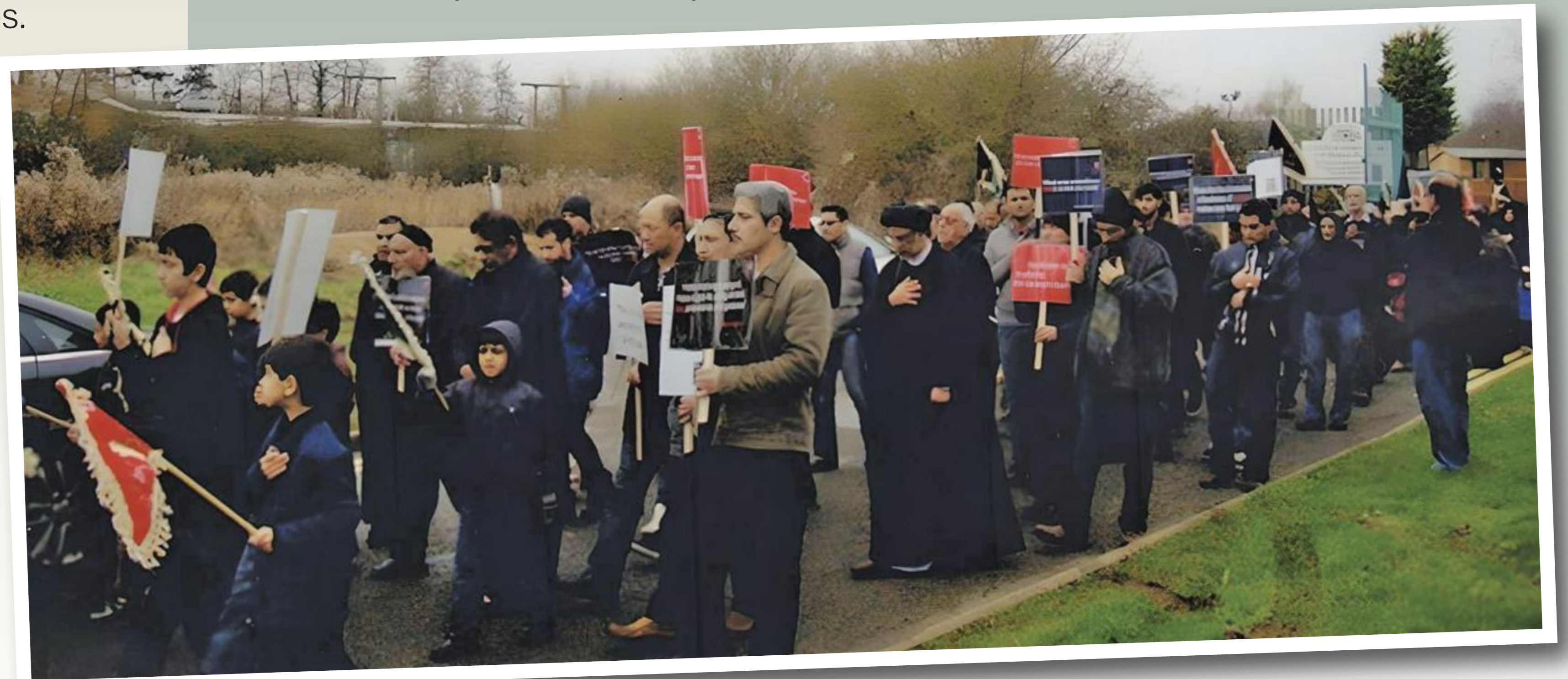
Peace & Humanity Procession, January 2013