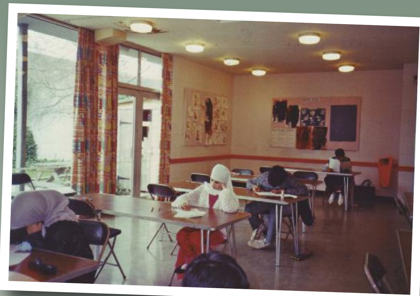
Annual Madrasah Exams at Tinkers Bridge Hall 1987