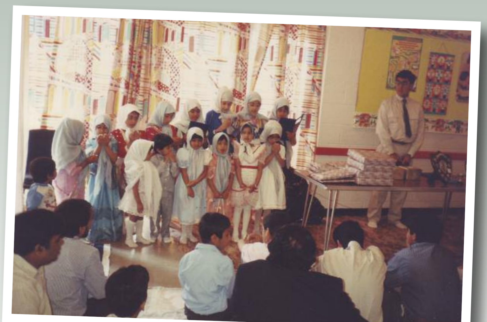
"Eid Function" at Tinkers Bridge Hall in 1989 before Zainabiya Islamic Centre was built