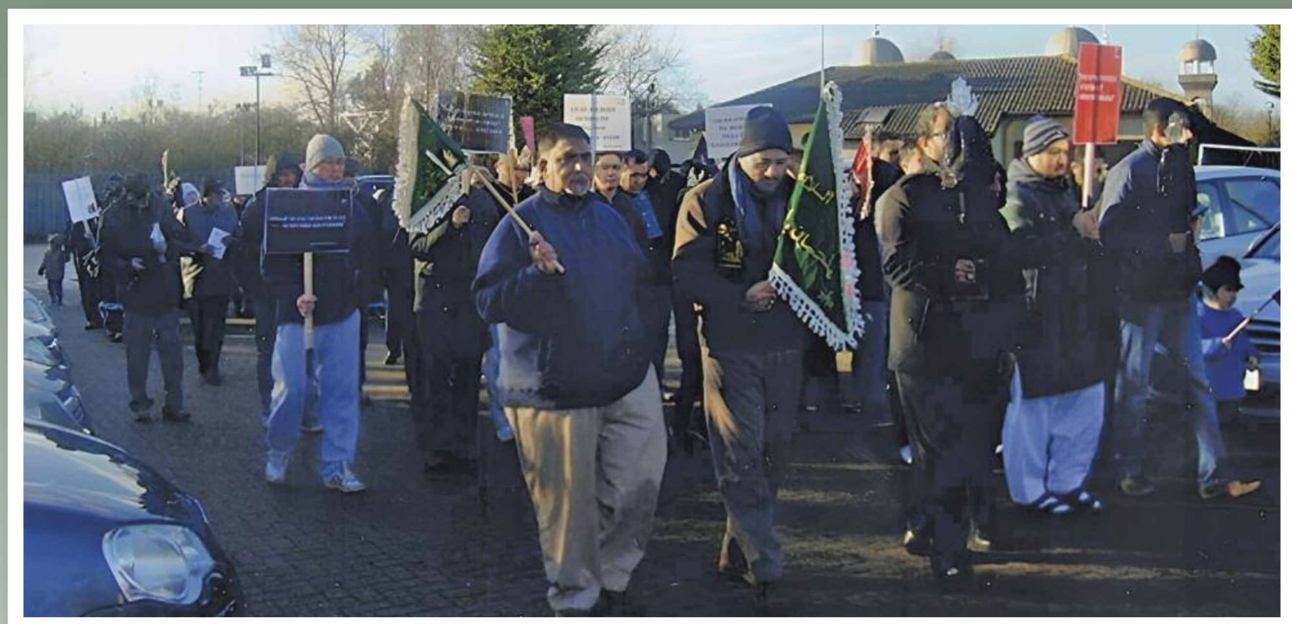
Peace & Humanity Procession, January 2013