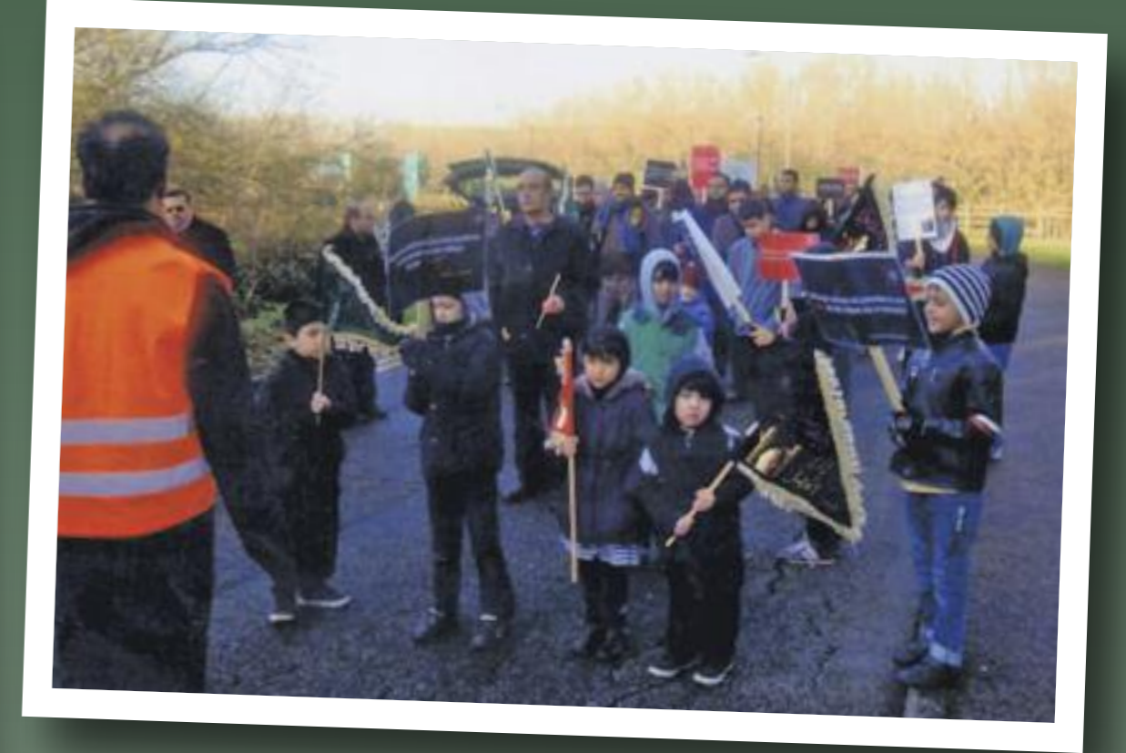
Peace & Humanity Procession, December 2013