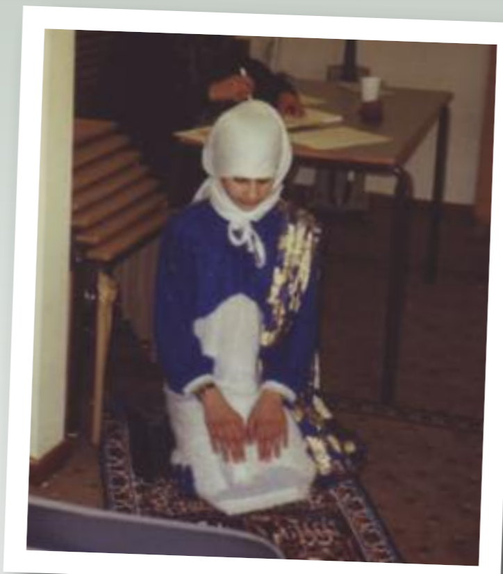
Zainabiya Madrasah Salaat Examinations by External examiner at Zainabiya Islamic centre 1989