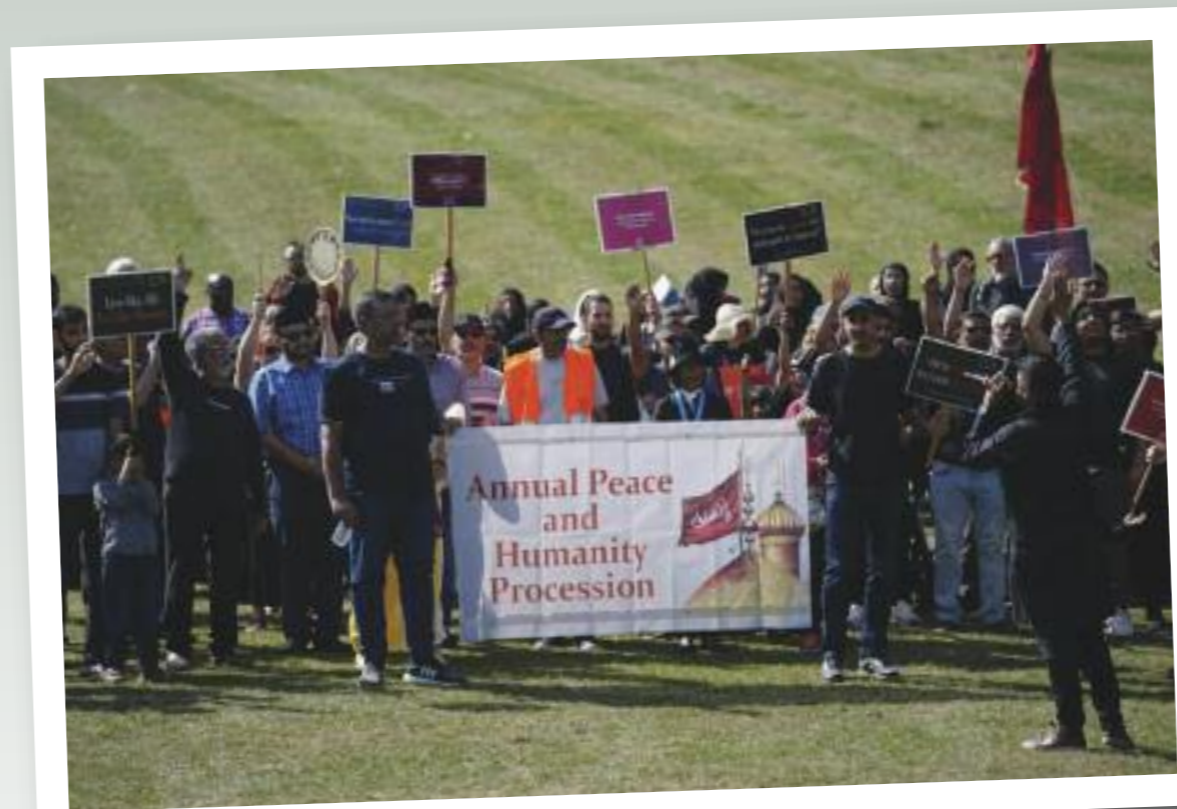
The 30th Annual Peace and Humanity Procession in Amphitheatre Campbell Park 2024