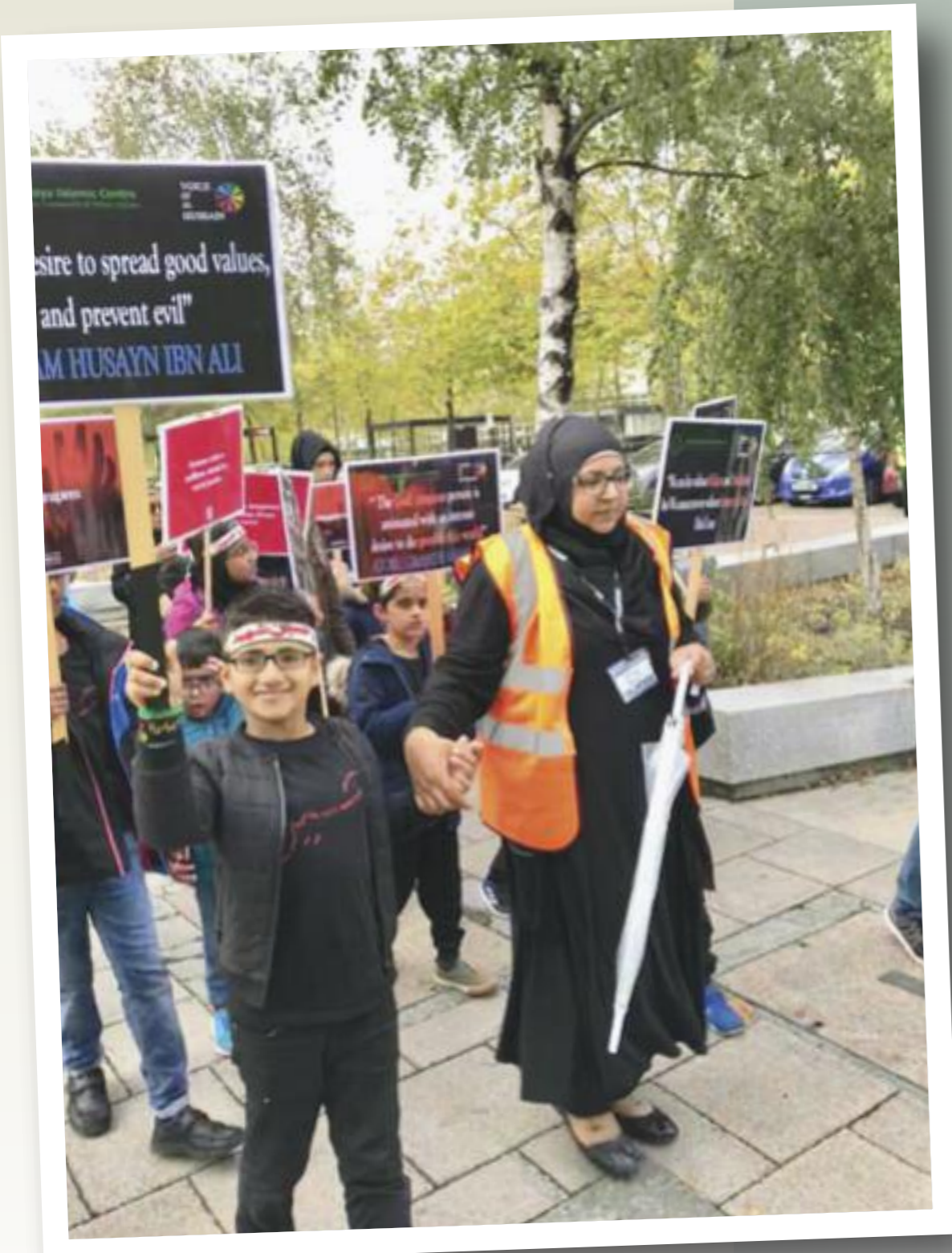
2019 Peace & Humanity Procession at CMK