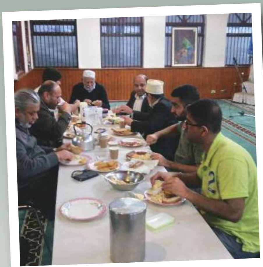
Sunday Fajr Programme Morning prayer breakfast