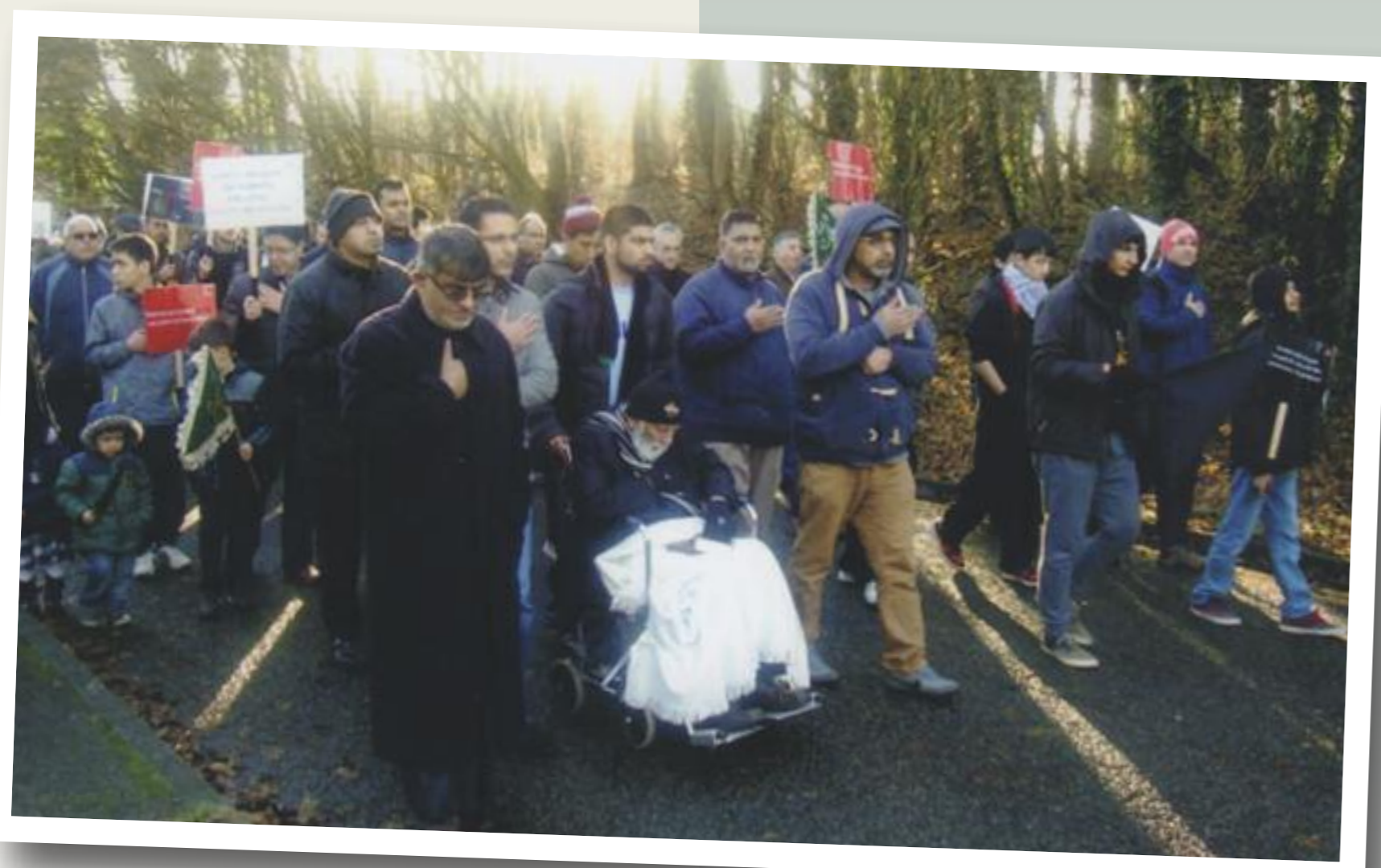
Peace & Humanity Procession, December 2013