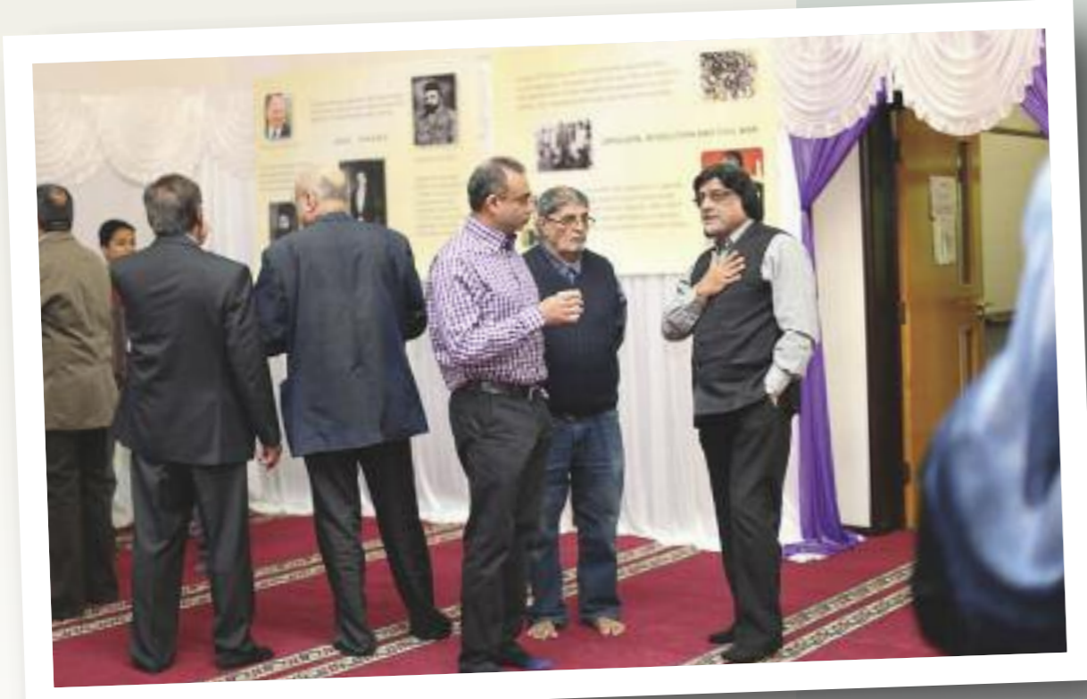
25 years of the Centre celebration