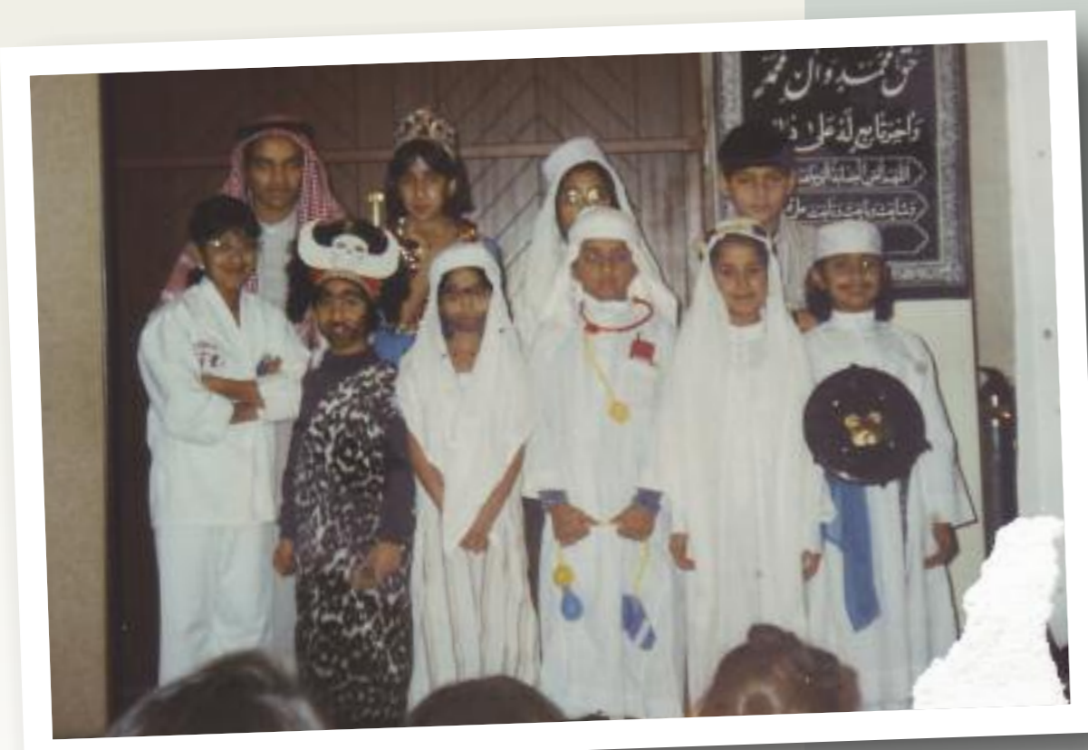
Zainabiya Madrasah Children’s Annual “Eid Performance” 1989