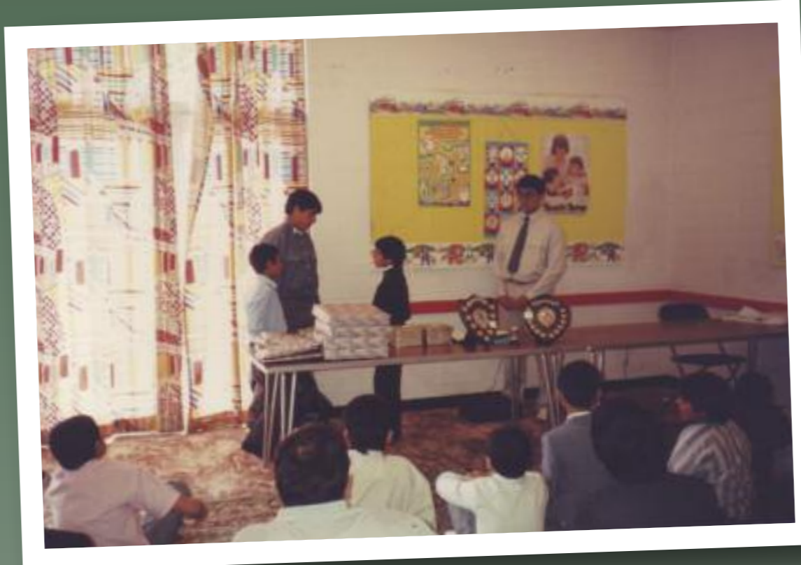
Zainabiya Madrasah play by students “Eid function” 1986 at Tinkers bridge