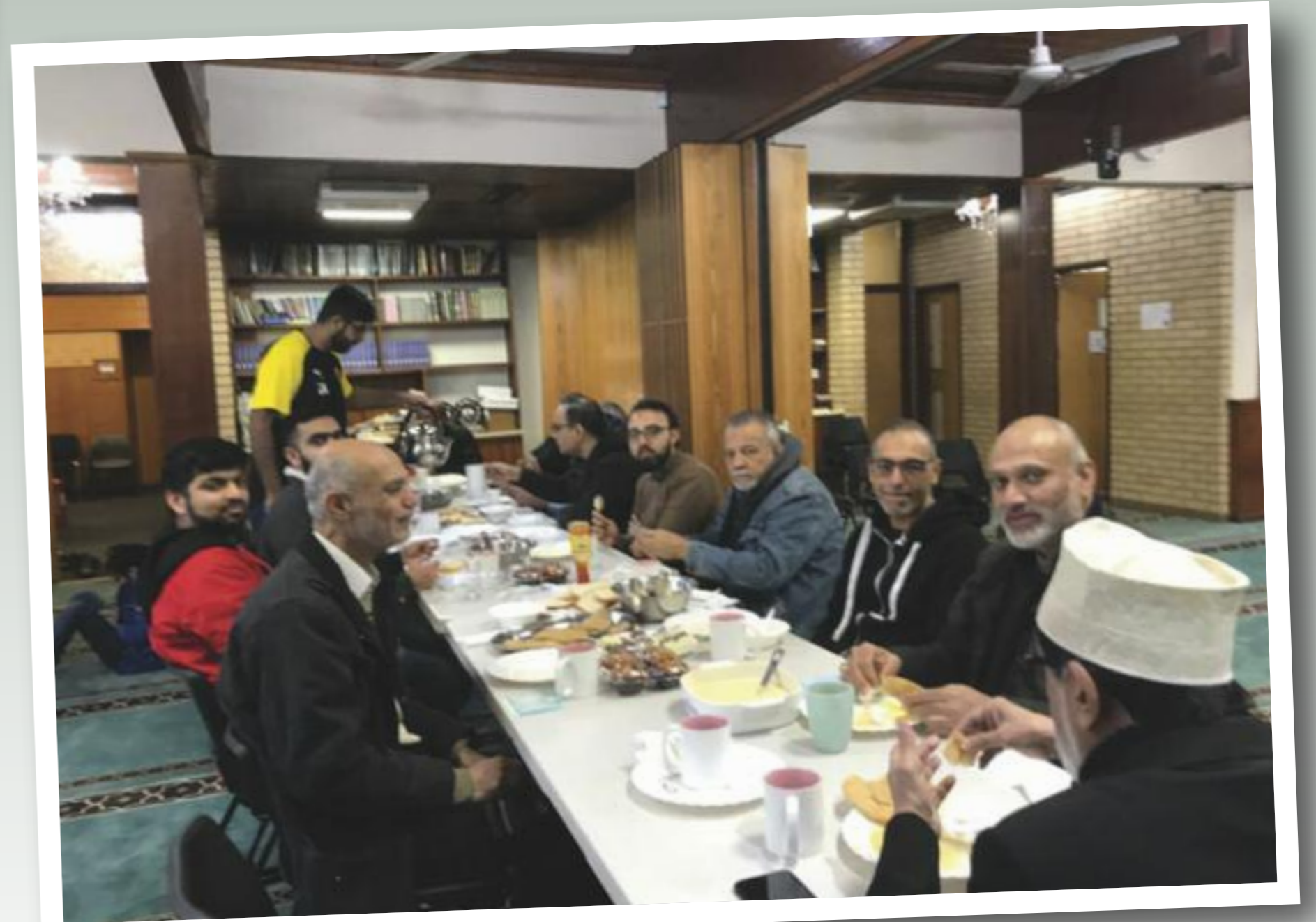
Breakfast after Sunday Fajr Prayers 2020