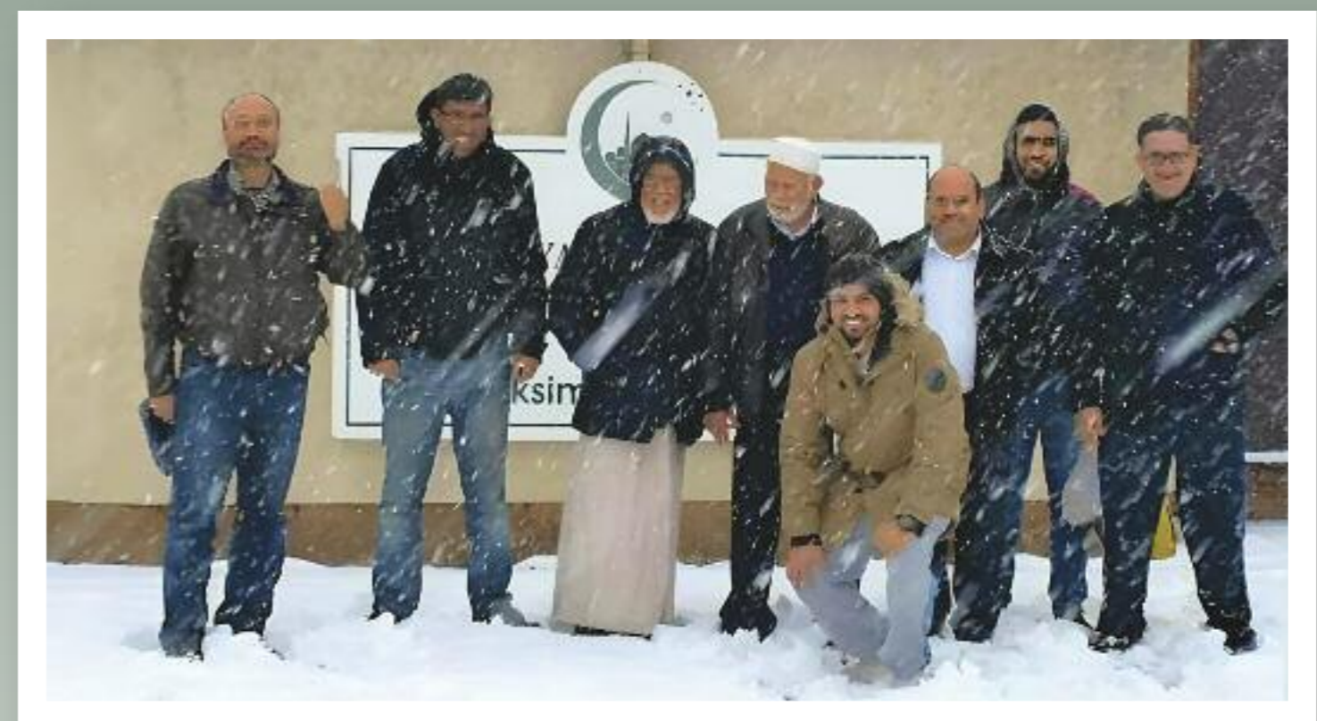
Sunday Fajr Group on a snowy winter Sunday