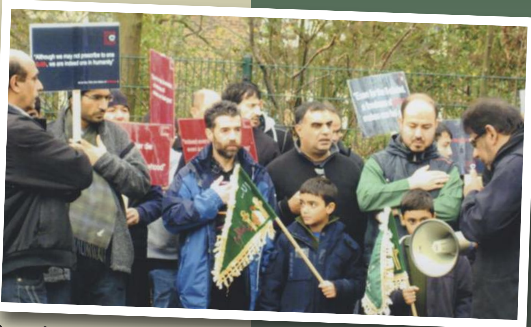
Peace & Humanity Procession, December 2013