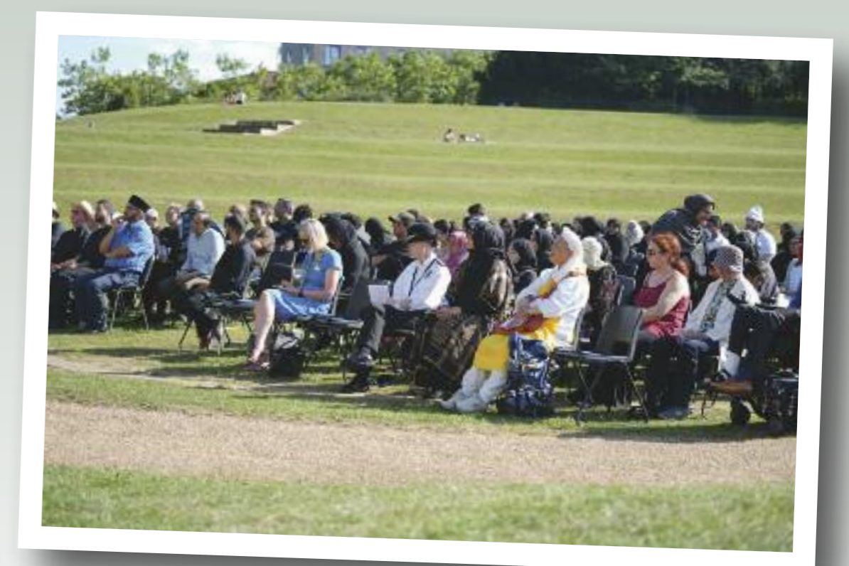
The Interfaith program at the 30th Annual Peace and Humanity Procession in Amphitheatre Campbell Park 2024