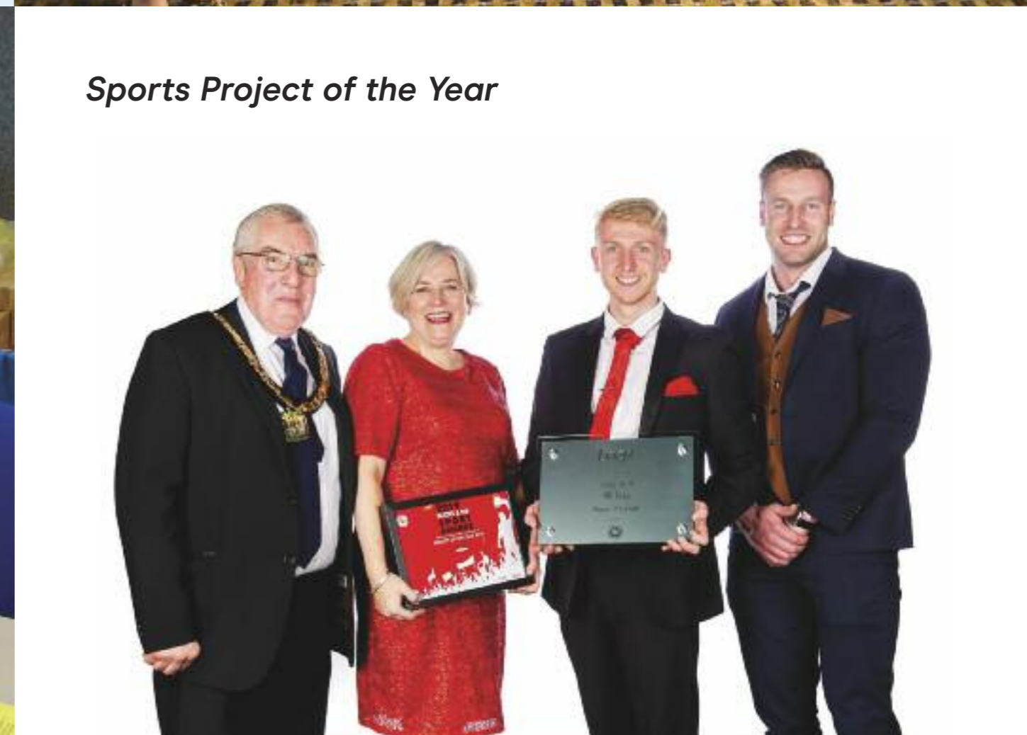
Sports Project of the Year