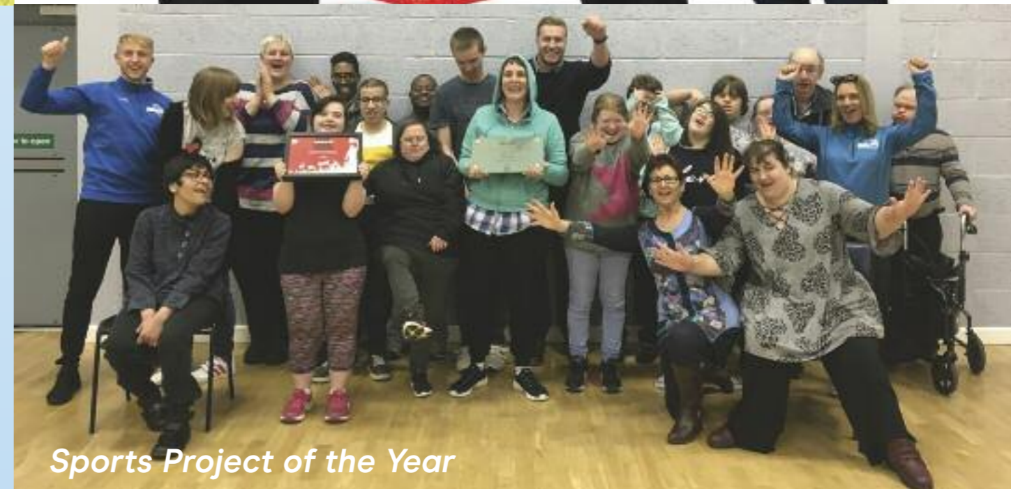
Sports Project of the Year