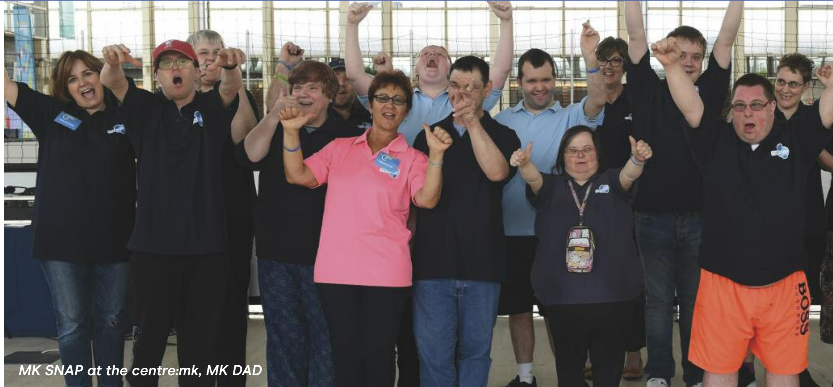
MK SNAP at the centre:mk, MK DAD

...what can your business do to help our neurodivergent community be included?