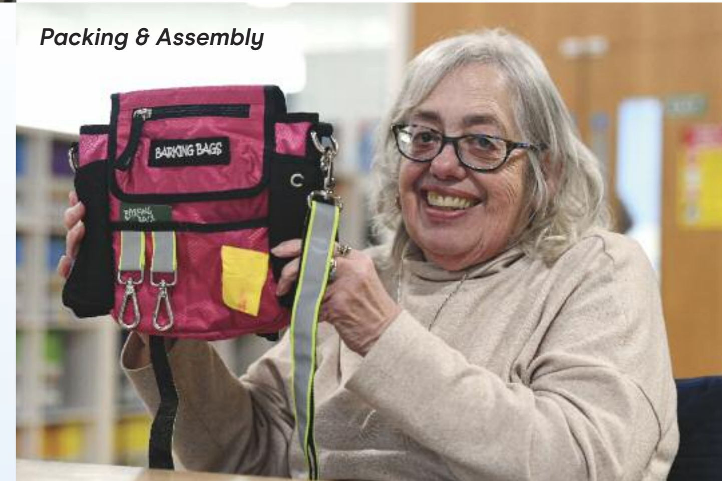
Packing & Assembly

We have an online shop and will continue to use adaptive technology to empower the lives of our learners.