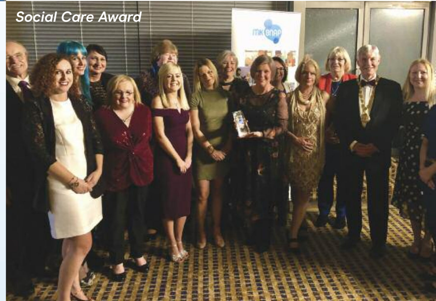
Social Care Award