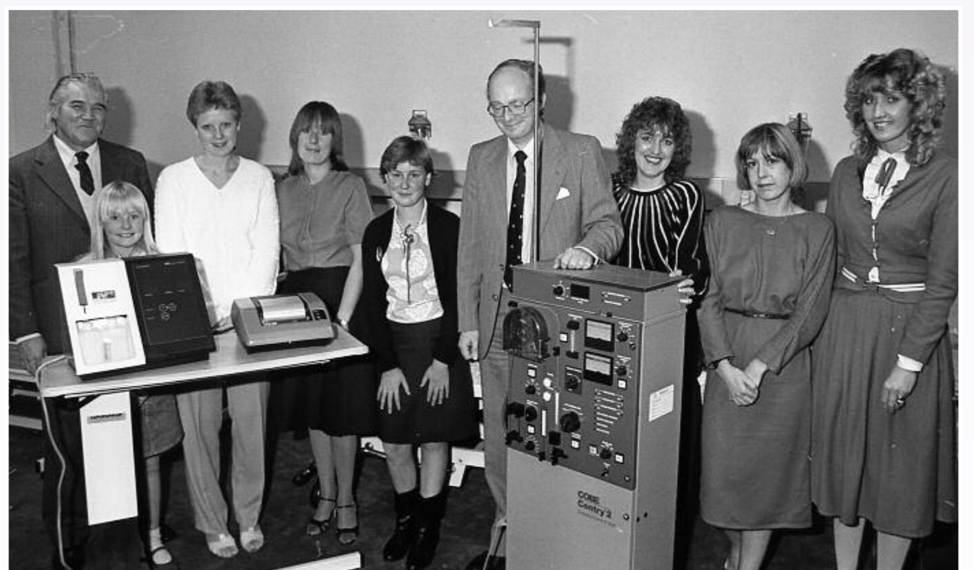
New state-of-the-art equipment, 1984