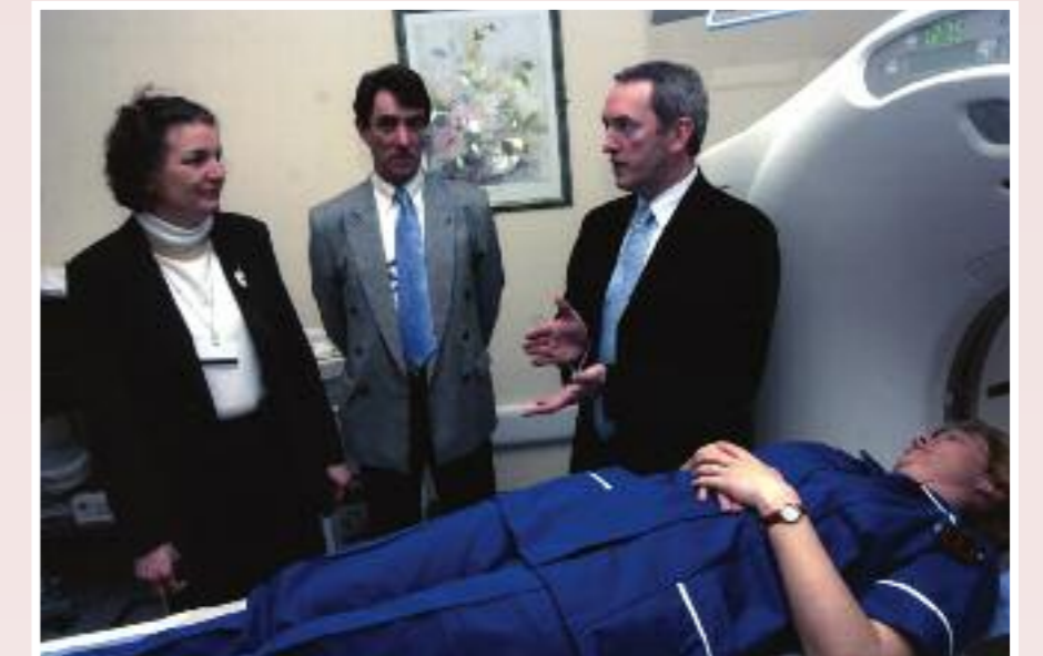
A demonstration of a new CT scanner, 2001