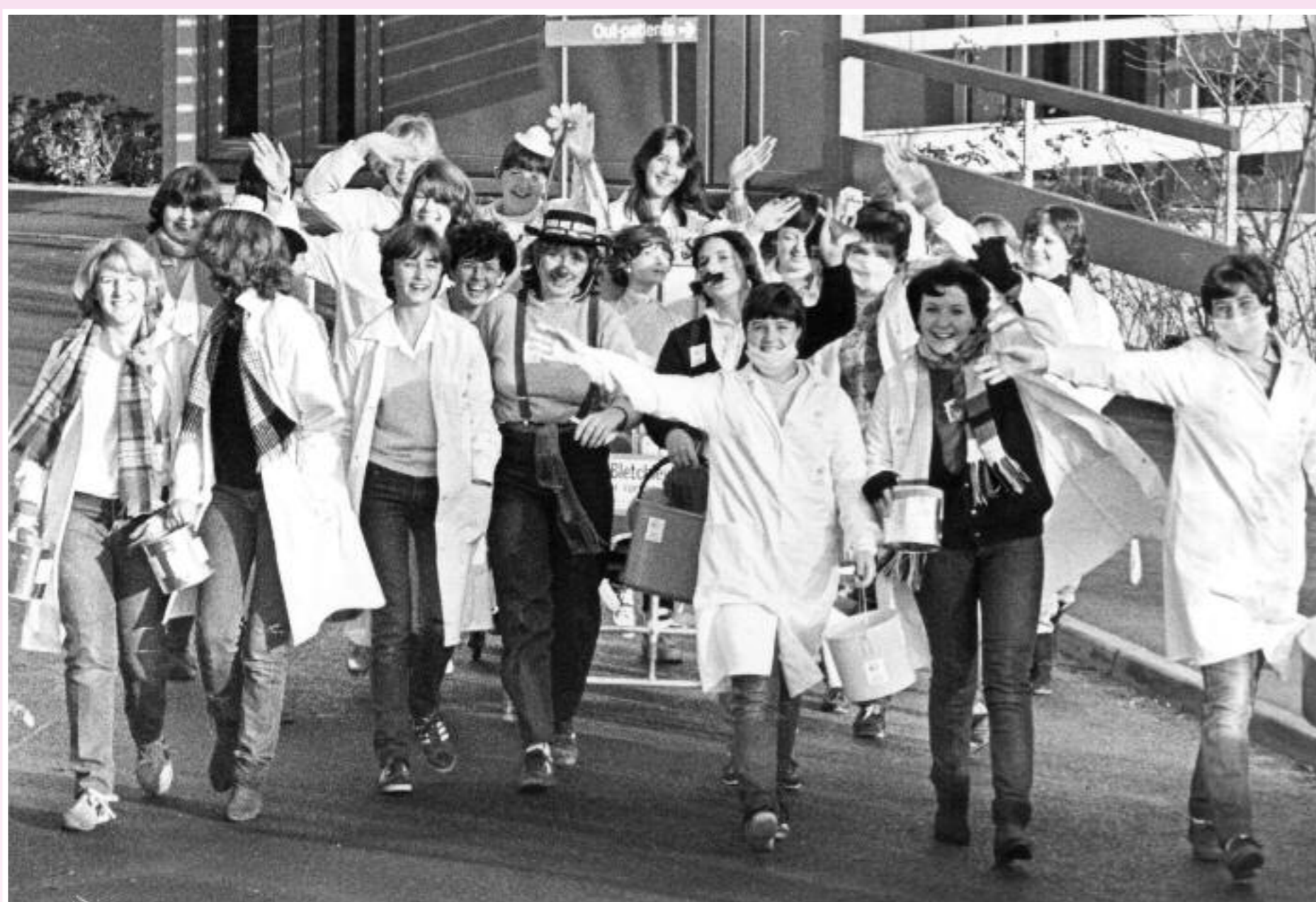
Buy-a-Bed collection walk leaves Eaglestone Community Hospital for Bletchley