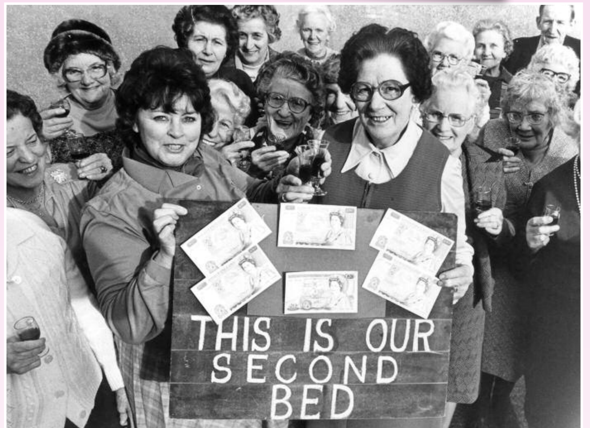
The Tuesday Club celebrates raising funds for their second hospital bed