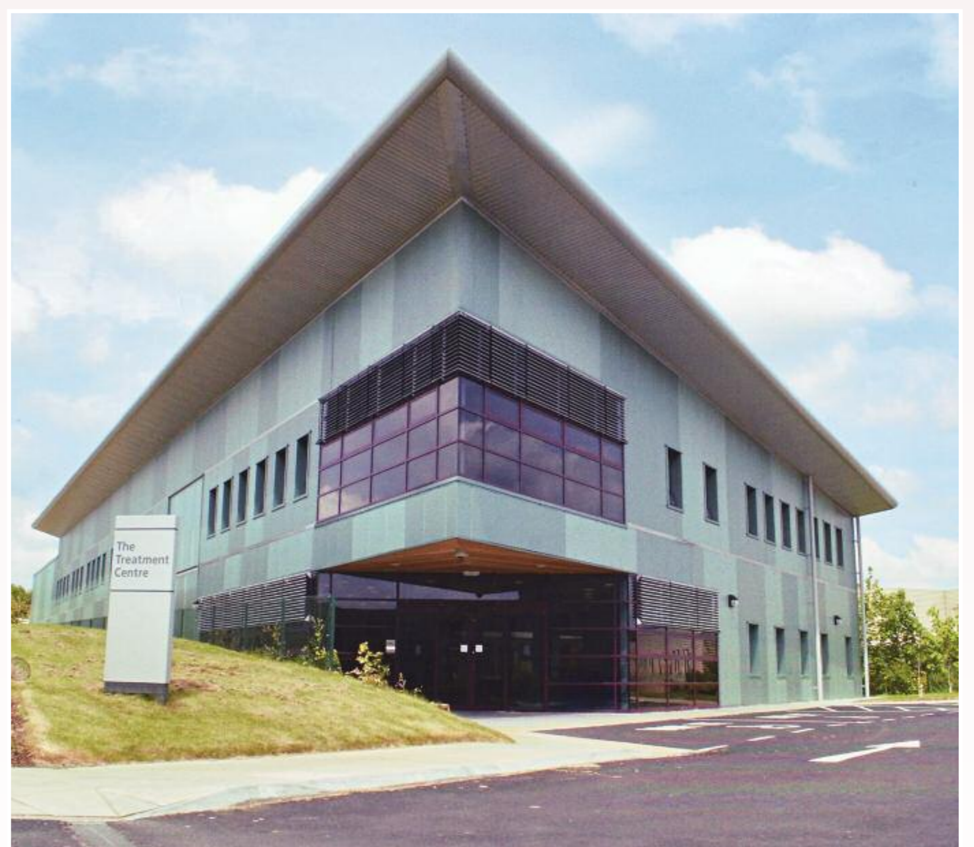
The new Treatment Centre, 2005