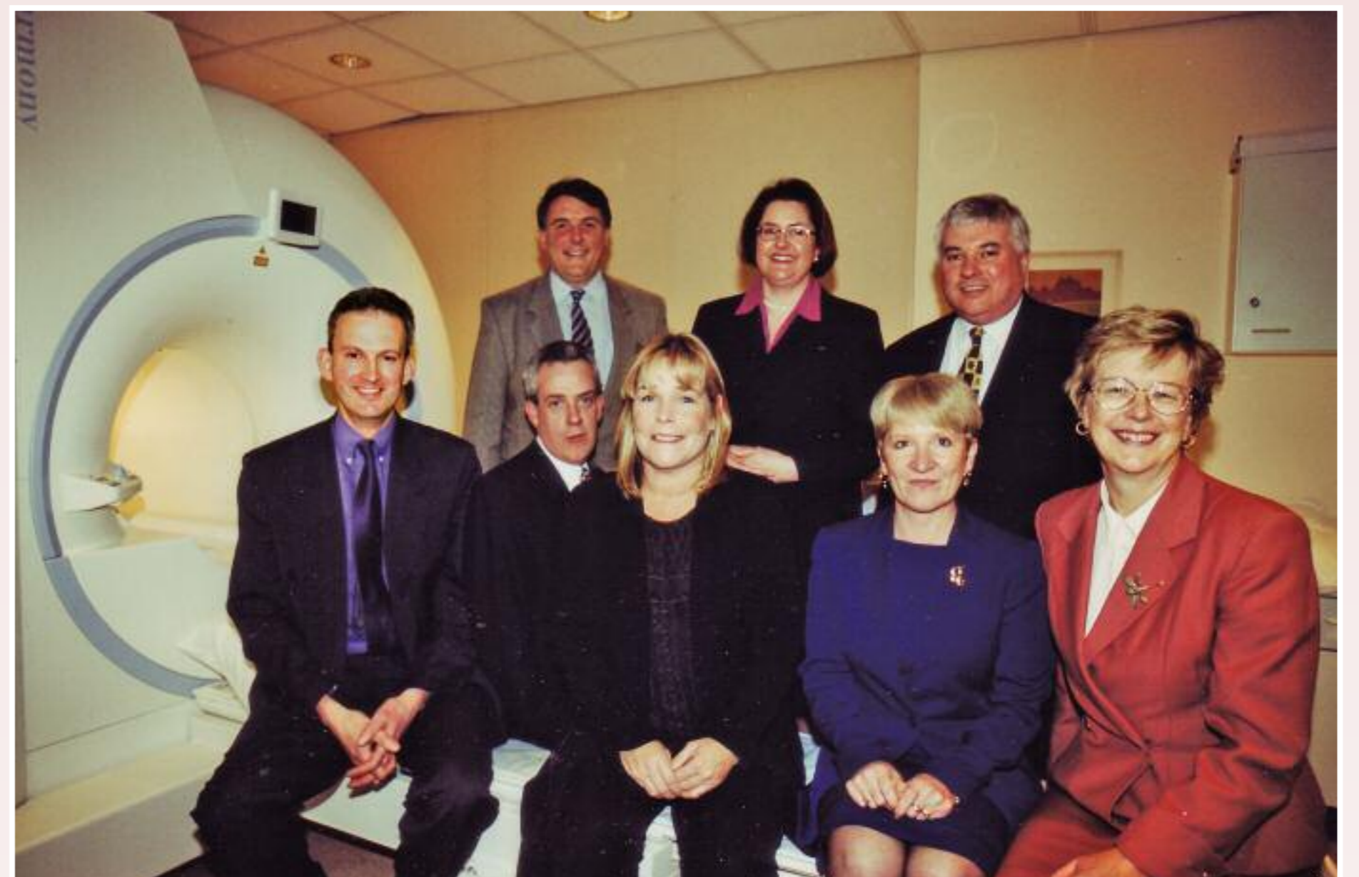
Actress Linda Robson officially opens the new MRI Unit, 2000