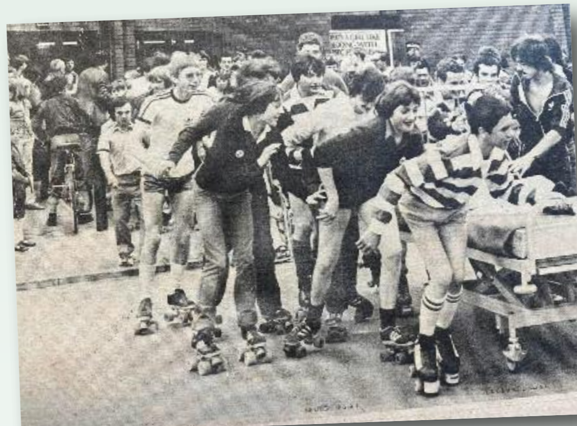
Agora roller skaters for the 'Buy-a-Bed' appeal, 1981