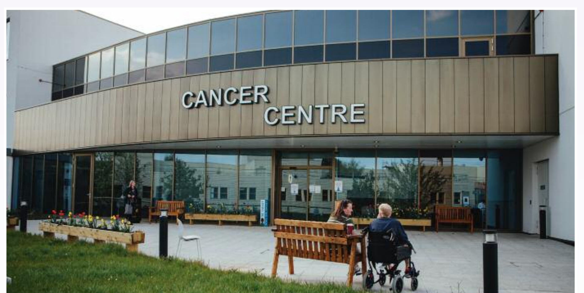
MKUH Cancer Centre