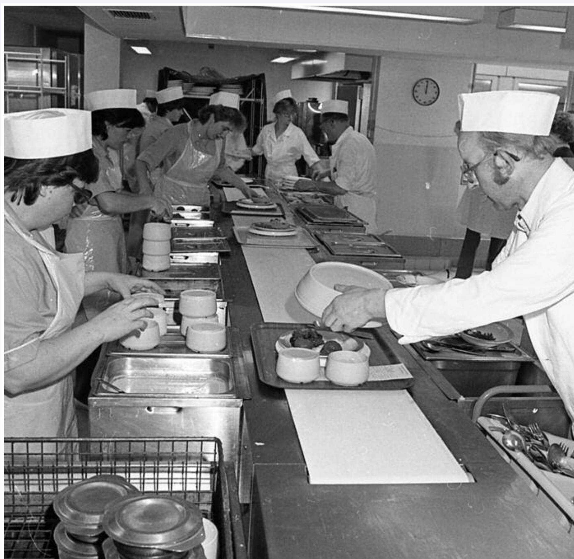
Preparing meals in the hospital kitchen, 1984