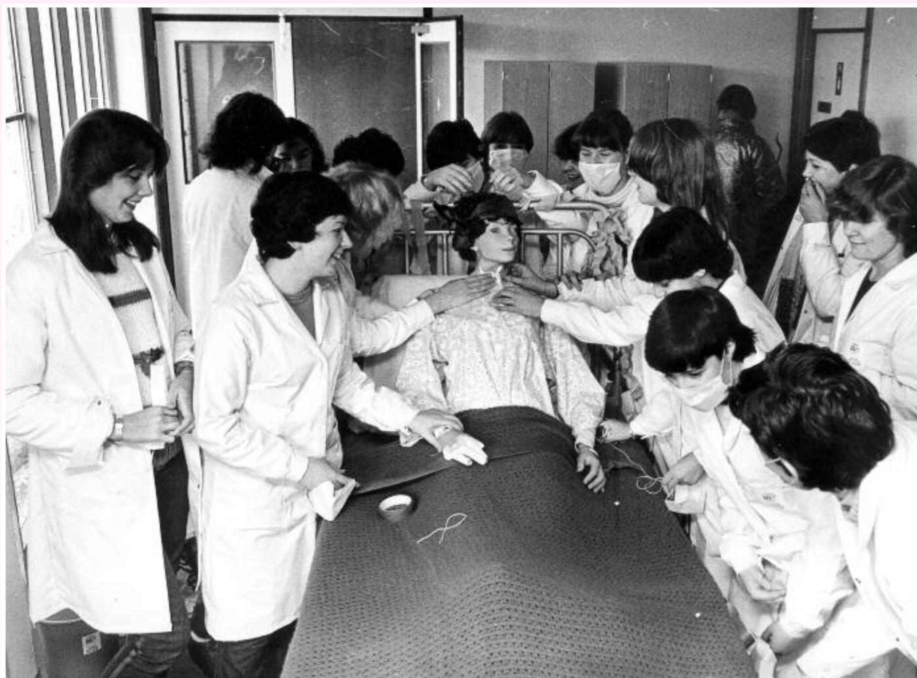
Competitors preparing for the 'Bed Push' at Eaglestone Health Centre, 1981