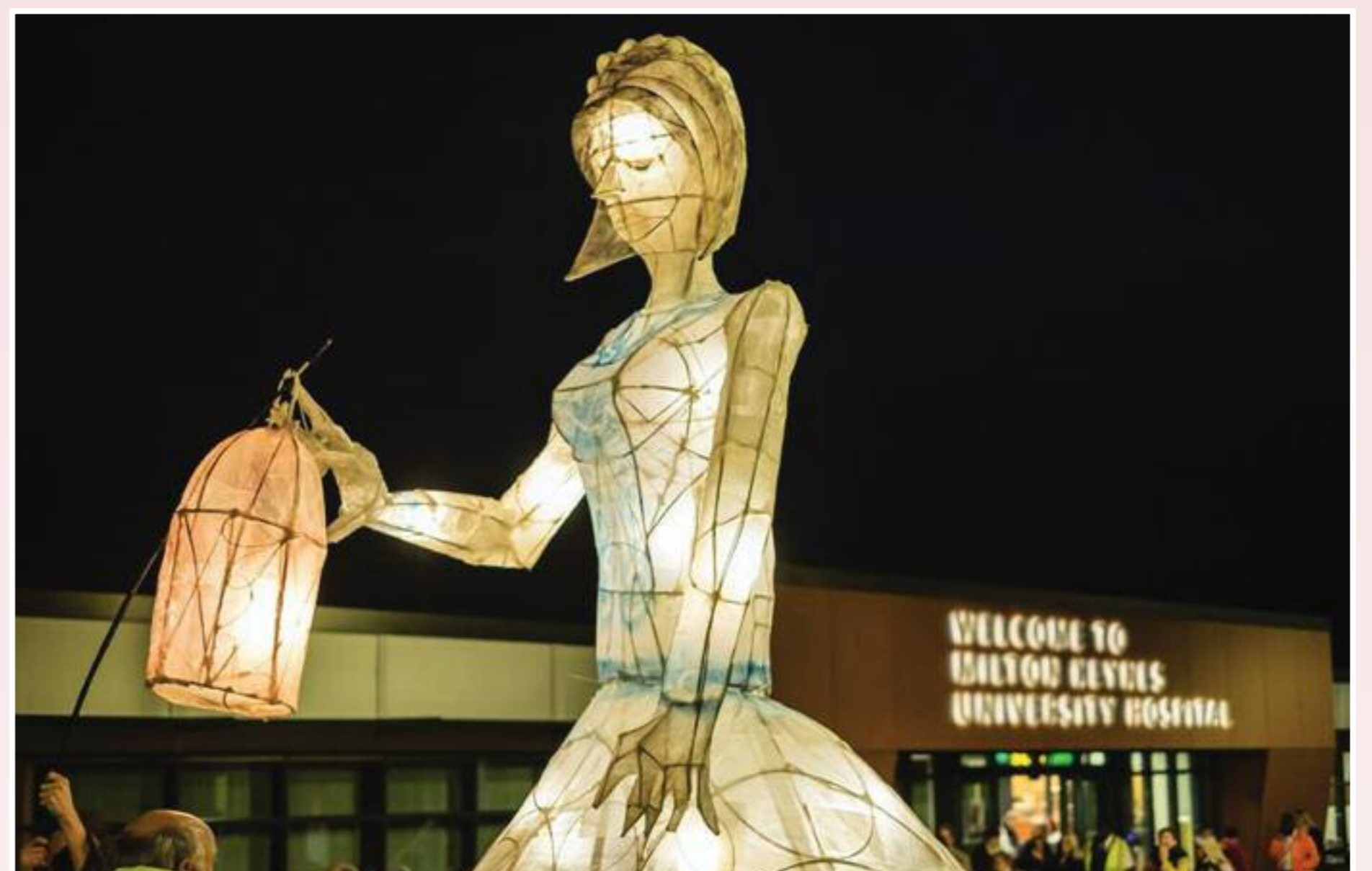
Giant Florence Nightingale puppet parade to MKUH (2018) Look Around You project