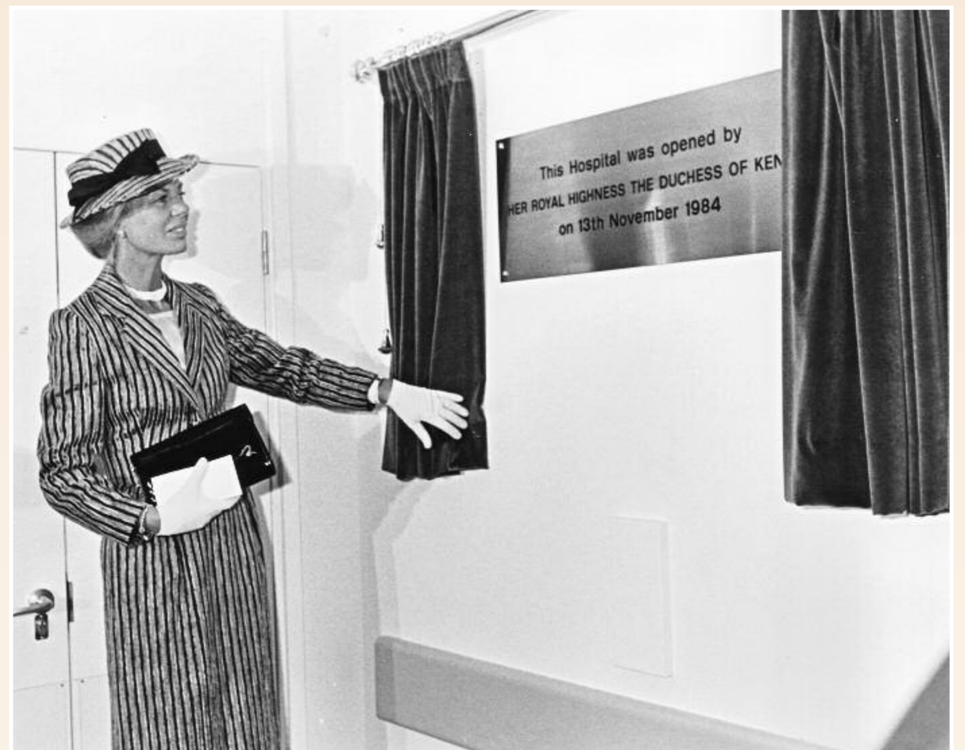
HRH The Duchess of Kent at the Royal opening, 13 November 1984

When the hospital first opened around 1,000 staff were employed by the hospital. In 2009 an army of over 3,000 staff and 500 volunteers delivered care to patients.