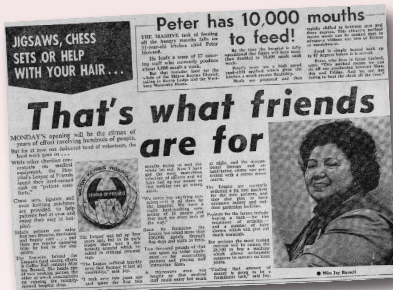
Milton Keynes Gazette article, 1984

The Friends have always had a shop in the hospital starting with a small tuck shop in 1984 and then a much larger shop which opened in 1990. In 2015 the MK Friends shop moved to the centre of the hospital next to Eaglestone restaurant. The shop is open 7 days a week with a wide range of items from toiletries, confectionery, groceries, newspapers and magazines and fresh food. We prepare hot and cold food from our kitchen.