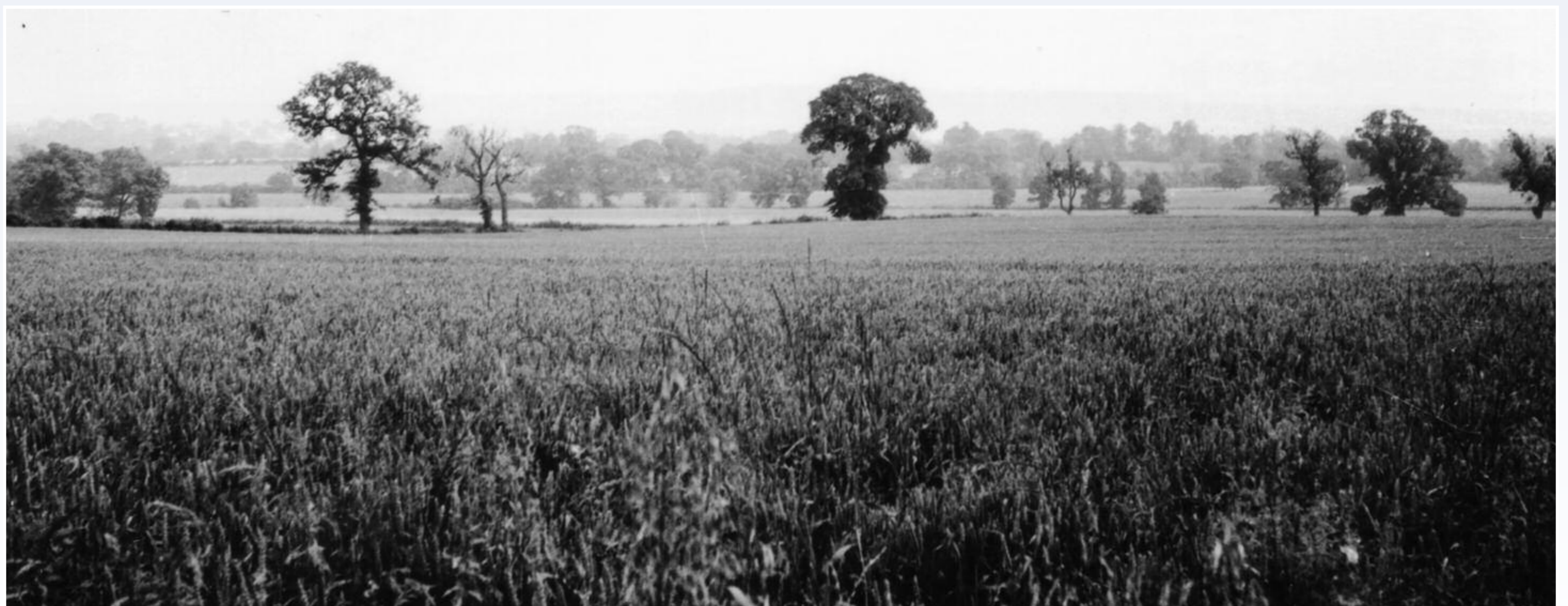
The proposed site of the hospital in 1971