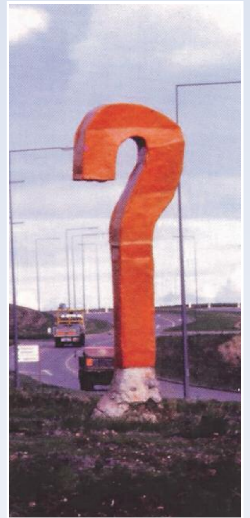
The concrete question mark erected on the site as part of the 'Milton Keynes is Dying for a Hospital' campaign, 1977