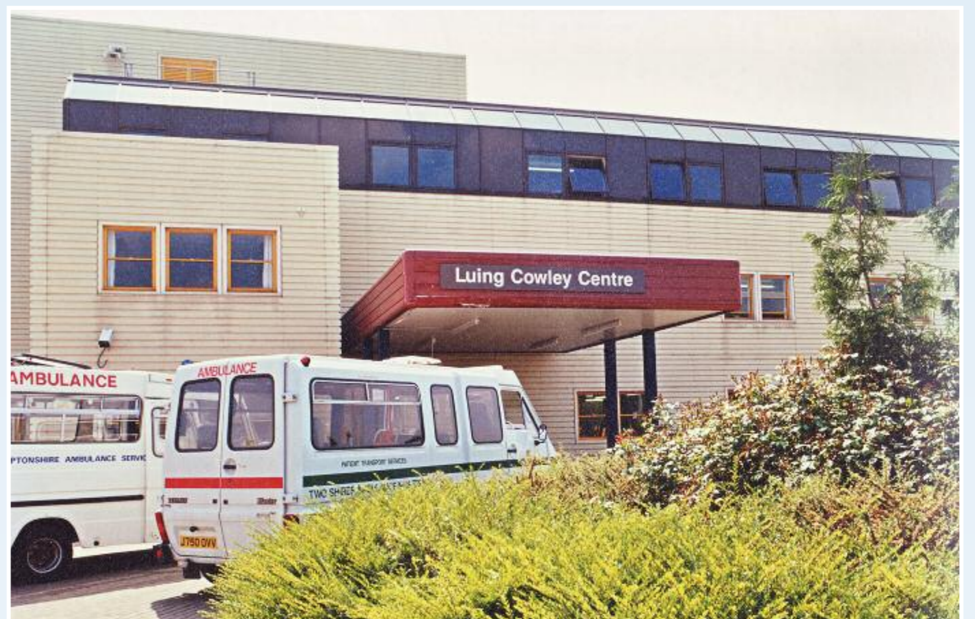
The new Luing Cowley Centre, 1990