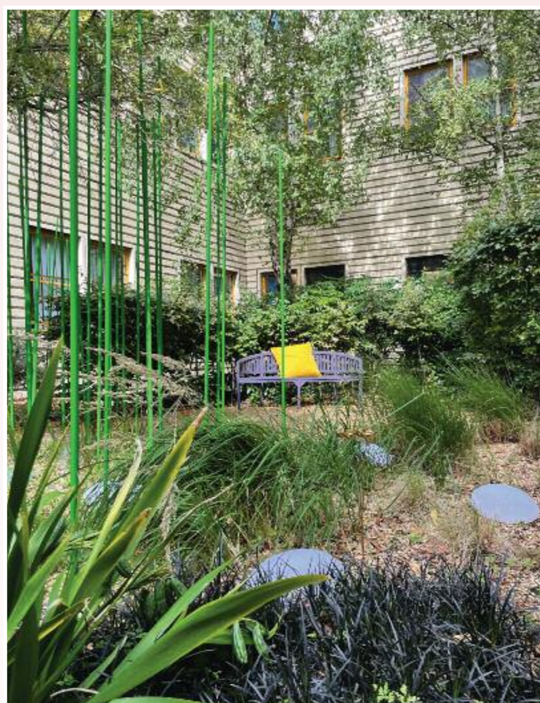
The Sensory Garden at MKUH

Using The Collection as inspiration, a huge proportion of the charity's work annually involves the commissioning of professional arts practitioners to deliver a wide range of creative workshops designed to improve the health and wellbeing of people in Milton Keynes.