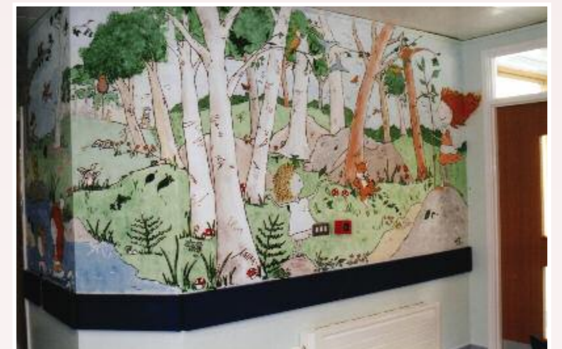
Milton Mouse Children's Unit