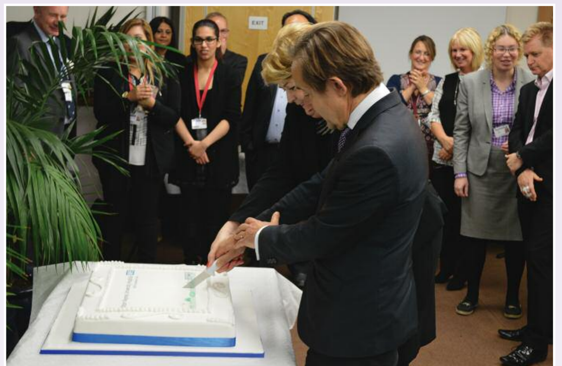
University name change (l-r): The late Baroness Margaret Wall (former Chair of MKUH), Sir Anthony Seldon