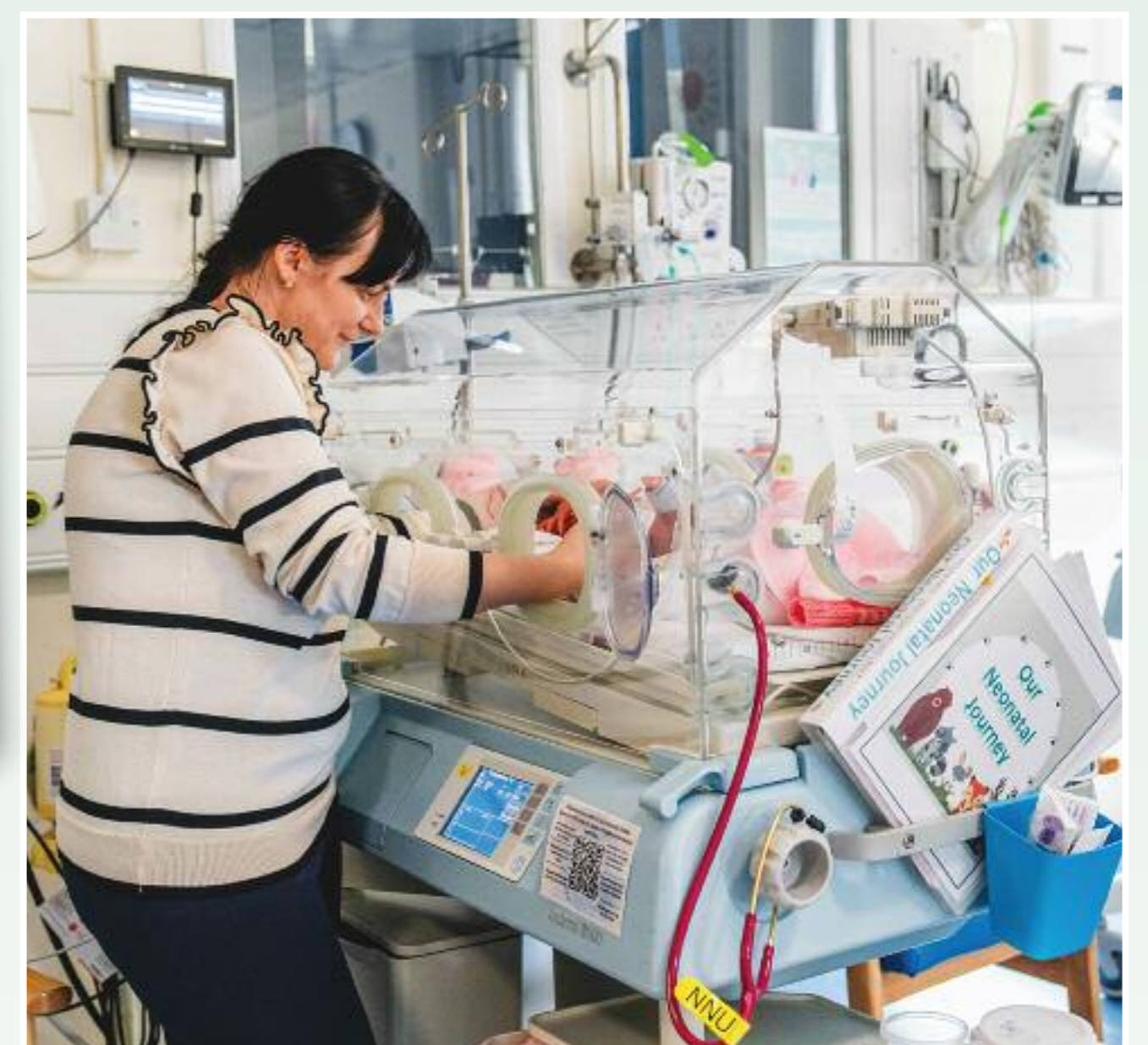
Parent and Neonatal Unit: a baby in a BabyLeo incubator, funded by the charity