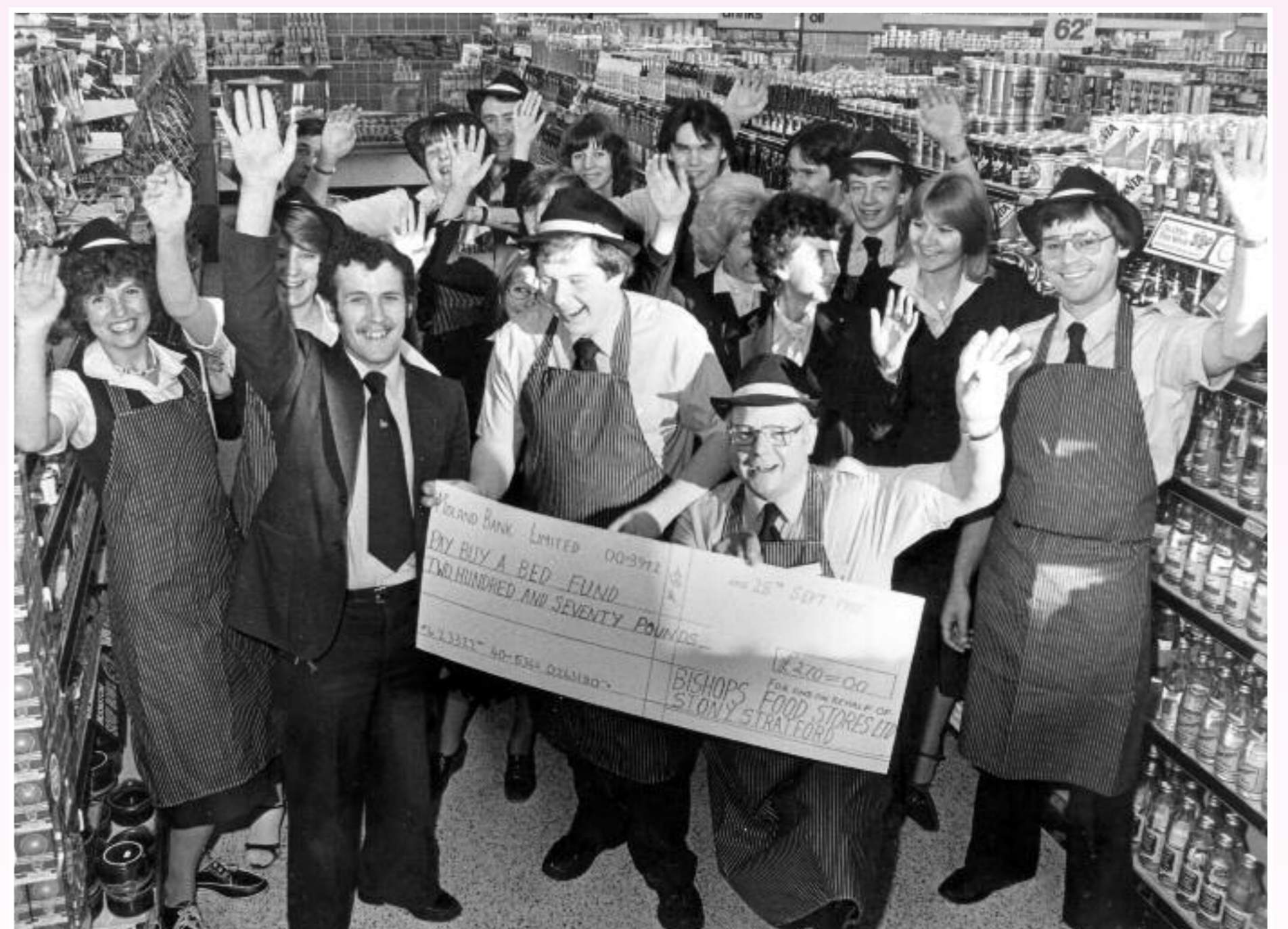
Bishops Food Stores presents a cheque to the Buy-a-Bed Fund, 1981