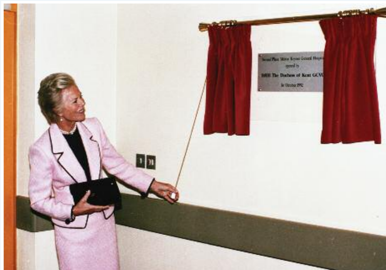
HRH the Duchess of Kent officially opens Phase II, 1992

October 1992: Phase II was officially opened by HRH the Duchess of Kent. The development contained six additional 28-bed wards, a further four operating theatres, extra accommodation for the Pathology Department and for stores, staff, offices and meeting rooms.