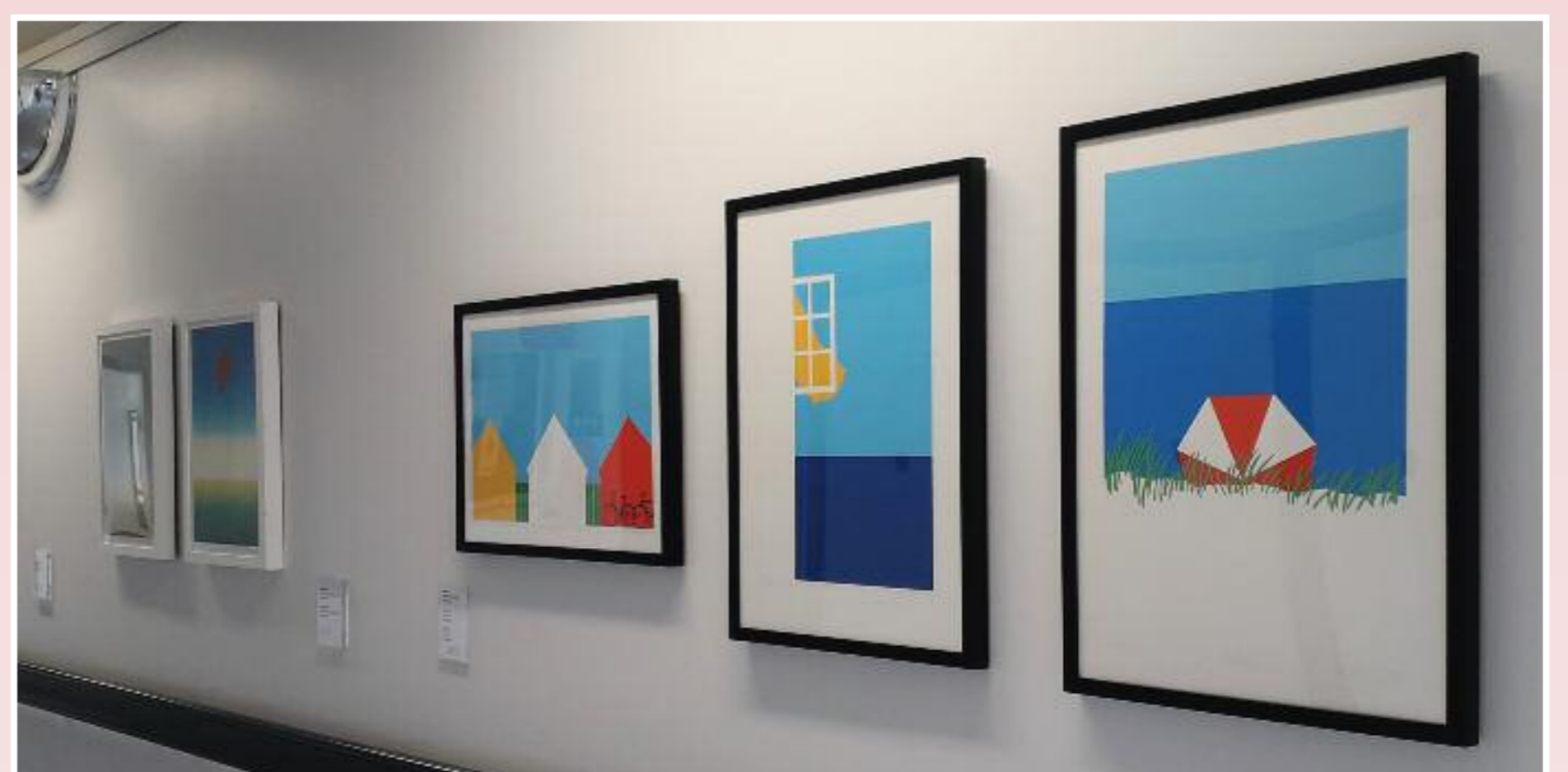
Installation view of Look Around you Exhibition (Credit: Arts for Health MK: featuring l-r. Three Girls, Apartment Window and Solstice; screenprints by W. King from The MKUH Collection )

Visit: www.artsforhealthmk.org.uk to find out more.