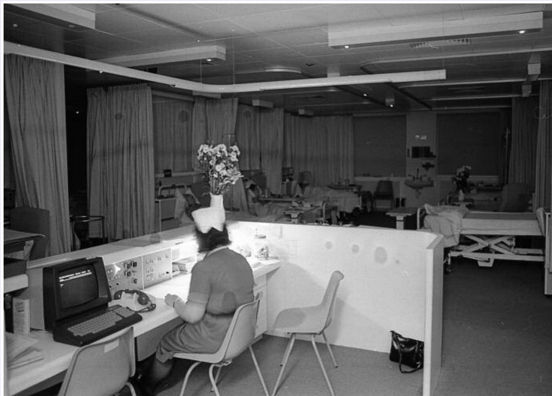
Nurses station, 1984