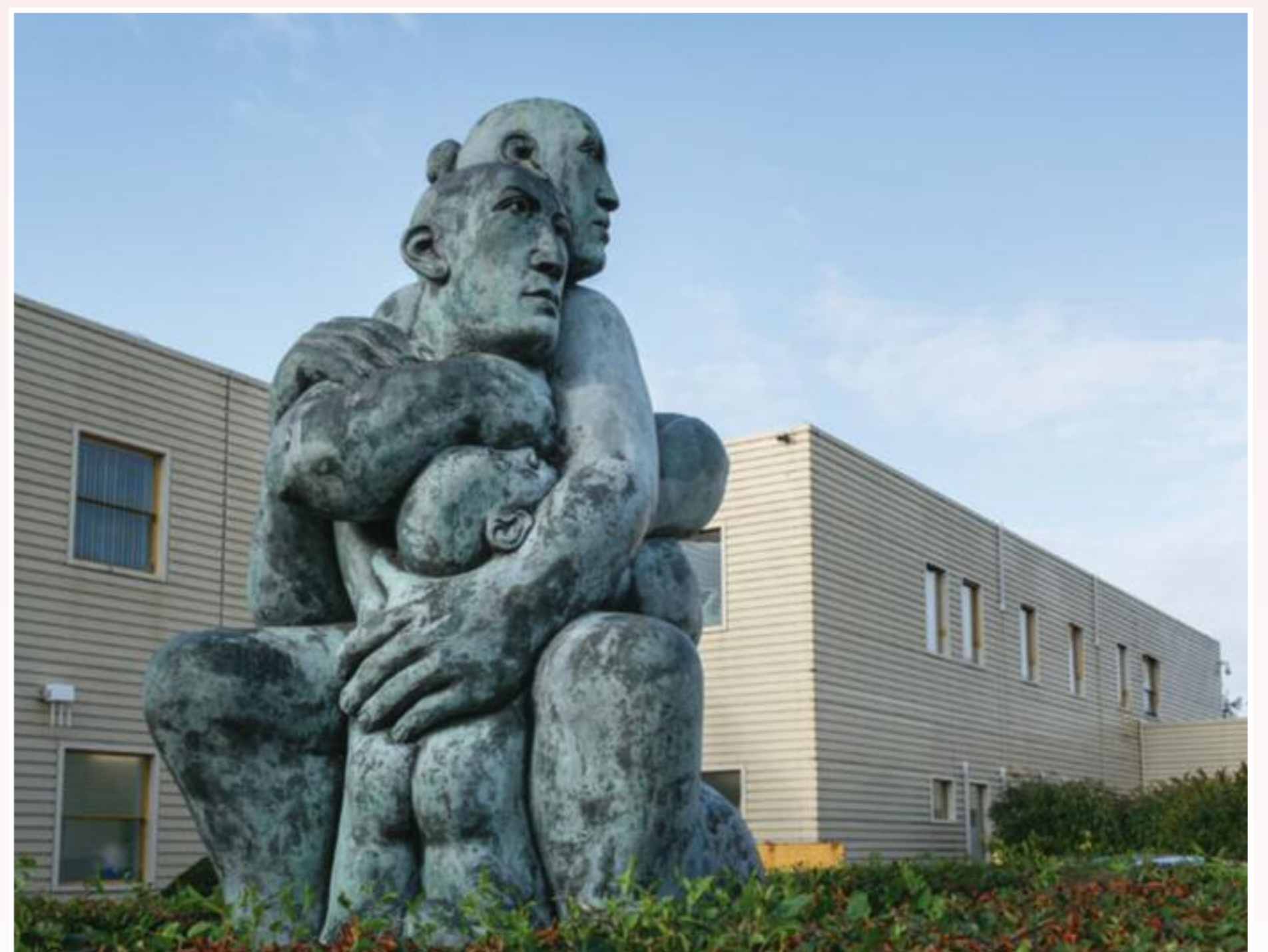
Jon Buck, The Monumental Family, (1996) cast in bronze at the Pangolin Foundry and exhibited at Sculpture 2000 [at MKUH] (Credit: Jon Buck, The Monumental Family, (1996) from The MKUH Collection)