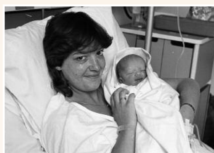
The first baby born at the new hospital, 8 May 1984