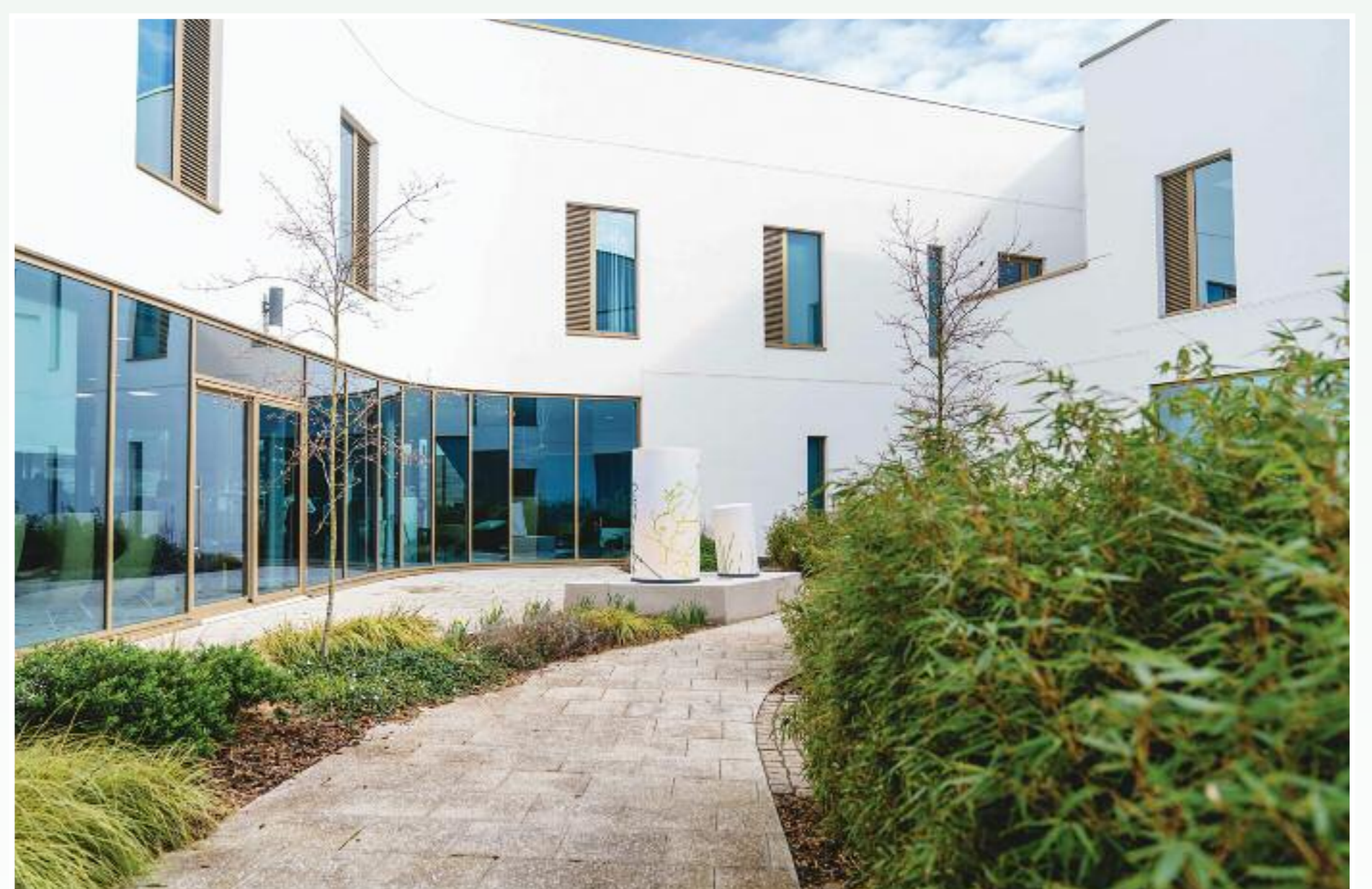
The central courtyard at the MKUH Cancer Centre, funded and maintained by the charity