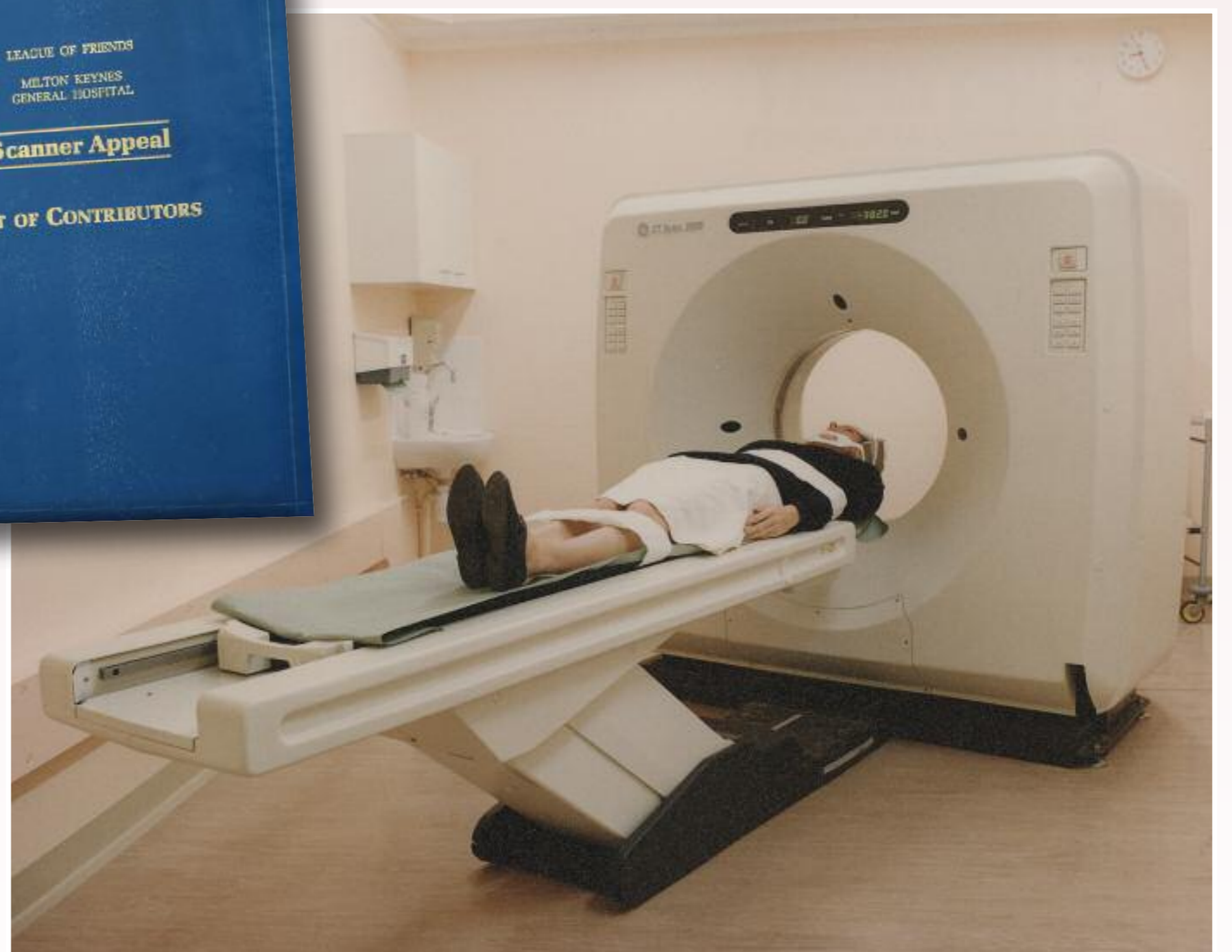
CT scanner, 1988