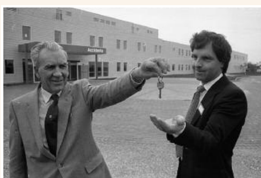
Handing over the keys to the new hospital, 29 August 1983