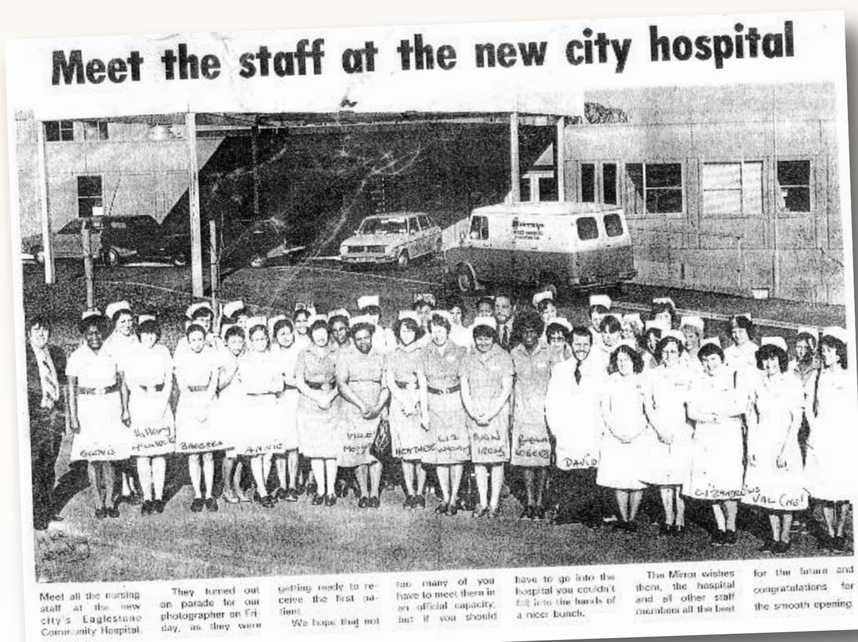
Staff at the opening of Eaglestone Community Hospital, 1979