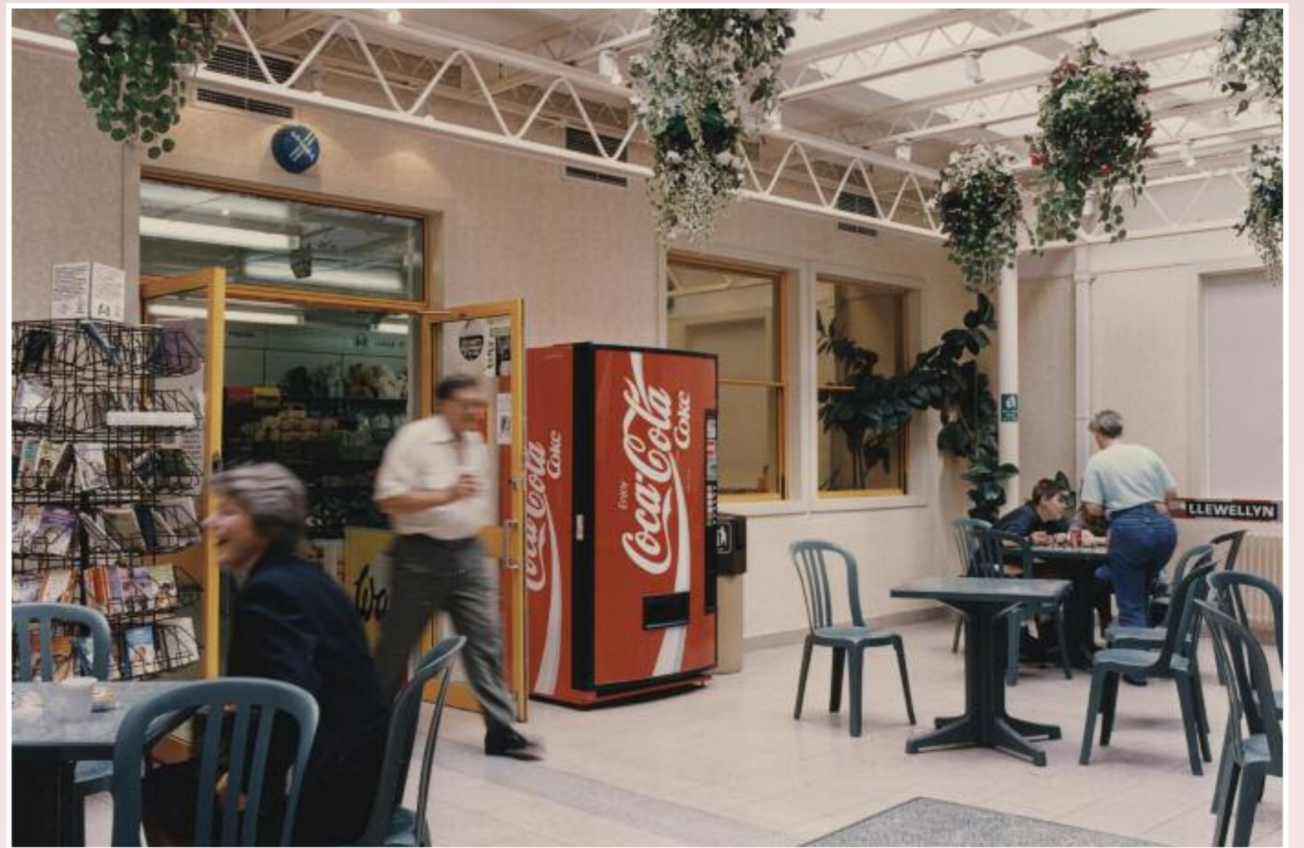
Friends shop, 1994

The Friends have always had a shop in the hospital starting with a small tuck shop in 1984 and then a much larger shop which opened in 1990. In 2015 the MK Friends shop moved to the centre of the hospital next to Eaglestone restaurant. The shop is open 7 days a week with a wide range of items from toiletries, confectionery, groceries, newspapers and magazines and fresh food. We prepare hot and cold food from our kitchen.