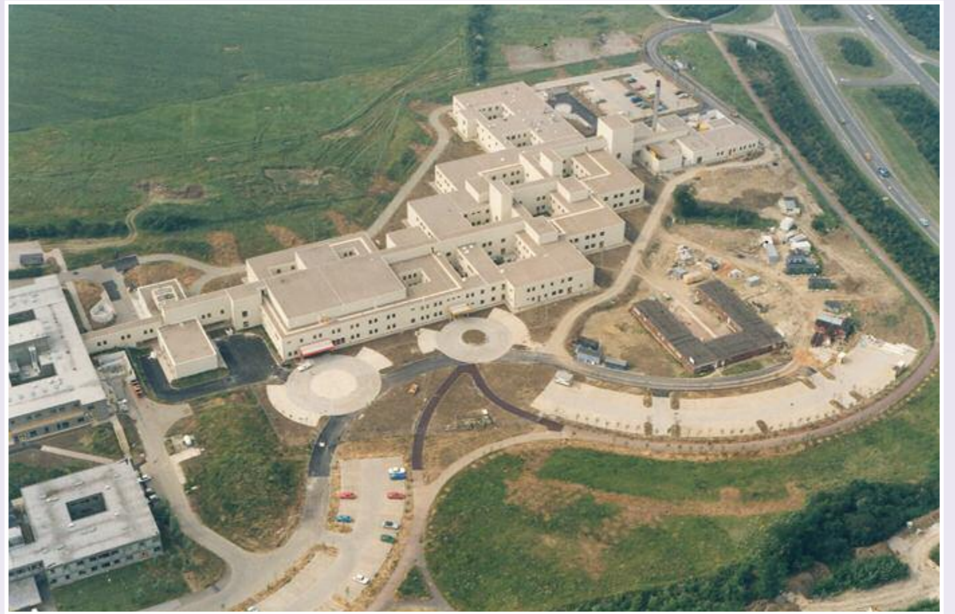
Aerial view of the hospital, phase 1