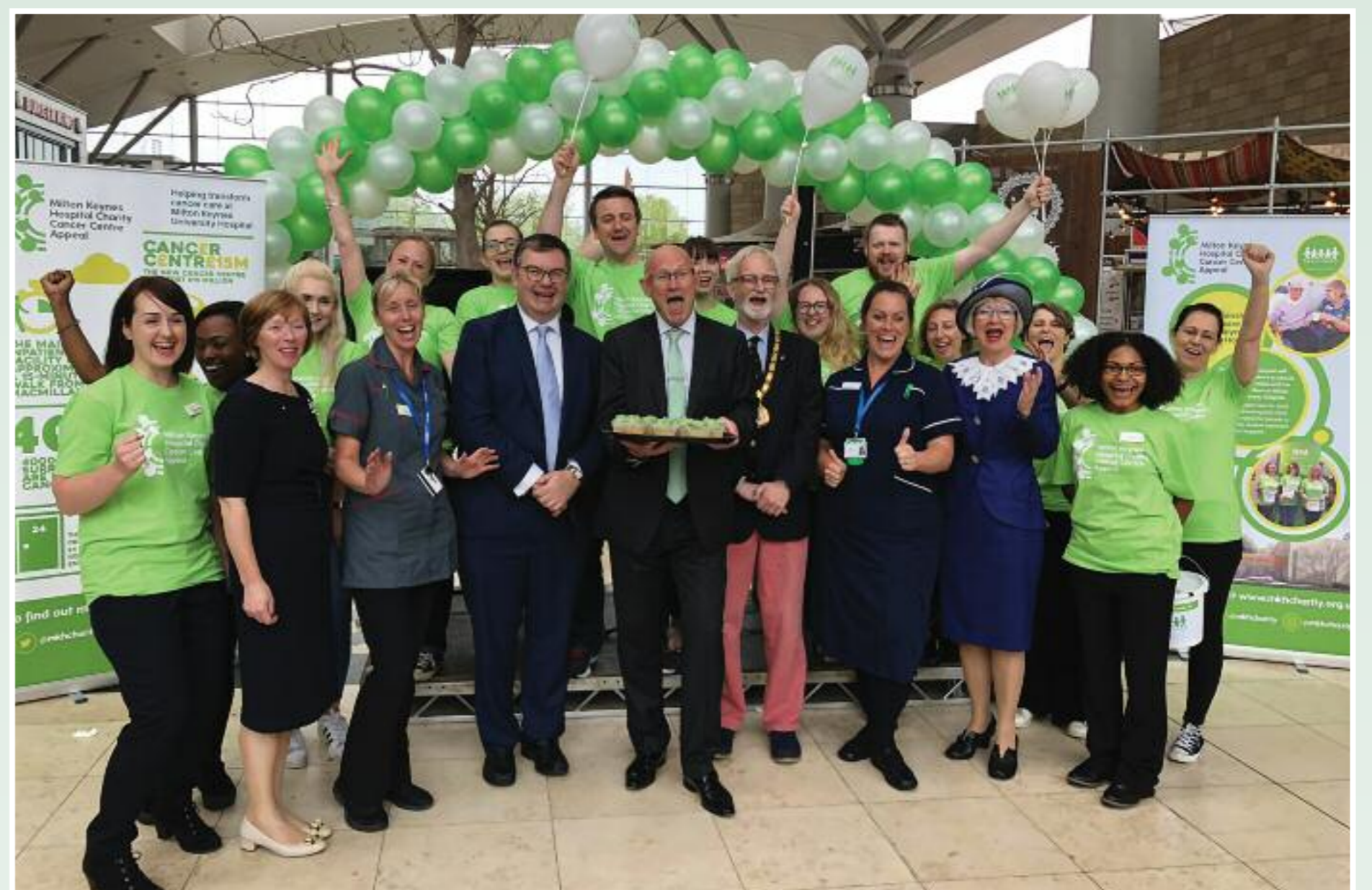
The charity's cancer centre appeal, publicly launched in 2018

Join us in making a difference at MKUH! Email us fundraising@mkuh.nhs.uk or visit our website mkhcharity.org.uk