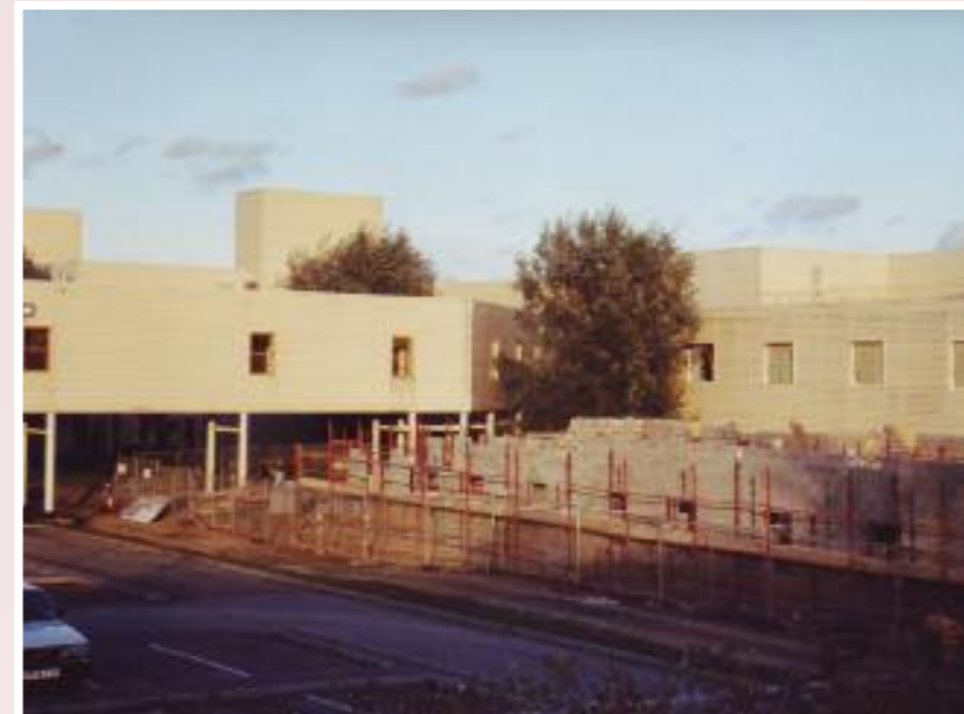
The MRI Unit under construction, 1998

2009: A new building housing a state-of-the-art Endoscopy Unit and new 28-bed ward (Ward 22) opened.