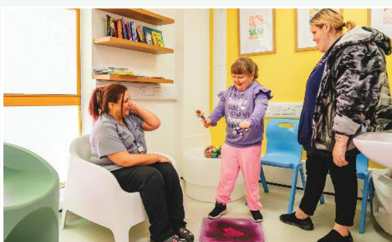
Staff member and family in the charity-funded Sensory Room in Children's A&E