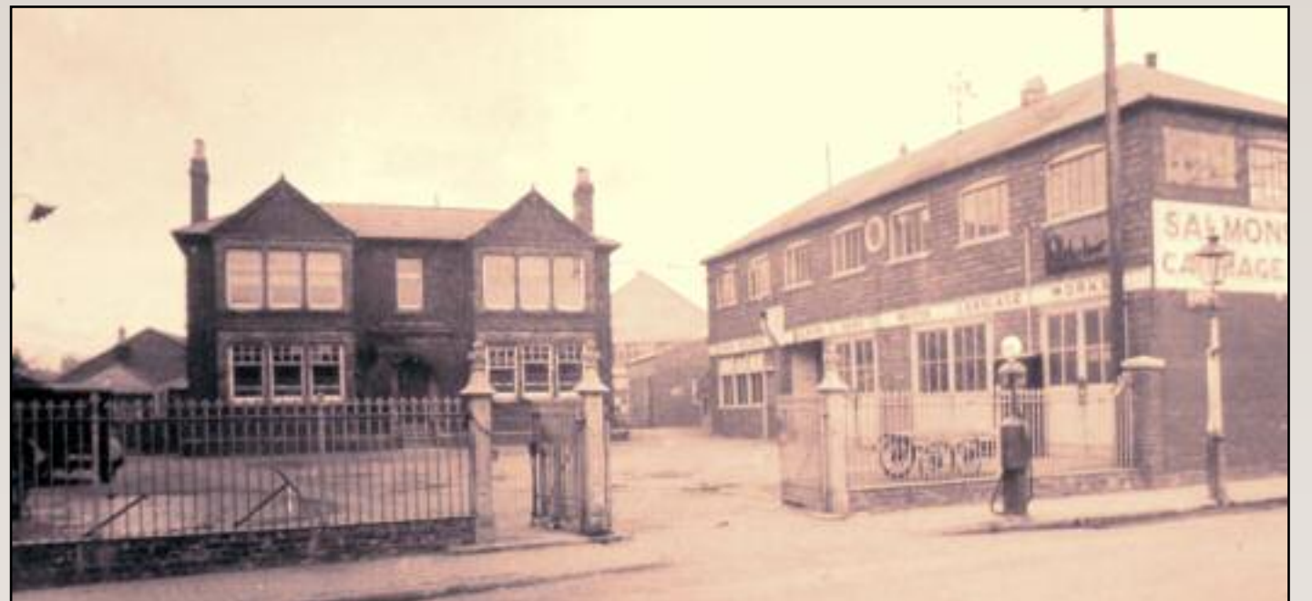
Salmons House and workshops