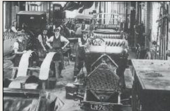
Body shop, 1910