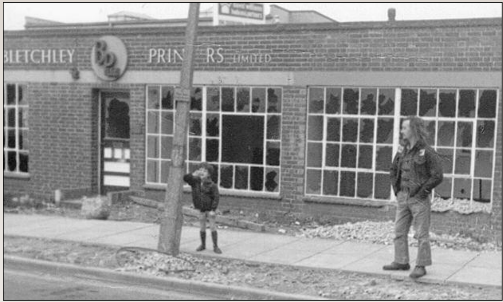
Bletchley Printers, 1972