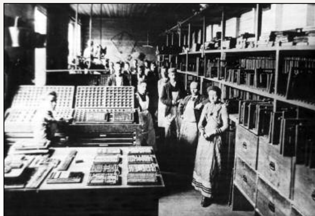
Staff in Composing Room at McCorquodales Printing Works, c1905