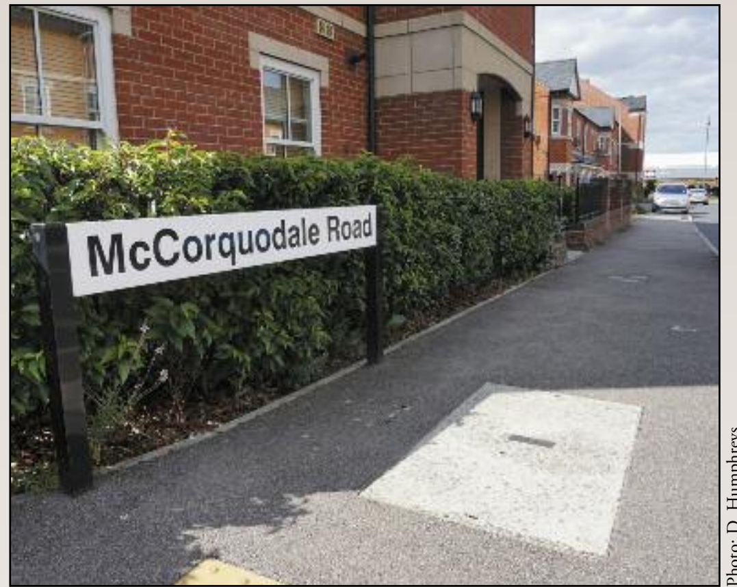
McCorquodale Road in Wolverton

George McCorquodale, who had been printing for the railway company since the 1840s, was approached with a view to establishing a stationery factory at Wolverton where the unmarried daughters of railway workers could be employed in a socially acceptable environment.