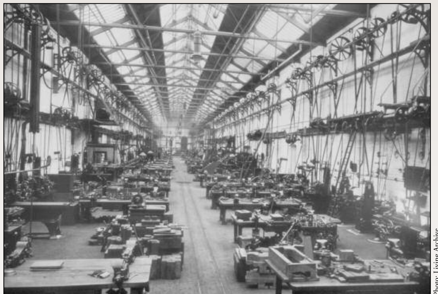
McCorquodales Printing Works interior

The McCorquodale printing company is now based in Derby.