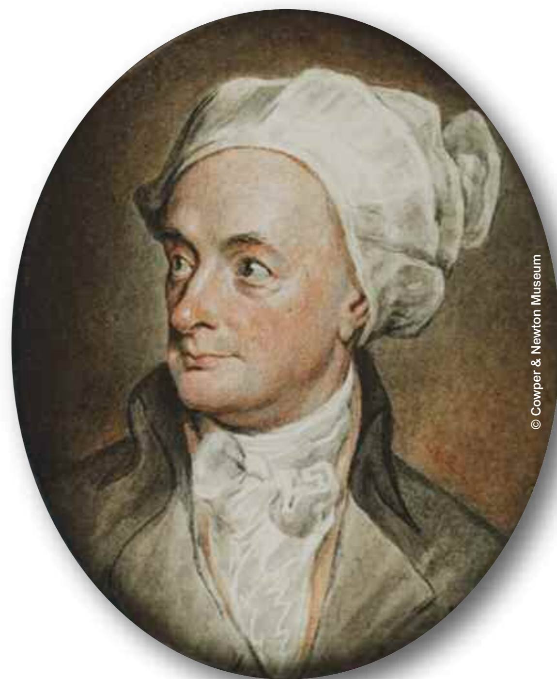
William Cowper, by William Blake (1801)