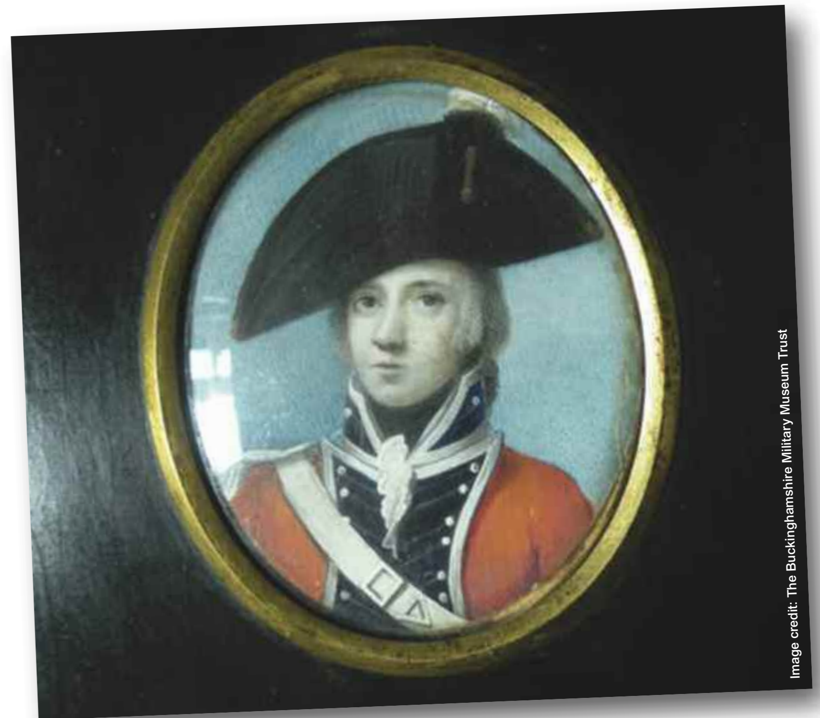
The Royal Bucks King's Own Militia Miniature of an Officer, 1807

By 1798 the country was worried about the Revolutionary Wars (1793-1802) over in France and wanted to be prepared if the French invaded. A military census called the Posse Comitatus was taken to find out who would be available to fight. The names and occupation of all able-bodied men between the ages of 15 and 60 who were not Quakers, clergymen or already serving in a military unit were recorded. Buckinghamshire is the only County for which all the records survive. (Bucks Record Society)