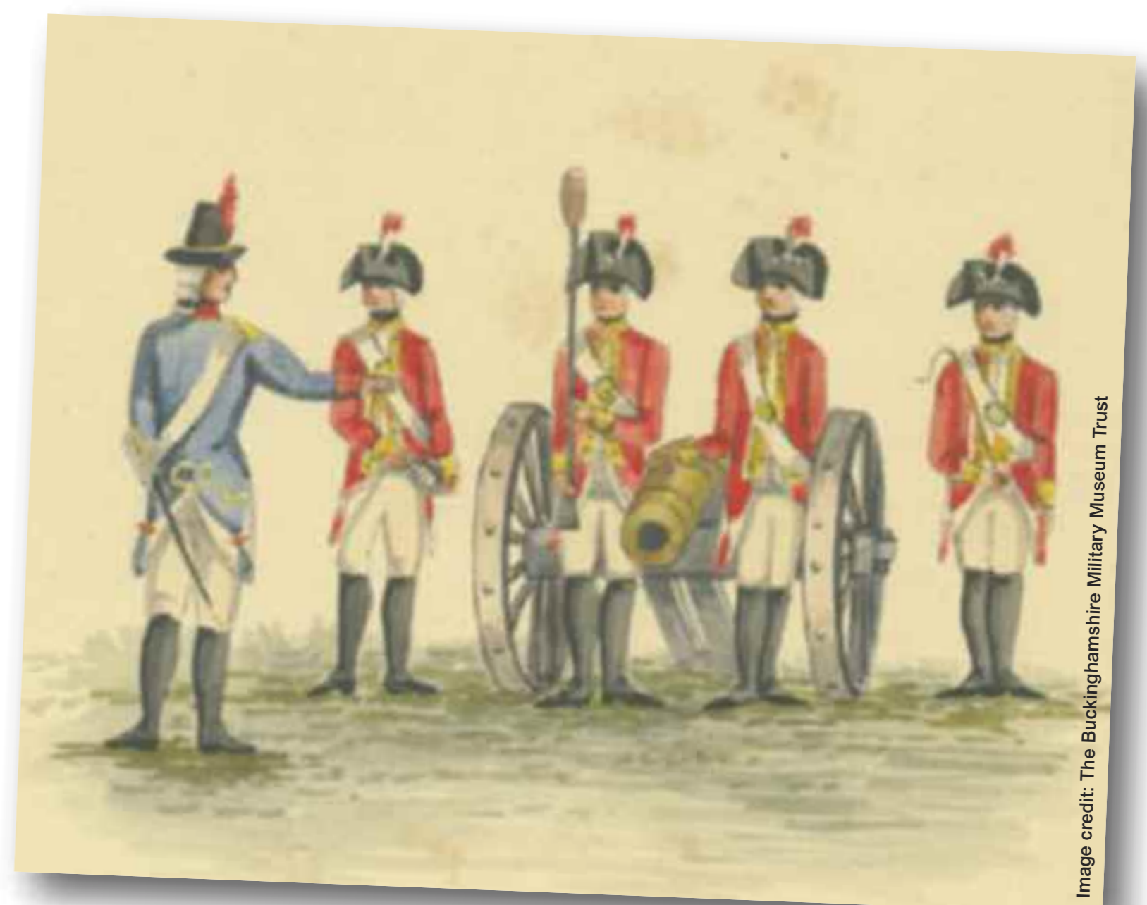
The Royal Bucks King's Own Militia Artillery Detachment, 1793

List of Olney occupations for Posse Comitatus (information from the Olney & District Historical Society website). Copies of the Posse Comitatus is available to view at the Centre for Buckinghamshire Studies and may also be available in the Local History section of your Library