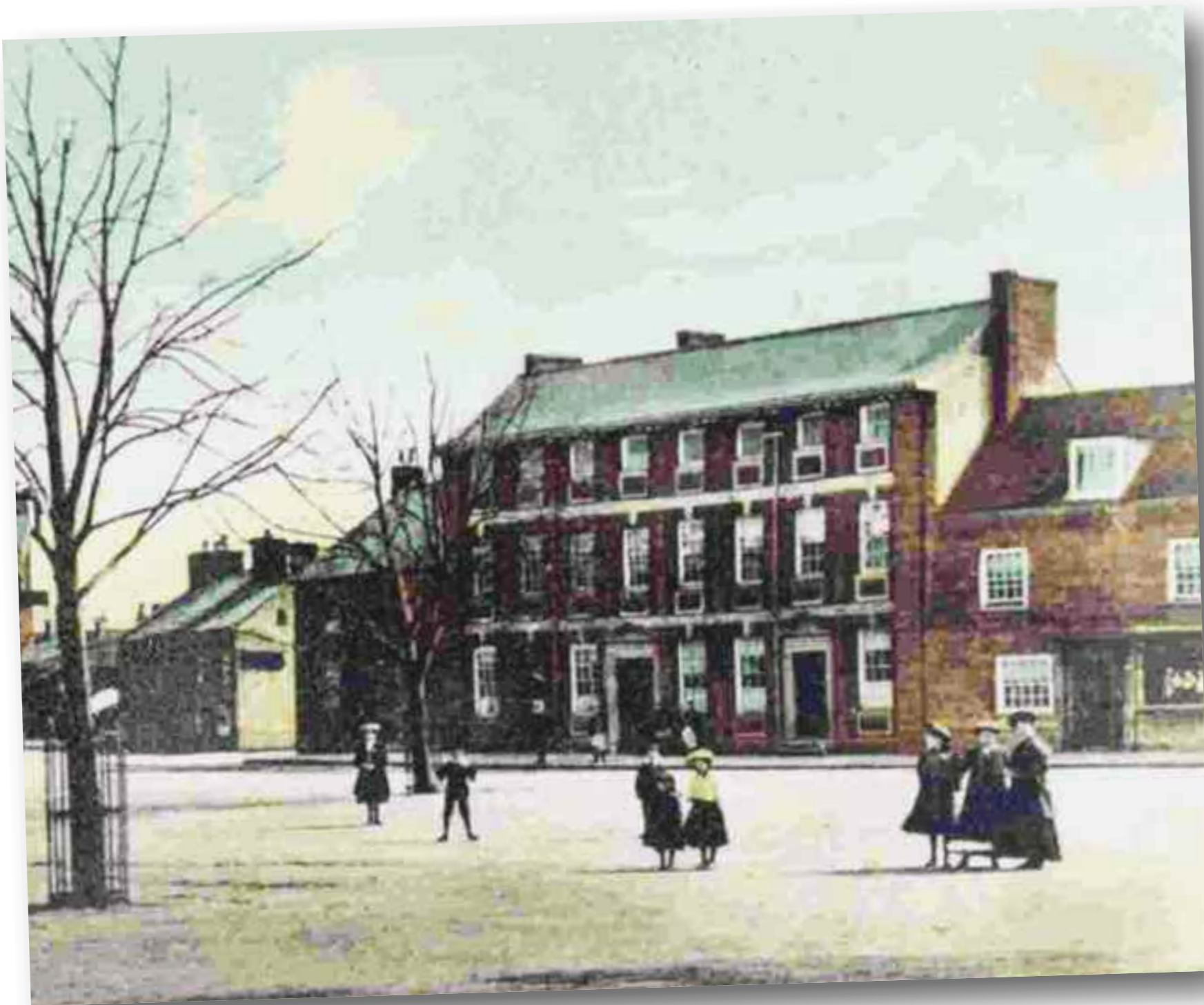
Hand-coloured photograph of the Cowper & Newton Museum around 1900

By 1822 some of the buildings had been demolished but this 1821 view by Storer still shows a building on the right hand side of the Market Place. This is probably the Shiel Hall used by Samuel Teedon as a school. In his diary entries for 1791 he is worried because he has been told that the building was to be pulled down. The next door blacksmiths was taken down in 1792 but the Shiel Hall survived a little longer.