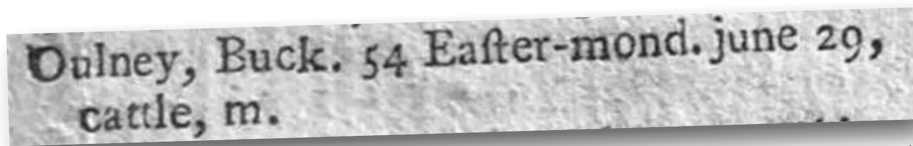
'Owen's New Book of Fairs', 1788