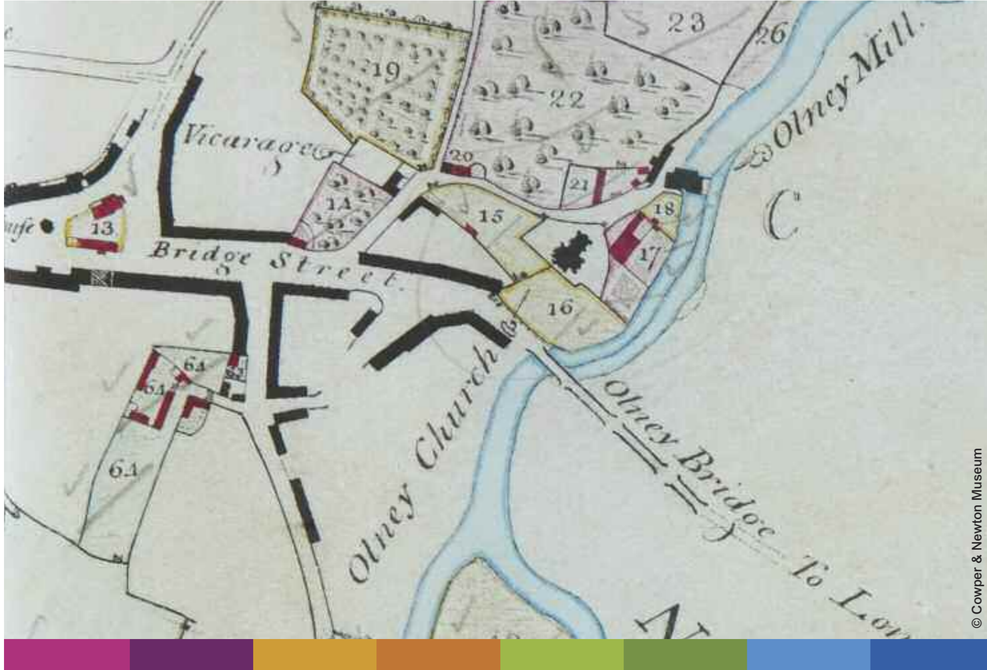
1796 survey of the land owned by William Legge, 2nd Earl of Dartmouth.