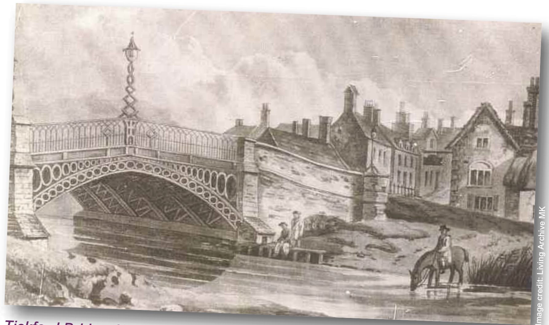
Tickford Bridge, Newport Pagnell