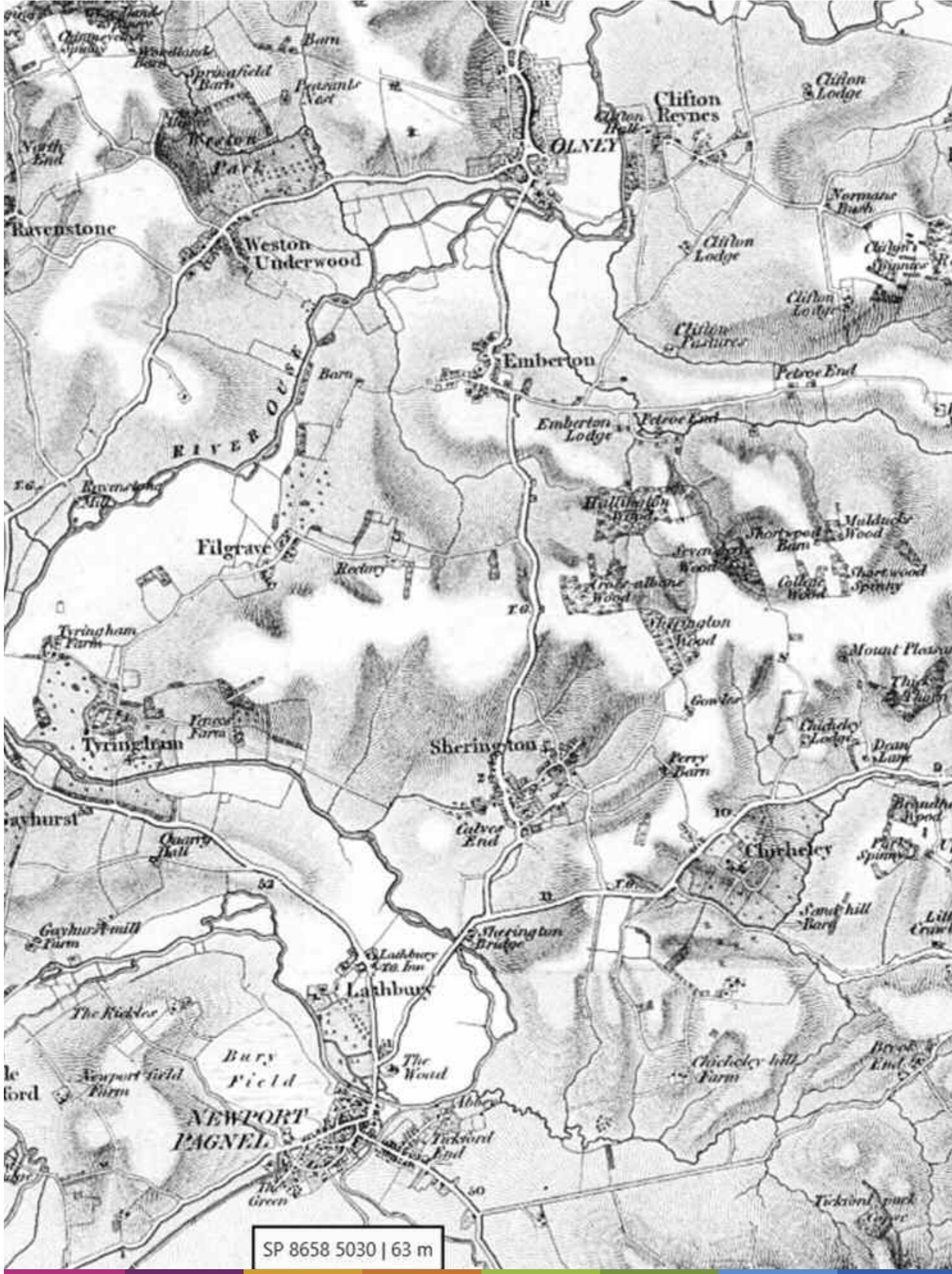
Ordnance Survey First Series 1:63360, 1835

'From Newport-Pagnell a turnpike road passes through Sherrington and Emberton to Olney; and thence, through Cold-Brayfield, towards Bedford. Another road, passing through Weston Underwood, connects Olney with the Northampton road.'