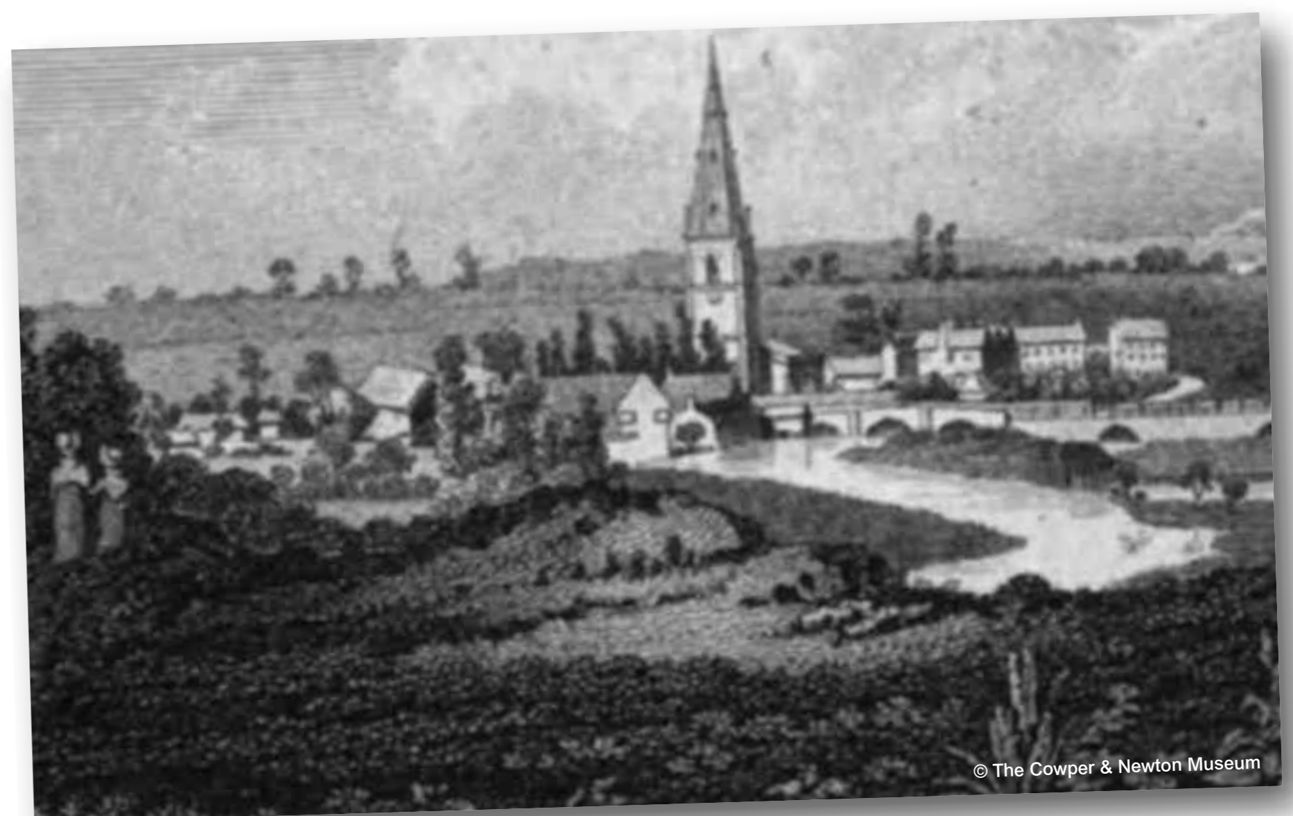
'The Rural Walks of Cowper: Displayed in a Series of Views Near Olney, Bucks. Representing the Scenery Exemplified in His Poems: with Descriptive Sketches, and a Memoir of the Poet's Life' James Sargent Storer, 1822