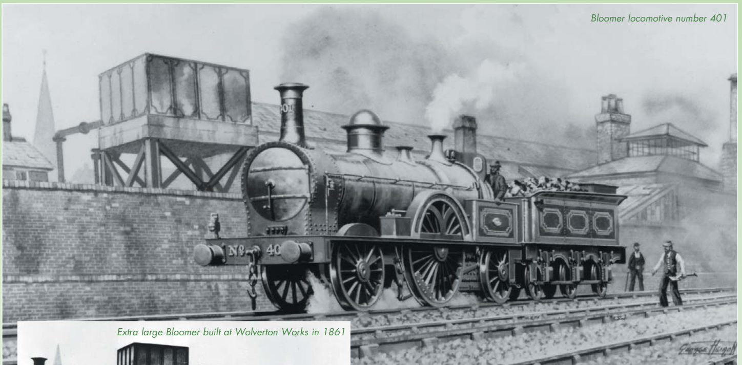
Bloomer locomotive number 401