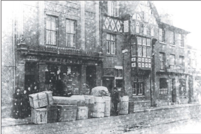
Market Square, Stony Stratford