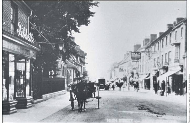
High Street Stony Stratford