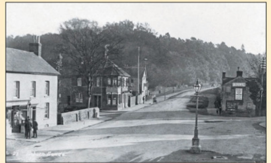
View from the Swan Hotel