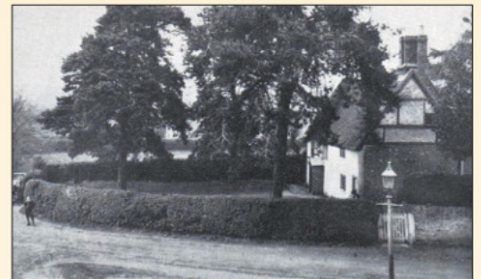
The Friends Meeting House

Woburn Sands did not exist by that name until relatively recently. "Hogsty End" was the term covering the area of what we know as present day Woburn Sands. This unattractive sounding "End" was one of several which formed the village of Wavendon; others included Cross, Church and Lower End. Wavendon can be found in the Domesday Book, a tiny group of farms and peasants. Obviously swine were farmed, and probably the main piggeries were away from the church and centre of Wavendon.