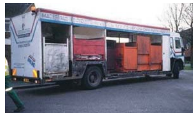
First recycling vehicle