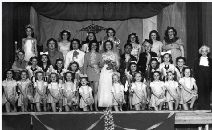
A Sunday school pantomime at the Church Institute, c1960s

'At Madcap we believe there is creativity inside everyone.'