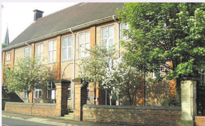
The present day 'Madcap'