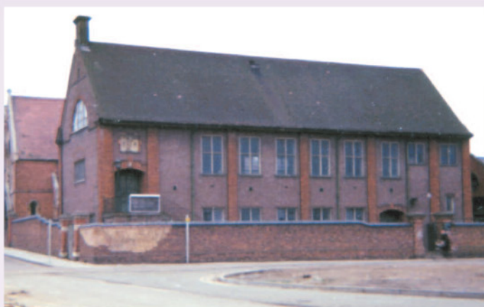
The Church Institute, Wolverton 1973