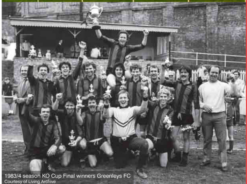
1983/4 season KO Cup Final winners Greenleys FC