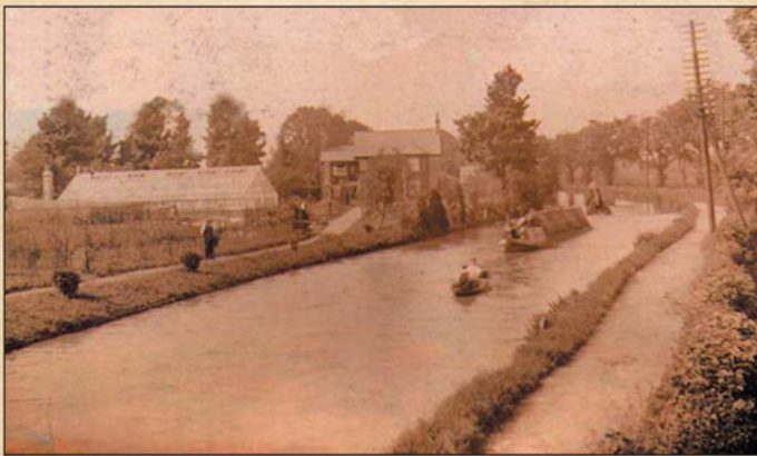
Old Wharf House, Simpson showing the glasshouses

Mr Bourne of Olde Warfe House, Simpson, 1909 - 1916