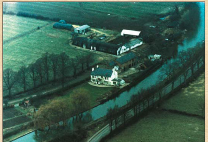
Aerial view of Holmfield 1967

The Olde Warfe House Nursery, alongside the Grand Junction Canal in Simpson Village, has prospered. Its first catalogue was published in 1911, its daffodil bulbs sent all over the kingdom, and its new breeds have won prizes at shows.