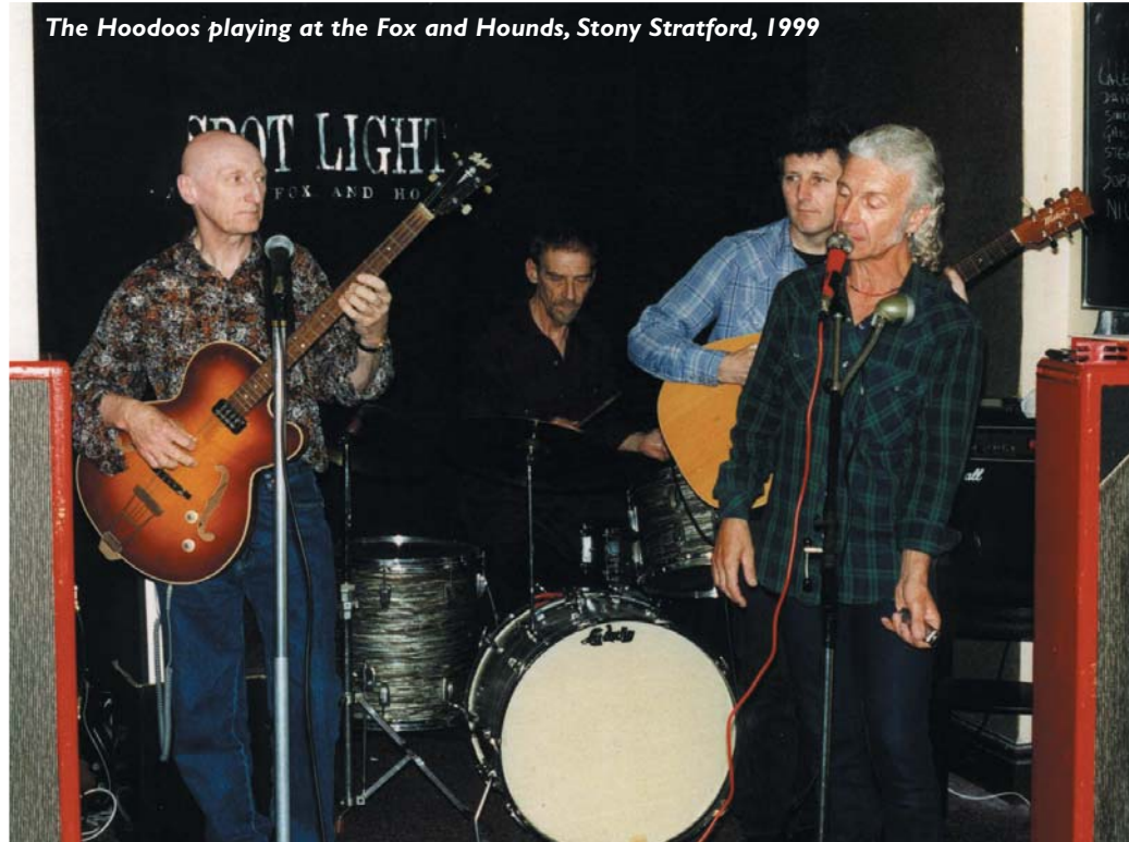
The Hoodoos playing at the Fox and Hounds, Stony Stratford, 1999