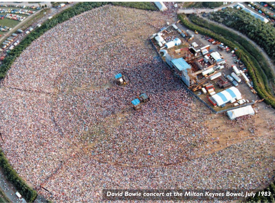
David Bowie concert at the Milton Keynes Bowl, July 1983