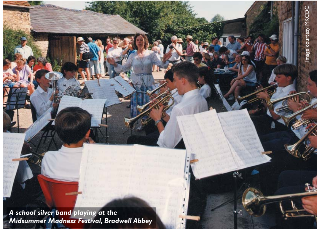
A school silver band playing at the Midsummer Madness Festival, Bradwell Abbey