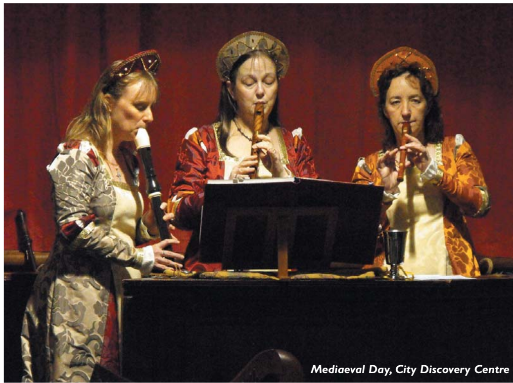
Mediaeval Day, City Discovery Centre