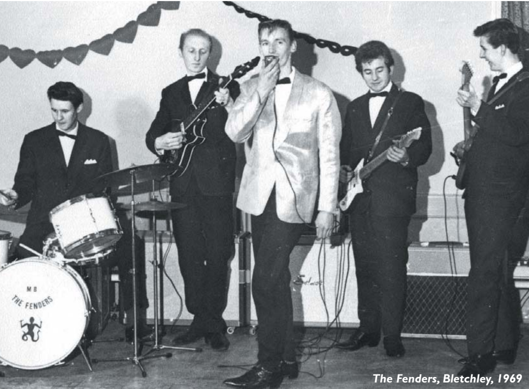
The Fenders, Bletchley, 1969