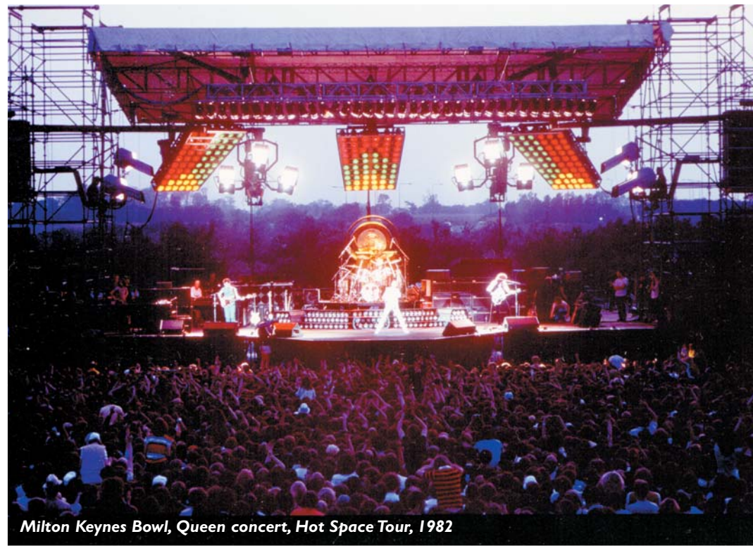
Milton Keynes Bowl, Queen concert, Hot Space Tour, 1982