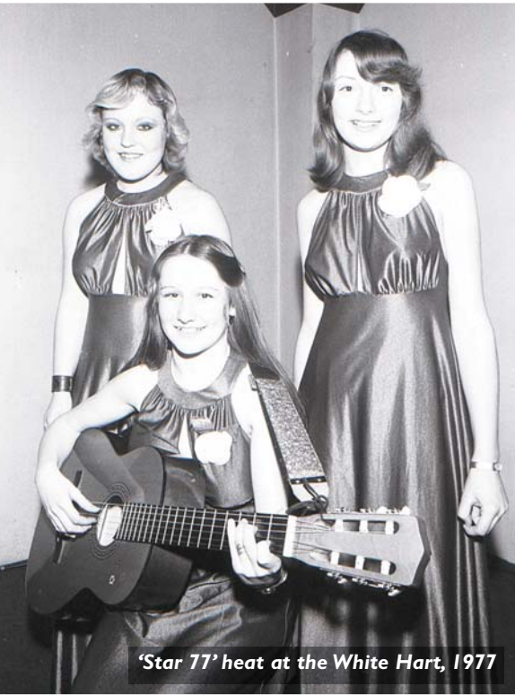
'Star 77' heat at the White Hart, 1977