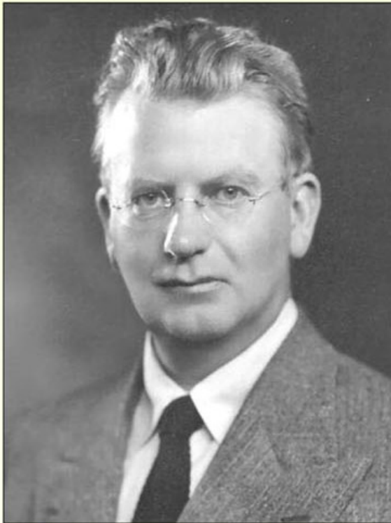
John Logie Baird

In 1922, more than 20 years after Marconi had demonstrated his radio, the BBC began broadcasting from 2LO transmitter in London. The potential to develop radio or “wireless” as a form of entertainment had been shown by the millions of crystal sets in use. They were popular because they were cheap and simple so that thousands were built in the home.