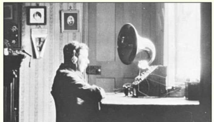
Home-made radio set in use 1925

The wide interest in radio technology helped develop the skills for future development during the war and for post-war entertainment.