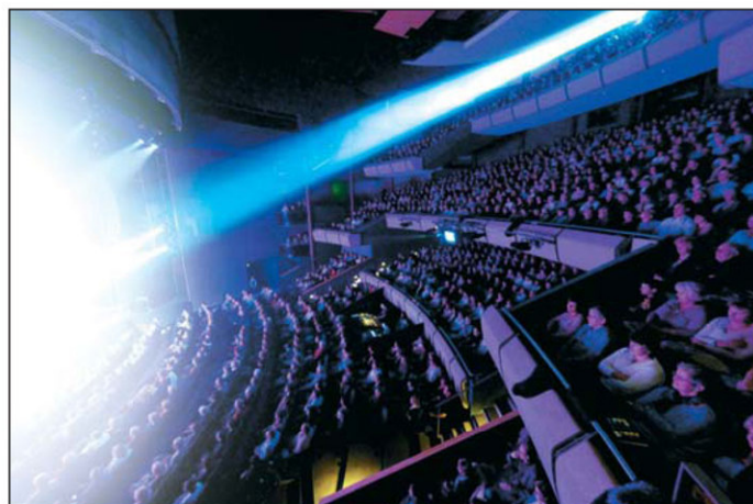
The Milton Keynes Theatre Auditorium

'We believe there is creativity inside everyone.'