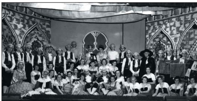
The cast of the 1951 production The Gondoliers at the Empire Cinema, Wolverton