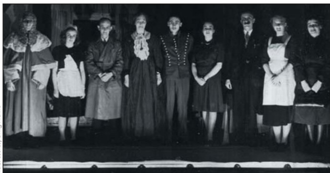
The cast of A Night Must Fall at the Science and Art Institute, Wolverton c 1950