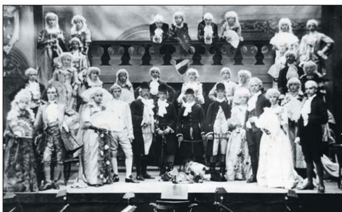
Wolverton Operatic Society c 1950