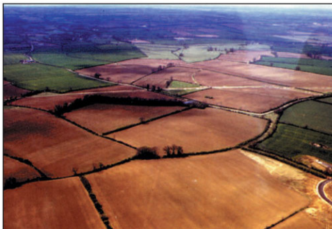
The fields where Central Milton Keynes would be built, 1974