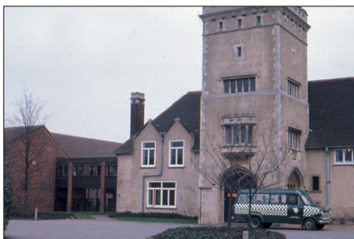
The headquarters of Milton Keynes Development Corporation, Wavendon Tower