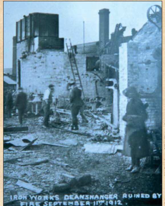
Fire damage at the foundry