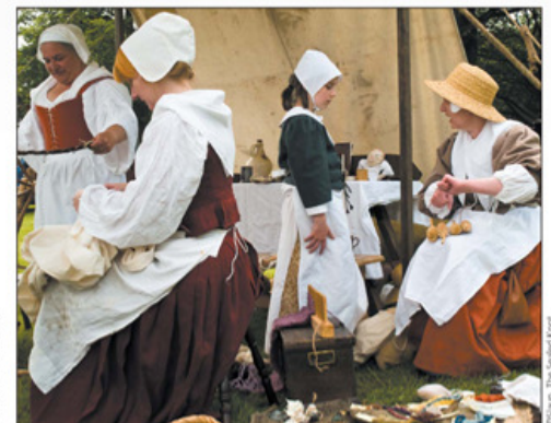
Camp Followers accompanied soldiers to the garrison and battlefield, their 'trayne' was often larger than that of the army.

The Garrison army was made up of Regiments of Foot (pikeman and musketeers), Troops of Horse (cavalry), Dragoons (mounted musketeers), a 'trayne' of artillery and an accompanying baggage of camp followers catering to soldiers needs. Cannon were sited on bulwarks along the ramparts, as well as being used alongside mortars as field artillery.