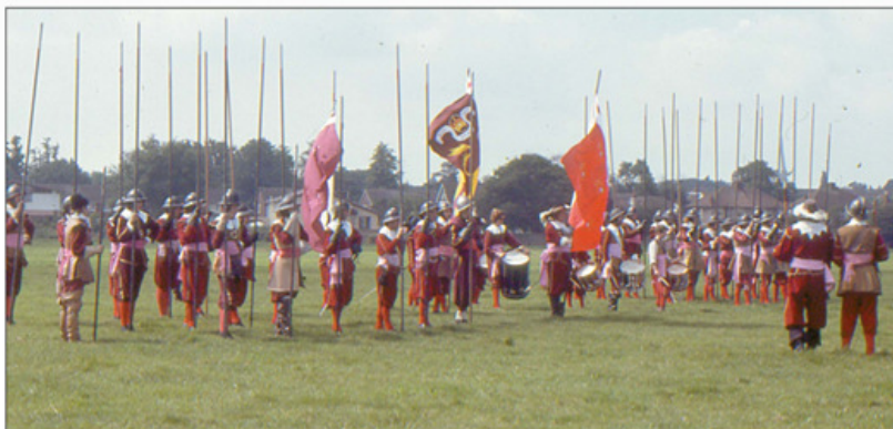
Pikeman on Parade, Sealed Knot at Riverside Meadows, August 1980.