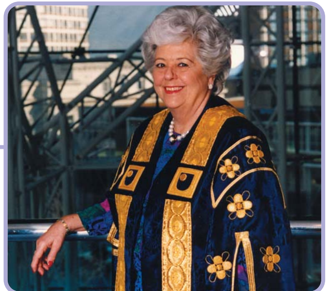
Baroness Betty Boothroyd of Sandwell was Chancellor of The Open University between 1994 and 2006

Jocelyn Bell Burnell was appointed as the first female professor of physics in the UK.