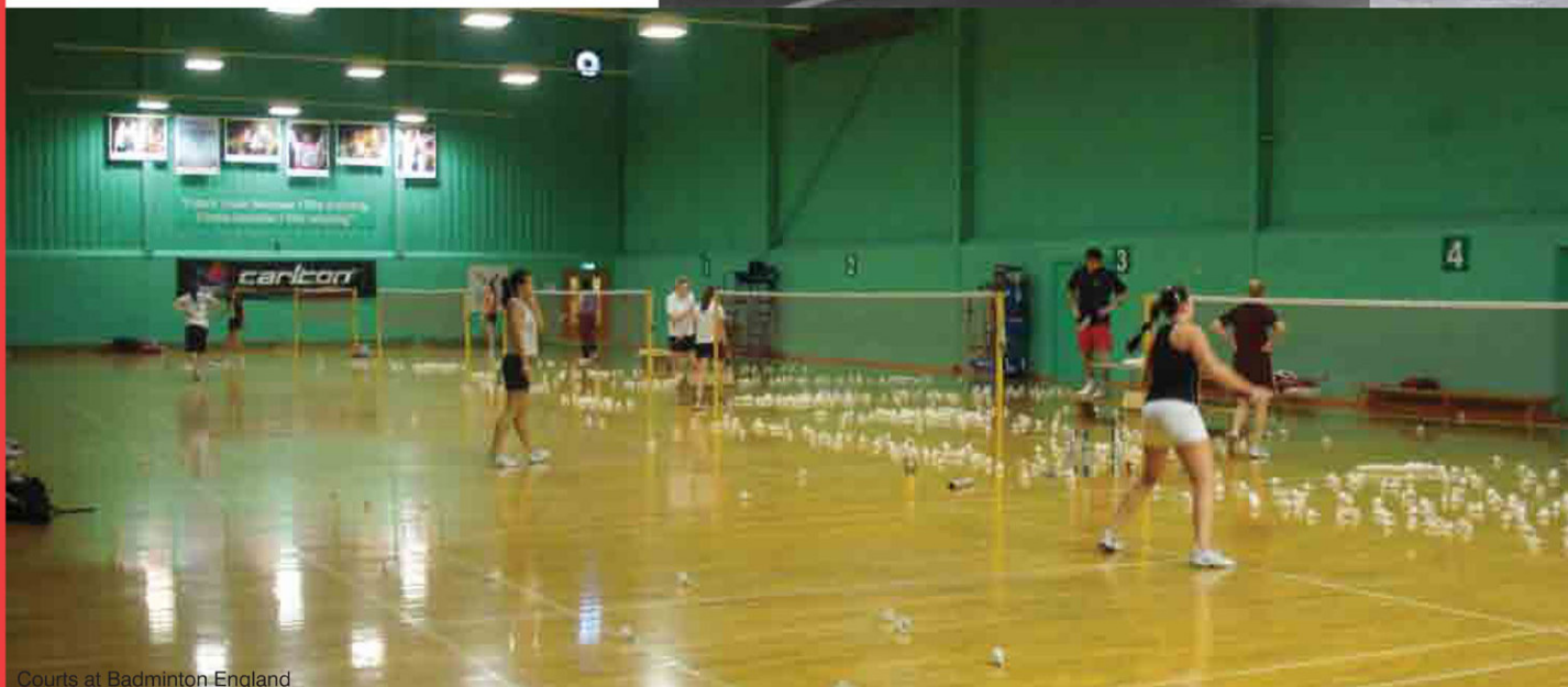
Courts at Badminton England