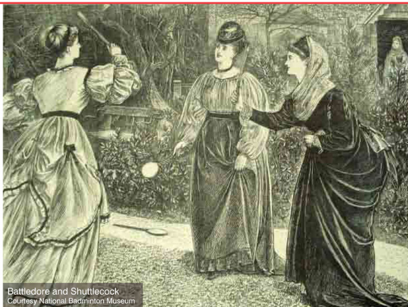
Battledore and Shuttlecock

In 2003, the National Badminton Museum was launched, becoming a charity in 2007. Its aim was to tell the story of badminton nationally, through its collections of museum objects, archives, photographs and library research material. The museum houses collections of national and international material that can be viewed throughout the centre. For further information www.badmintonengland.co.uk