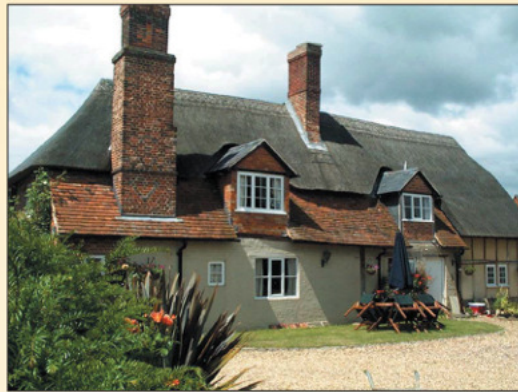
Bird's Cottage 2000