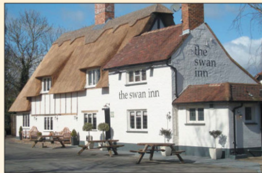
The Swan today