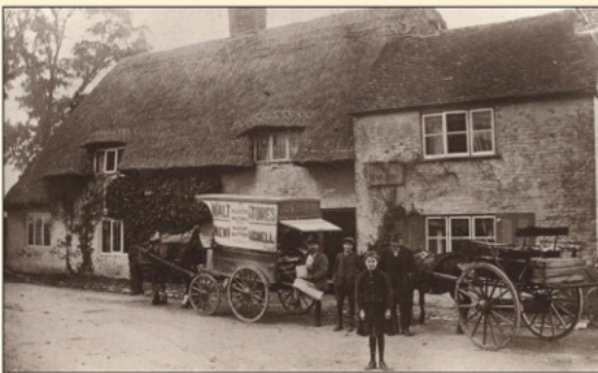
The Swan 1914-18