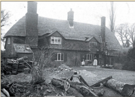
Bird's Cottage c1900