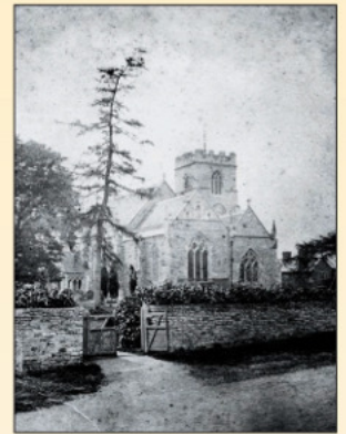
All Saints Church pre-1875