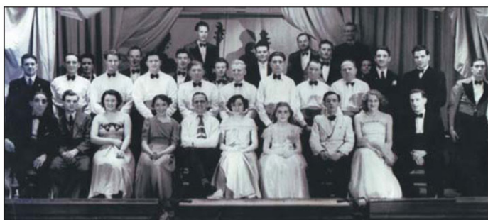
The Rhythm Aces Band and the Welsh Exiles Choir c 1950 Performed for many charity events at Wolverton Works Canteen. The Rhythm Aces Band also broadcast on BBC Radio in 'The Works Wonders' (1948).