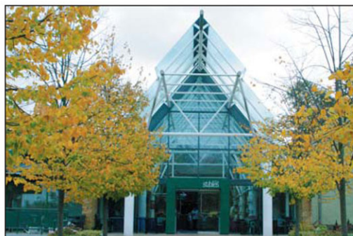
The Stables, Wavendon, Milton Keynes 2011 'Milton Keynes' premier live music venue offering excellent live music for all tastes – jazz, blues, folk, rock, classical, pop and world...' (see www.stables.org )