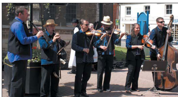
StonyLive! 2011... '...a festival for the community of Stony Stratford'