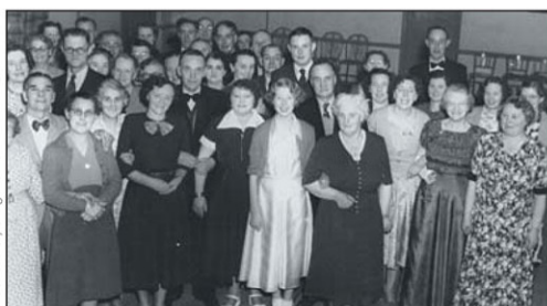
Old Time Dance at the Crauford Arms, Wolverton, 1950s