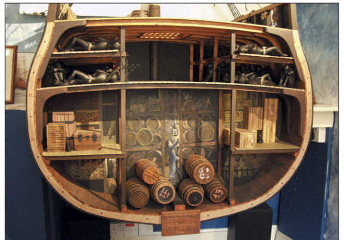
Model of a slave ship in the museum

After a long struggle the campaign was successful, and the slave trade was abolished throughout the British Empire in 1807, shortly before Newton's death.