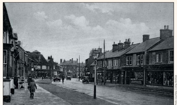
Bletchley late 1920s. The old gas lamps are still in place