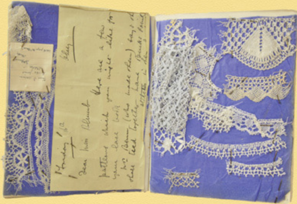
Lace-making Project Book 1926 - 1936 From Stony Stratford Primary School