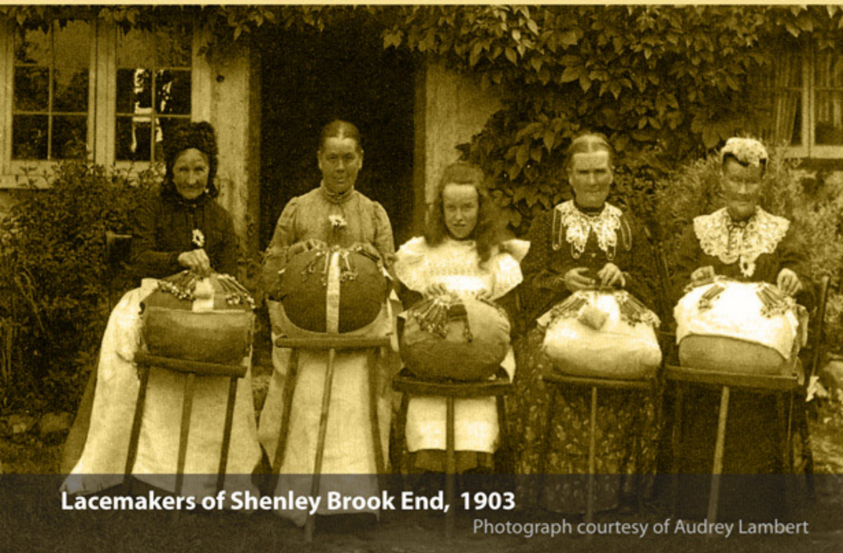
Lacemakers of Shenley Brook End, 1903