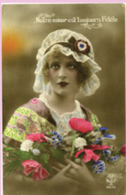
Postcard sent from a soldier to his sweetheart in Fenny Stratford, 1918 Wooden doll found under floorboards in a house in Bletchley, 19th Century

Images © MK Arts for Health unless otherwise stated