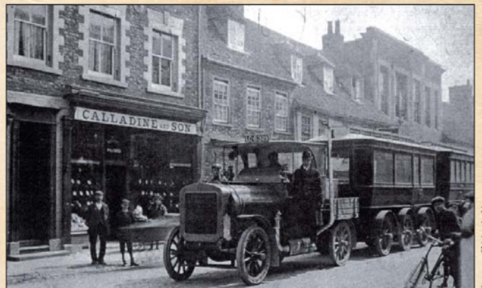
Going for a spin, a motorist outside The Mounts, Deanshanger, c1900