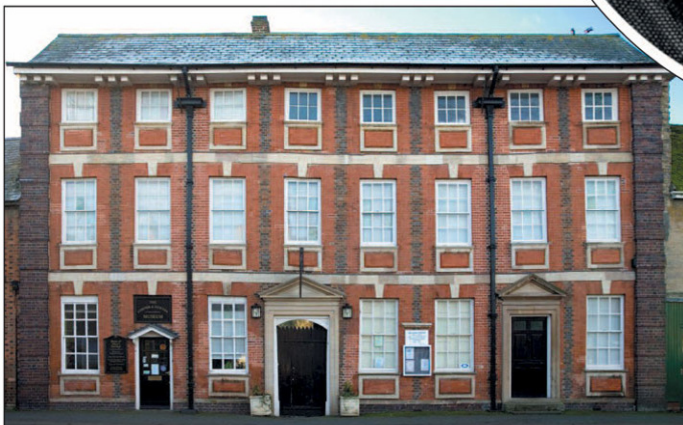
The Cowper and Newton Museum in Olney. Originally William Cowper's home