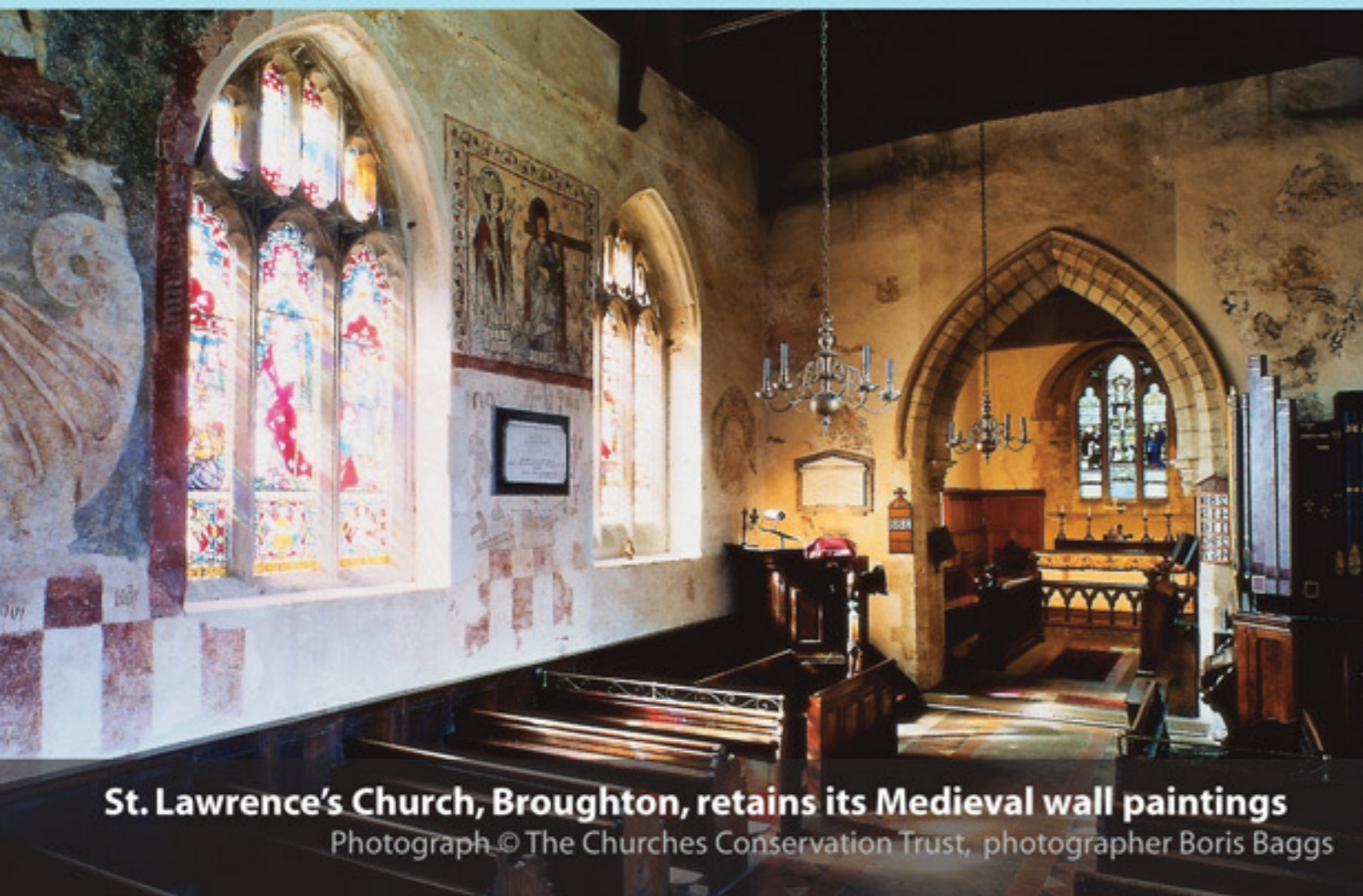
St. Lawrence's Church, Broughton, retains its Medieval wall paintings