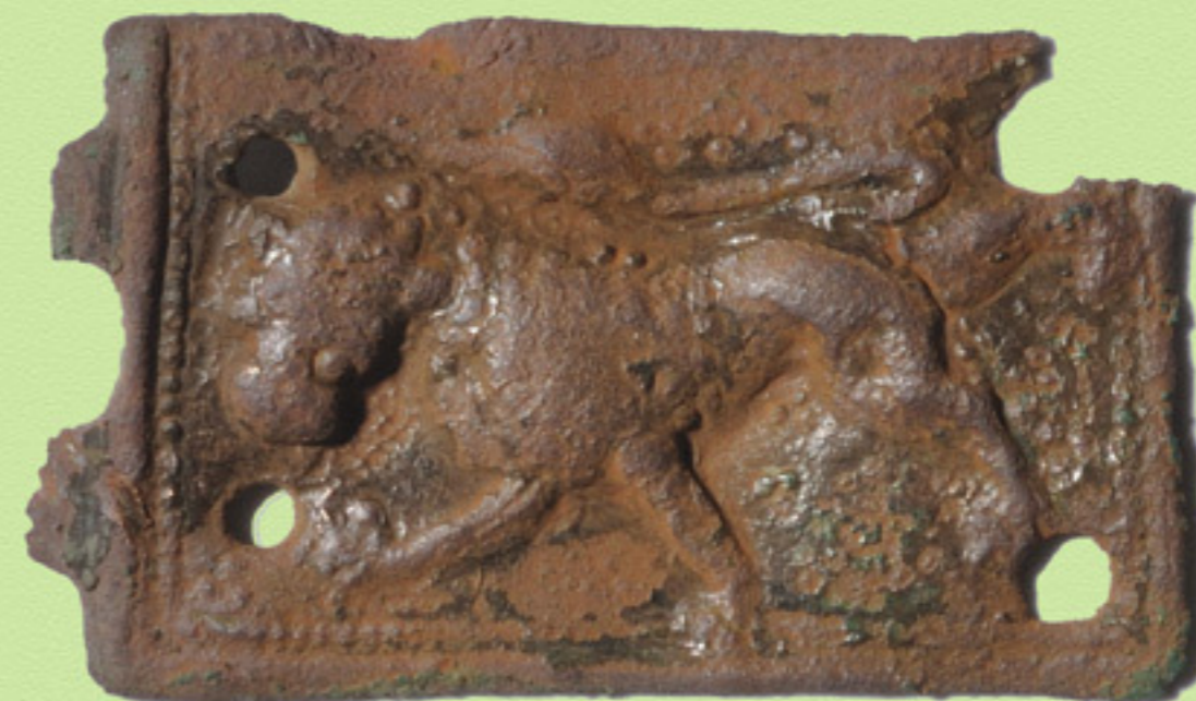
Buckle 14th - 15th Century Found in Westbury