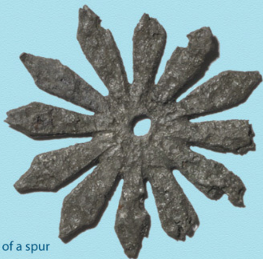
Star Rowel, part of a spur 14th Century Found in Wavendon