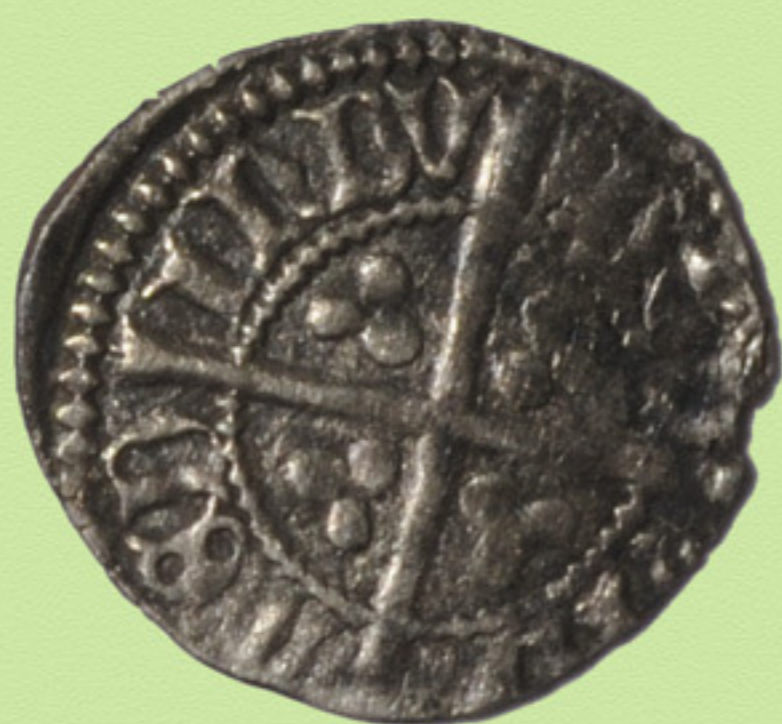
Silver Penny, Scottish, Robert III 1393 AD Found in Westbury