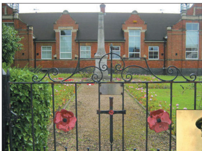
War memorial near Knowles Junior School, Queensway, Bletchley