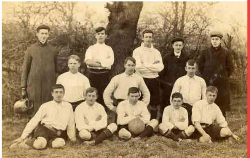
Stony Stratford Baptists FC 1906-07