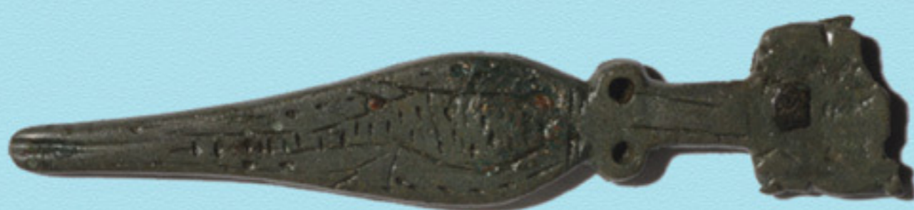
Strap-end (worn at the end of a belt) with the image of a peacock 4th Century AD Found in Wavendon Gate