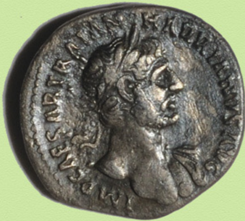
Silver Denarius Coin with head of Emperor Trajan 118 AD Found in Shenley Brook End