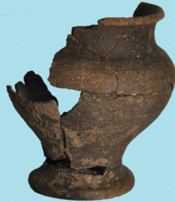
Pottery 1st Century AD Found in Wavendon Gate