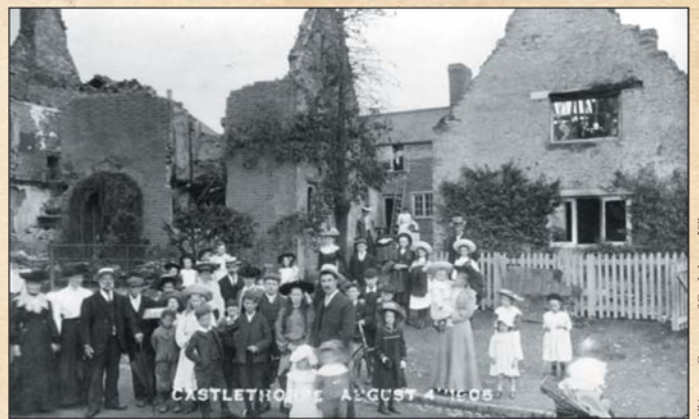
Scenes of devastation caused by the fire. (There is some discrepancy with the actual date of the fire as reported in the Bucks Standard of the 12th).

A relief committee has been formed to distribute 'a good sum' and clothes, 'of which happily they had received a large number.'