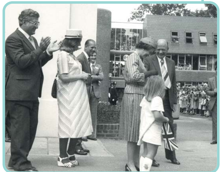
The visit of The Queen and Prince Philip to The Open University in 1979.