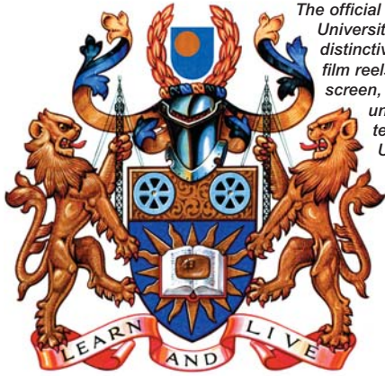
The official crest of The Open University, showing the distinctive television masts, film reels and television screen, to acknowledge the unique and innovative teaching style of the University.