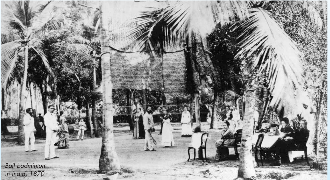
Ball badminton in India, 1870

During the 19th century various forms of the game of badminton are recorded as being played in England and also various other parts of the world. It was popular in India and enjoyed by many of the English people stationed in that country. Various names were attributed to the new sport, for example Poona which was an important British military base. Sometimes the shuttlecock was replaced by balls of wool – these were more easily controlled in the wind and this game was called ball badminton. There are also records of the game having reached New York and Boston. At this time the hour-glass shaped courts were often used and up to five players would take part on either side of the net. The need for rules and an official body to standardise the game was pressing – this came about in 1893 when the Badminton Association was founded in Southsea, England.