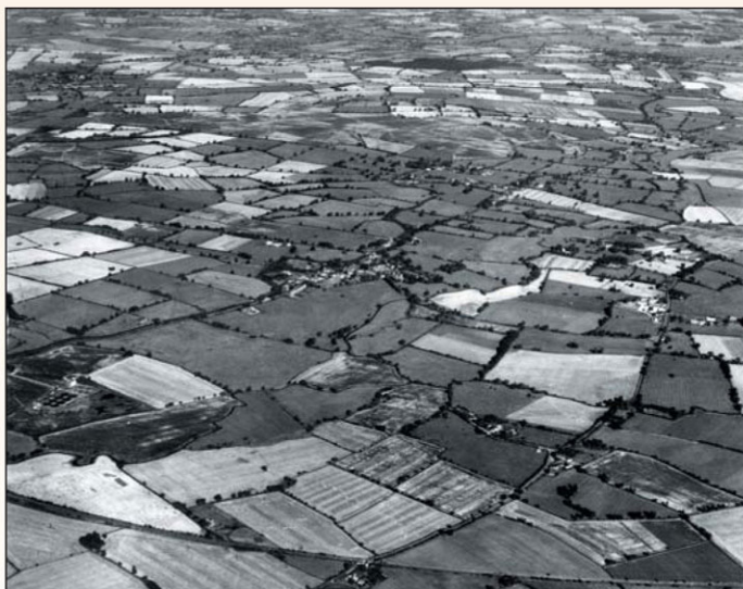
The designated area of Milton Keynes c.1970