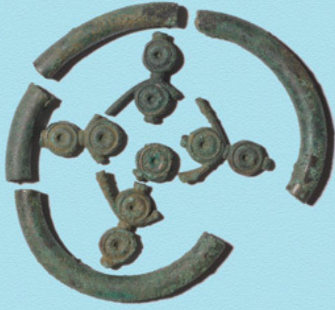
Ceremonial Sun Cult item, one of several metal wheel-shaped items held by Buckinghamshire County Museum in Aylesbury Iron Age Found in Wavendon Gate