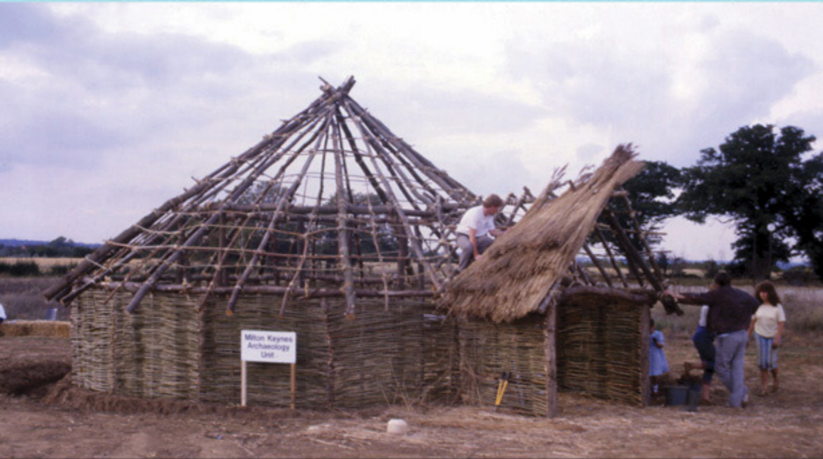
Reconstruction of an Iron Age Roundhouse, Wavendon Gate