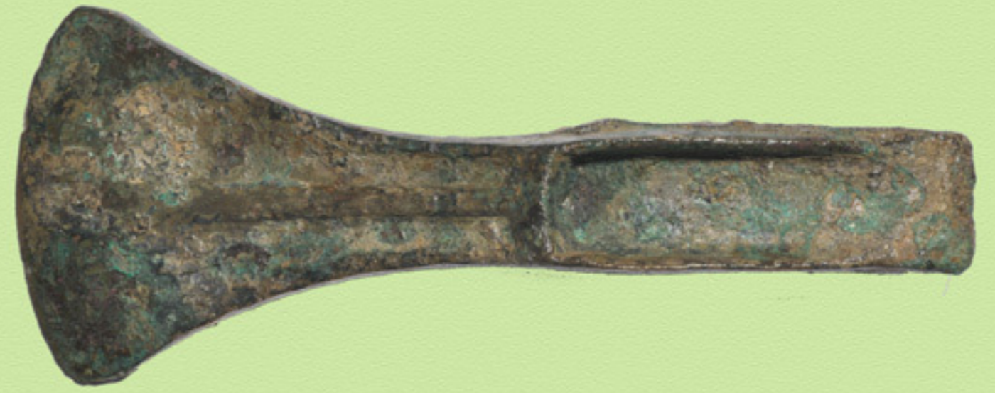
Palstave Axe Head Bronze Age, 1200 BC Found in Shenley Brook End