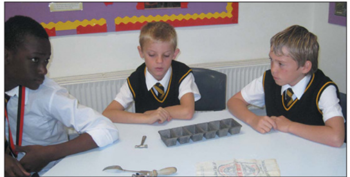
We explored artefacts from Milton Keynes Museum