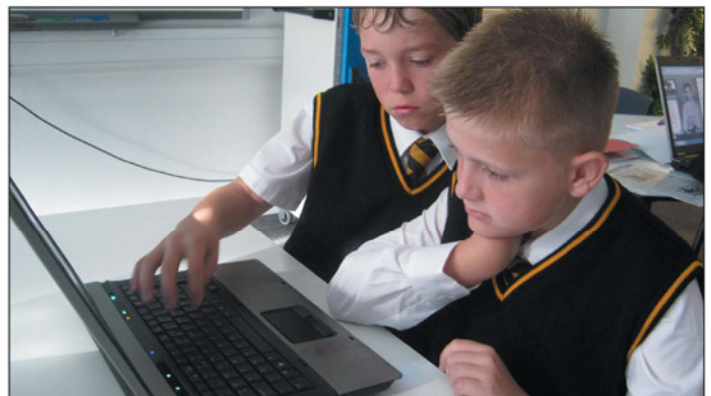
We wrote and researched the exhibition